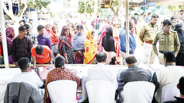
People wait in queues during hearings under the Special Intensive Revision of electoral rolls, at Krishnanagar, in Nadia, West Bengal.