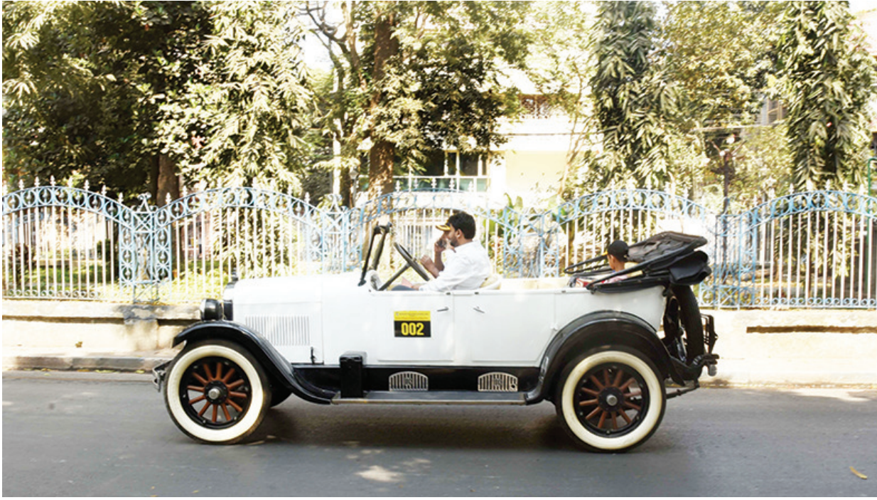
A vintage car can be seen participating in a Vintage Car Rally in Kolkata on Sunday.

From PG 1 Dozens of destinations were closed to tourists in Kashmir following the terror attack that killed 25 tourists and a local pony operator at the Baisaran meadow near Pahalgam. Officials say the closures reinforced the notion that the Valley was unsafe for visitors. Some of these places were gradually reopened, although hotspots such as Doodhpathri and Yusmarg are still out of bounds for tourists, as is Baisaran. Shah reviewed key sectors such as road infrastructure, power, industry, tourism, and 4G and optical fibre connectivity at the meeting, officials said. An official spokesperson said Shah's visit had underlined the Centre's resolve to make development, peace and security in Jammu and Kashmir a national priority.