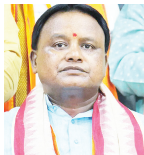
Odisha Chief Minister Mohan Charan Majhi

Among the signature proposals are integrated re-