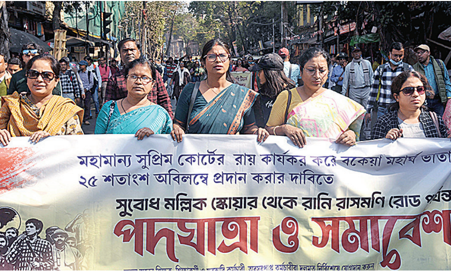
State Government employees took part in a rally during their demand after the Supreme Court ordered the West Bengal government to pay 25% of pending Dearness Allowance (DA) arrears as soon as possible in Kolkata on Sunday.