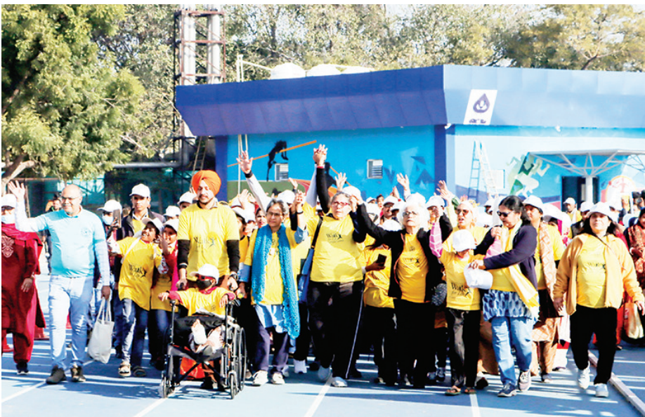
Cancer survivors, doctors, volunteers and others take part in the 19th annual 'Walk For Life - Stride Against Cancer' walkathon organised by CanSupport at the JLN Stadium, in New Delhi on Sunday.

Drawing on his own background as a product of the government school system, he reaffirmed his dedication to prioritising the quality of education. Sukhu also highlighted the state's aggressive push to promote sports and sports tourism. He announced that the state government would provide employment opportunities to female athletes from Himachal Pradesh who have recently competed in the Asian Games. To celebrate the victory of the Himachal team in the National Handball Championship, he announced a cash prize of Rs 20 lakh.