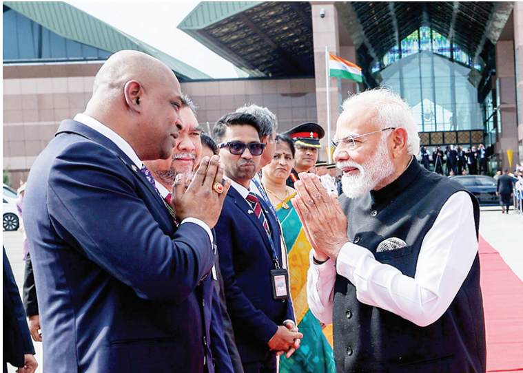
Prime Minister Narendra Modi departs for New Delhi after concluding a two-day official visit to Malaysia, in Kuala Lumpur on Sunday.

Both Modi, who arrived in Kuala Lumpur on Saturday, and Ibrahim appreciated efforts to promote the usage of local currencies - the Indian Rupee and Malaysian Ringgit - for trade settlement. "We will pave the way for economic transformation through strategic trust," Modi said, describing the India-Malaysia relationship as "special". "We are maritime neighbours. For centuries, our peoples have had deep and cordial ties," he said in his media statement. Modi also announced India's decision to establish an Indian Consulate General in Malaysia. In his remarks, Ibrahim