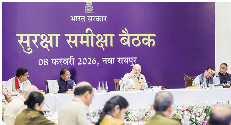
Union Home Minister Amit Shah, with Chhattisgarh Chief Minister Vishnu Deo Sai and others during a review meeting regarding anti-Naxal operations, in Raipur on Sunday.

In a post on X, Shah said the government's approach was showing re-