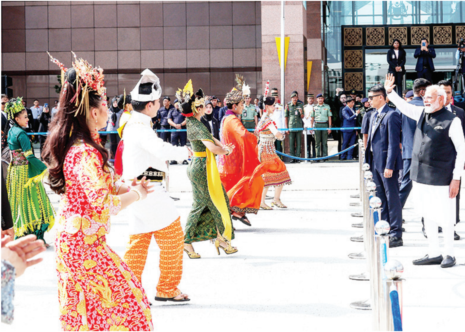
Prime Minister Narendra Modi waves as he departs for New Delhi after concluding a two-day official visit to Malaysia, in Kuala Lumpur on Sunday.

Within 24 hours of the website launch, more than 1.71 crore people expressed that the "LDF will go and everything will be fixed", implying that the UDF may have a good chance. The website also has "charges" against the Vijayan government on the Sabarimala gold heist, farmer distress, drugs menace, public health, a massive public debt and communal actions.