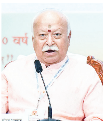
RSS chief Mohan Bhagwat addresses a gathering during the 'New Horizons' lecture series marking the organization's centenary year, in Mumbai.

Responding to a question, the RSS chief said doctors have advised that marriages between the