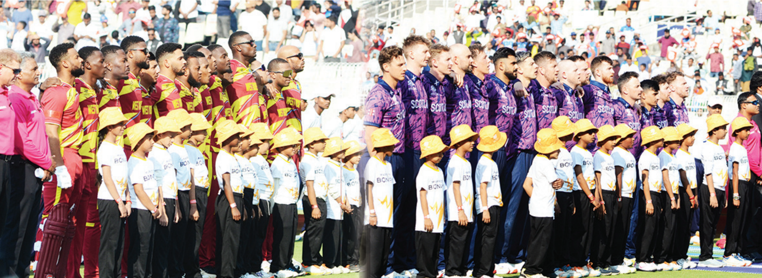
West Indies and Scotland players during the national anthems ahead of their ICC Men's T20 World Cup match at Eden Gardens, Kolkata, on Saturday.