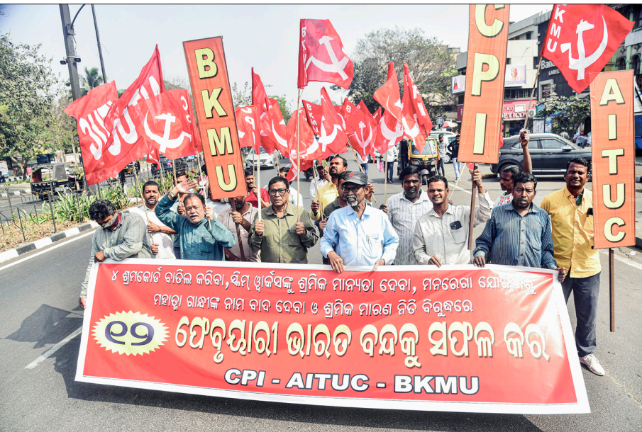
Communist Party CPI members took out a demonstration rally in support of 12th February- Bharat Bandh, in Bhubaneswar on Saturday.