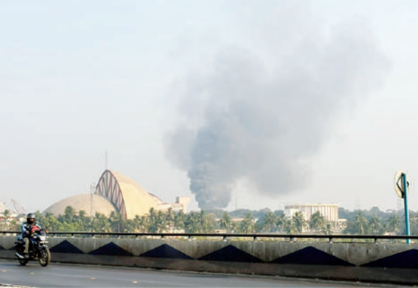
Thick black smoke engulfing the area behind Science City was captured from the Maa Flyover as a major fire broke out at a sofa and furniture manufacturing factory in the Topsia area on Friday afternoon.

Addressing party workers and supporters, Banerjee alleged that families from Kanthi and South 24 Parganas were being wrongly identified as Bangladeshi nationals and pushed across the border.