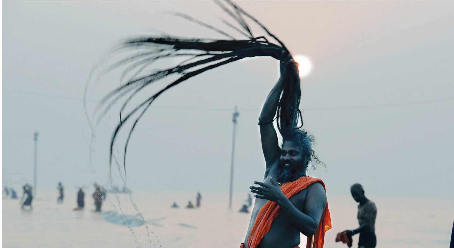
A sadhu whirls his flowing jata after taking a Holy dip in the River Ganga at sunrise, on the occasion of Makar Sankranti at the Gangasagar Mela, Sagar Island, on Wednesday.