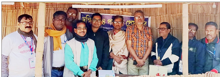
In a humanitarian initiative, South 24 Parganas Press Club organised a medical camp at the Gangasagar Mela.

Enhanced security arrangements include 1,200 CCTV cameras from Lot No. 8 to the mela grounds, 20 aerial drones for surveillance, and 21 operational jetties, including 10 permanent ones at Lot No. 8 and Namkhana. The river fleet comprises 13 barges, 45 vessels, and 100 wooden launches. Nabanna has deployed around 2,500 buses to ferry pilgrims from major transport hubs in Kolkata directly to the mela site. Officials said all arrangements have been finalised to ensure a safe, smooth, and incident-free Gangasagar Mela.