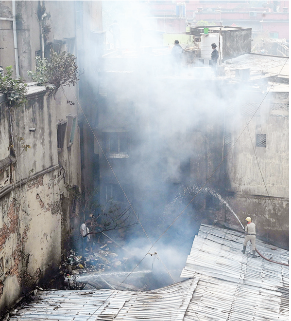
Firefighters battle a blaze at several furniture shops on B.B. Ganguly Street in Kolkata on Wednesday.

This week, Mamata Banerjee is scheduled to visit North Bengal for a two-day trip. On January 16, she will lay the foundation stone of the Mahakal temple in Siliguri, followed by a program in Jalpaiguri on January 17. Last October, North Bengal was hit by natural disasters, and the Chief Minister had personally visited multiple affected areas to support the victims. During that visit, she had performed puja at the Mahakal temple in Darjeeling and announced the construction of the state's largest Mahakal temple in Siliguri.