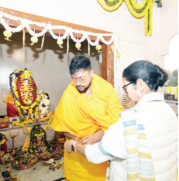
West Bengal Chief Minister Mamata Banerjee offers puja at the Bagala Maa Temple at Kalighat in south Kolkata on Wednesday.

From PG 1 numbers. It is also about signalling priorities and reassuring core voters," a senior political observer said. The budget session will follow the completion of the ongoing Special Intensive Revision (SIR) of electoral rolls, with hearings scheduled to conclude on January 31 before the publication of the final Voters list on February 14 as per schedule. . . There is particular interest over whether New Delhi will announce steps to clear the state's long-pending dues, an issue the TMC has consistently foregrounded in its confrontations with the Centre. Senior TMC leaders said the contours of the state's Vote On Account would also depend on what fiscal space remains after the Union Budget, especially in terms of central transfers and borrowing limits. "The state's fiscal planning will naturally factor in what the Centre announces or does not announce for Bengal," a senior TMC leader and MLA said. As campaigning gears up and parties fine-tune their narratives, the interim budget is expected to serve as more than a routine fiscal exercise. For the ruling TMC, it could be a statement of intent before seeking a renewed mandate; for the opposition, a document to scrutinise for "pre-poll inducements".