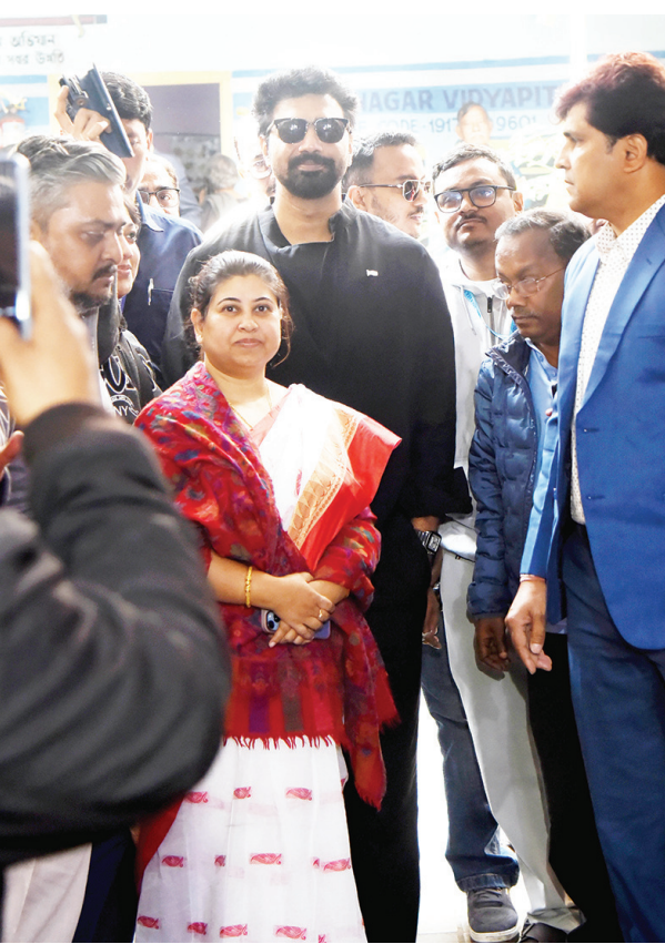
Actor and Trinamool Congress MP Dev appeared at a hearing for the Special Intensive Revision (SIR) of electoral rolls in Kolkata on Wednesday.

Congress (TMC) national general secretary has been conducting large-scale health initiatives. Since January 5, two TMC representatives have been deployed to cover the two Nandigram blocks. Ahead of the upcoming assembly polls, TMC is adopting a focused outreach strategy in Nandigram, with block-level core committees managing organizational work. Through the health camps, the party aims to maintain direct engagement with residents. Abhishek had recently mentioned receiving multiple requests from Nandigram residents to organize such programs, prompting the initiative. The BJP, however, has criticized the event as a political stunt.