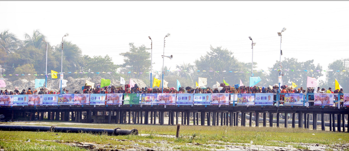
Large number of pilgrims made their way towards Gangasagar in South 24 Parganas on Monday.