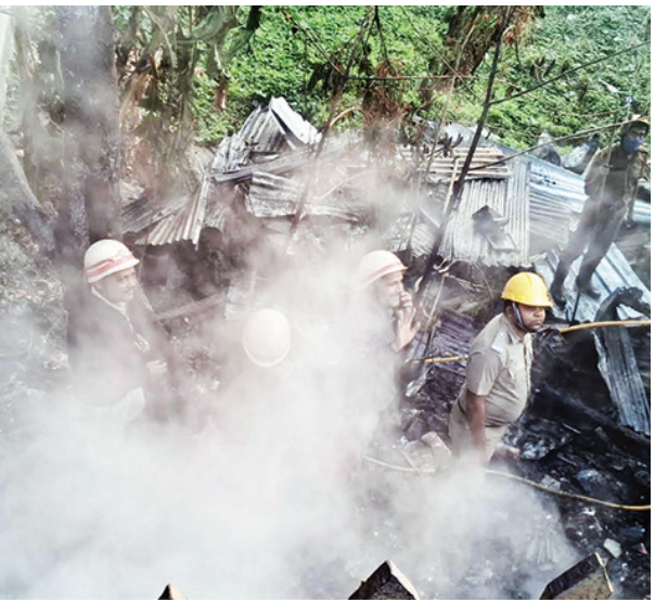
Firefighters battle a blaze after a fire broke out at shops outside Baghajatin railway station in south Kolkata.

According to Banerjee, the process was being carried out without adequate planning, leading to fear, intimidation, and an excessive workload on field-level staff. She alleged that over-reliance on technical data without proper human verification was compounding the problem. "I am deeply shocked and disturbed by the manner in which the Election Commission of India appears to be relentlessly harassing ordinary citizens," she wrote. The chief minister appealed to the Commission to immediately intervene and ensure that voters are not deprived of their democratic rights due to procedural lapses. The Election Commission has not yet issued a formal response to the latest letter.