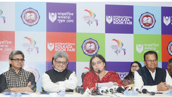
A press conference was held in Kolkata to announce the 49th International Kolkata Book Fair and the Kolkata Literature Festival (KLF), scheduled to be held in January.

focus will be on taking the government's 15-year performance report—described by the party as a "development report card"—to every household through digital outreach. Emphasis will also be placed on promoting the government's achievements in social welfare, infrastructure, education, and health sectors. Political observers note that the Bharatiya Janata Party was the first in India to demonstrate the electoral power of social media during the 2014 Lok Sabha elections, when Narendra Modi's campaign leveraged digital platforms extensively. Since then, IT cells have become an integral part of political organisations across the spectrum. While Trinamool Congress already has an IT cell in place, the new programme signals Abhishek Banerjee's intent to further decentralise and strengthen digital campaigning down to the booth level. The digital warriors will not only promote the party's narrative but will also be tasked with countering BJP's messaging and highlighting issues where the opposition can be politically challenged.