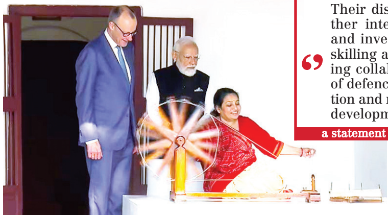
Prime Minister Narendra Modi and German Chancellor Friedrich Merz visit Sabarmati Ashram during the German leader's maiden India trip, in Ahmedabad.

MI News Service, Ahmedabad : Prime Minister Narendra Modi and German Chancellor Friedrich Merz began their visit to Ahmedabad on Monday morning at the Gandhi Ashram, and after paying homage to Mahatma Gandhi there, they proceeded to the Sabarmati Riverfront for the inauguration of the International Kite Festival 2026. Chancellor Merz arrived here early on Monday morning on a two-day maiden official visit to India. Sabarmati Ashram, also known as Gandhi Ashram, was established by Mahatma Gandhi in 1917. It was home to Gandhi from 1917 until 1930 and served as one of the main centres of India's freedom struggle. At the historic Gandhi Ashram on the banks of the Sabarmati River in Ahmedabad, both the dignitaries paid floral tributes to the statue of Mahatma Gandhi. Later Prime Minister Modi inaugurated the International Kite Festival-2026 at