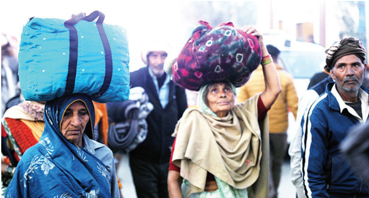
Thousands of pilgrims are heading towards Gangasagar from across the country on Monday, for a week-long pilgrimage at the confluence of Bay of Bengal.