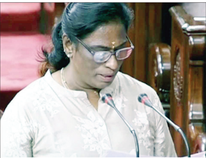
long-term athlete development models that are aligned with international standards. The National Olympic Academy (NOA) has been reactivated as a key part of this initia-

Education and Development Programme (NOEDP) has been conceived as a comprehensive national framework to deliver structured education and development programmes across the Olympic ecosystem. The programme will be implemented in collaboration with National Sports Federations (NSFs) and State Olympic Associations (SOAs), ensuring wide outreach and grassroots-to-elite impact. The key focus areas of the NOEDP include promoting Olympic values, education and ethics, ensuring holistic athlete development with strong emphasis on welfare and career transition support, building the capacity of coaches, officials, administrators, and support personnel, strengthening governance, leadership, and professionalism within sports bodies, and implementing