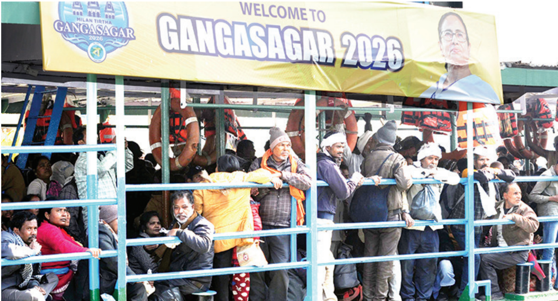
Hundreds of pilgrims from across the country were seen heading towards Gangasagar in a crowded vessel on the Muriganga river on Monday.