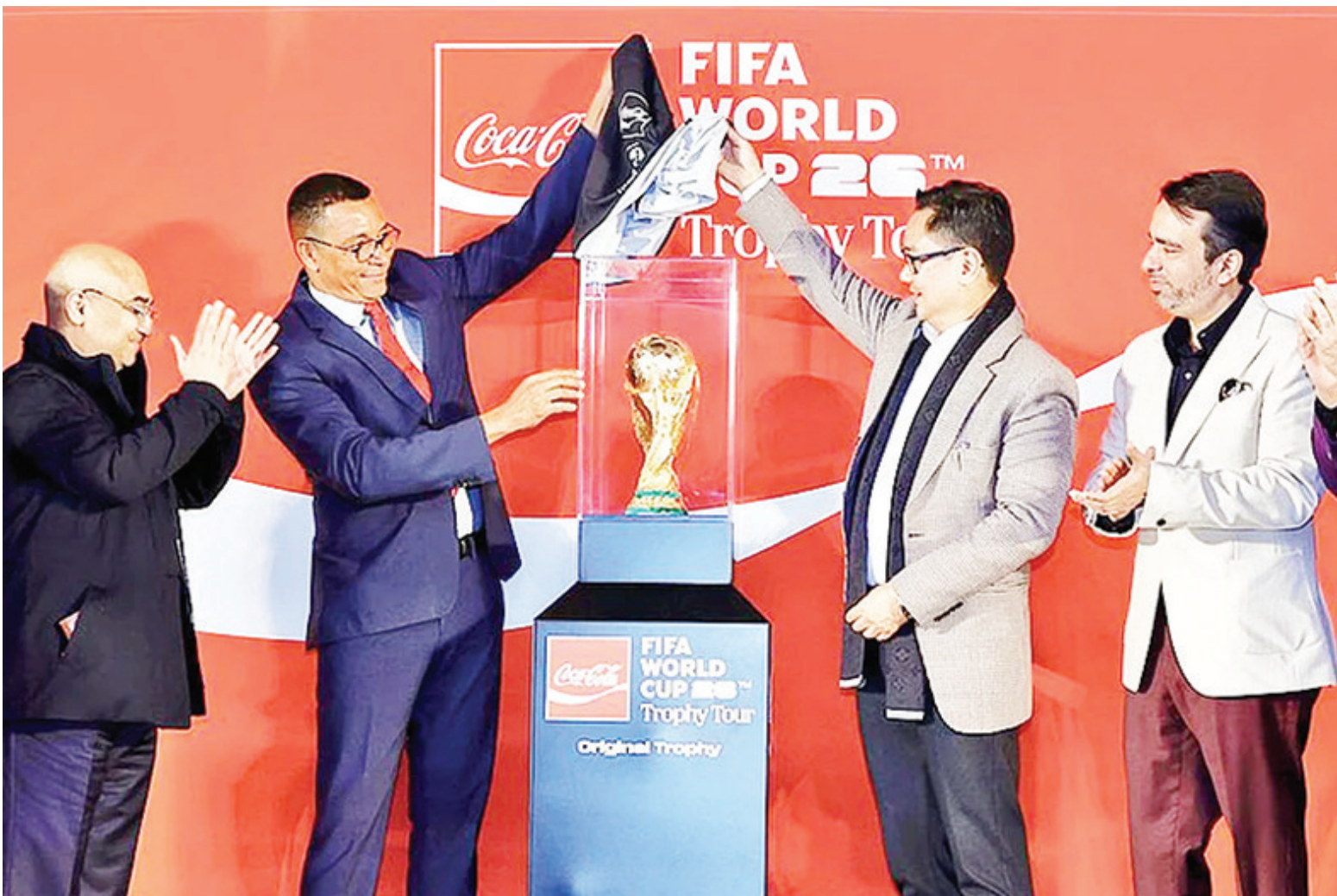
Union Minister Kiren Rijiju attends the FIFA World Cup trophy tour by Coca-Cola, in New Delhi.

His first international journey gave him an experience that opened the doors to more adventures. Since then, he has travelled extensively across India and ventured abroad to ten countries. Recalling the beginning of his journey, the 67-year-old said that his first trip to Delhi was in 2012. At the time, June and July were off-season for his business, and he would usually close his shop and stay at home.