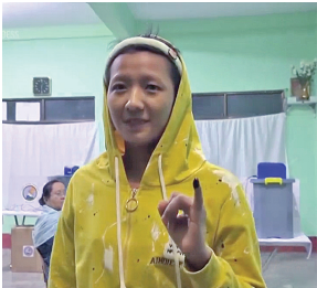
in 63 townships.

The second phase of the election was held in 100 townships across 12 of the 14 regions and states. In the Yangon region, it was held in 16 townships, including the townships of Latha, Bahan, Kyimyindaing and Kawhmu. Myanmar's multi-party democratic general election is being held in three phases, with the first phase held in 102 townships on Dec. 28 last year, and the third phase scheduled for Jan. 25 this year