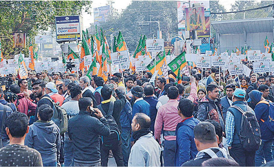
Leader of the Opposition in West Bengal, Suvendu Adhikari, along with other leaders and activists, took part in a protest rally over recent incidents in Bengal in Kolkata on Sunday.

MI News Service, Burdwan: A late-evening roadside confrontation involving a vehicle allegedly linked to political consultancy firm I-PAC (Indian Political Action Committee) and bearing a board reading “Government of West Bengal” has triggered a political storm in Burdwan, with opposition parties questioning the misuse of government identity and official insignia.