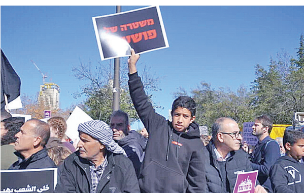
A young protester holds up a sign that reads: 'Police force of criminals' during a demonstration against how police have handled crime in Arab society, outside the Prime Minister's Office in Jerusalem, January 11, 2026.

Less than two weeks into the new year, killings are continuing at a high rate, with 16 Arab homicide victims in less than two weeks. Tensions between demonstrators and