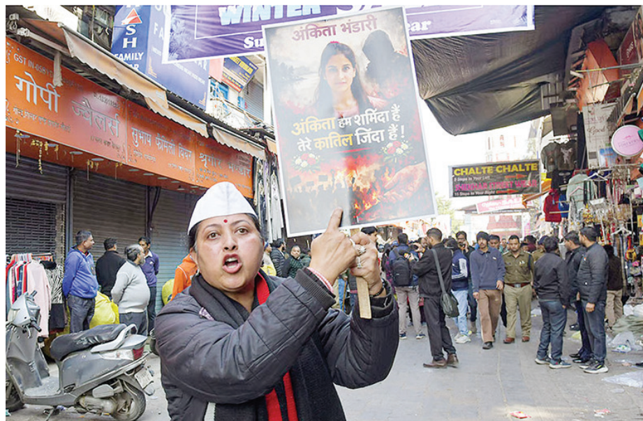
A protester holds a placard during a statewide bandh called by social groups and political organisations over the Ankita Bhandari murder case, in Dehradun.

A day earlier, Himanta Biswa Sarma, while addressing media persons said, “Constitutionally, there is no bar. Anyone can become the Prime Minister. But India is a Hindu nation, Hindu civilisation, and we will always believe, and we are extremely confident that the Indian Prime Minister will always be a Hindu person.”