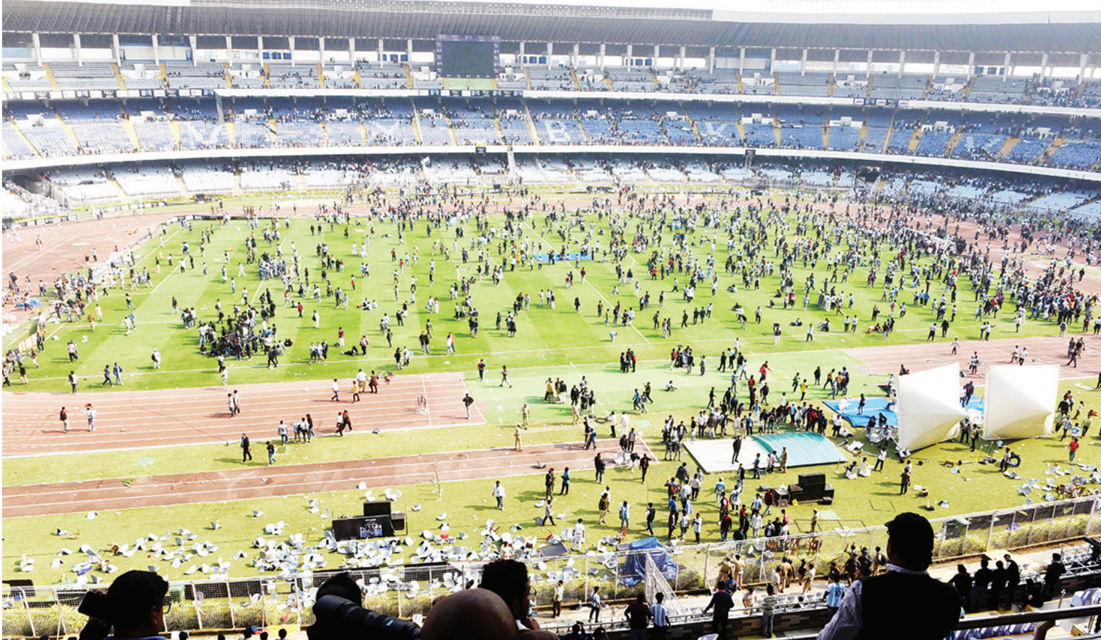
Angry fans forcibly broke through the barricades and stormed onto the turf at Salt Lake Stadium, alleging mismanagement by the organisers during Lionel Messi's Kolkata leg of the GOAT Tour after the Argentine superstar left the venue early on Saturday.

From PG 1 And finally, 'I' for innovation, daring to think ahead and to be ahead of the curve," he explained. General Chauhan further said battles in the older domains will always remain contested, often brutal. But in the new domains, they will be smart, swift, and shaped by intellect, innovation, and initiative. The force that masters new frontiers is more likely to prevail in future conflicts.