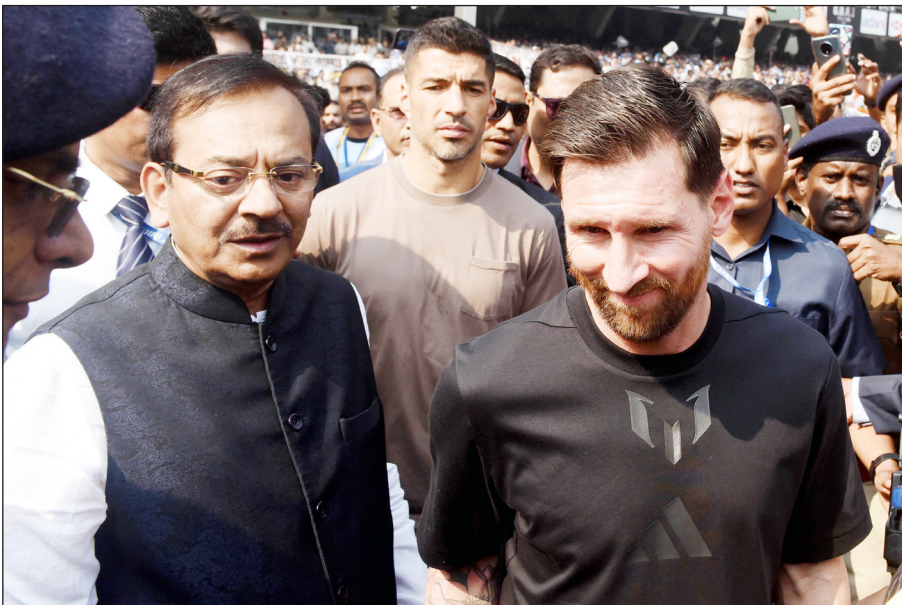
Football legend Lionel Messi with Bengal Sports Minister Aroop Biswas during the Kolkata leg of the GOAT Tour at Salt Lake Stadium in Kolkata on Saturday.

"We urge all attendees to extend their full cooperation with the relevant authorities and to maintain order. The safety and security of all individuals involved must remain the paramount priority," the post read.