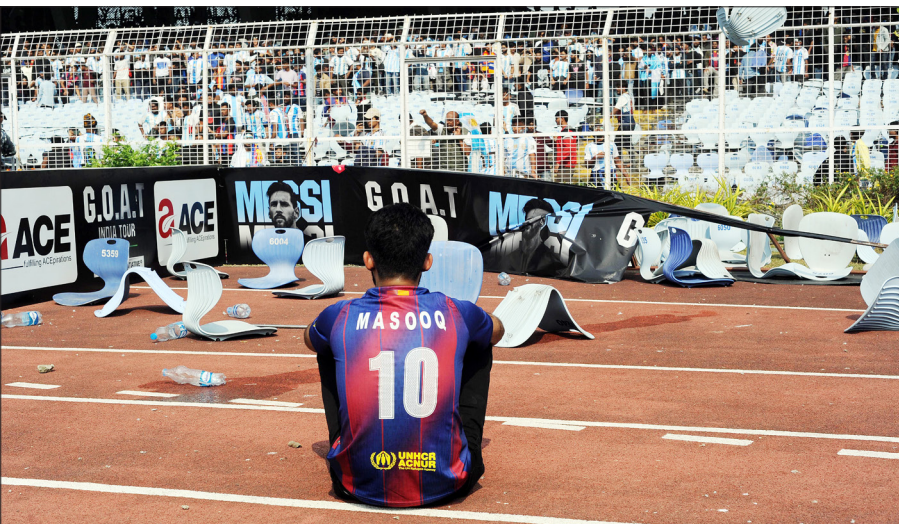
Angry fans vented their frustration at Salt Lake Stadium as chaos erupts during Lionel Messi's Kolkata leg of the GOAT Tour with spectators throwing bottles, attempting to break gates between stands, and vandalising property after the Argentine superstar left the venue early on Saturday.

Messi's Kolkata leg of the GOAT Tour descended into chaos on Saturday as fans who paid high ticket prices at Salt Lake Stadium's event began throwing bottles and attempting to break the gates between the stands after the Argentine legend left early. Angry fans resorted to vandalism at the Kolkata stadium, alleging poor event management and criticising VIPs and politicians for 'hogging' the football icon's attention and