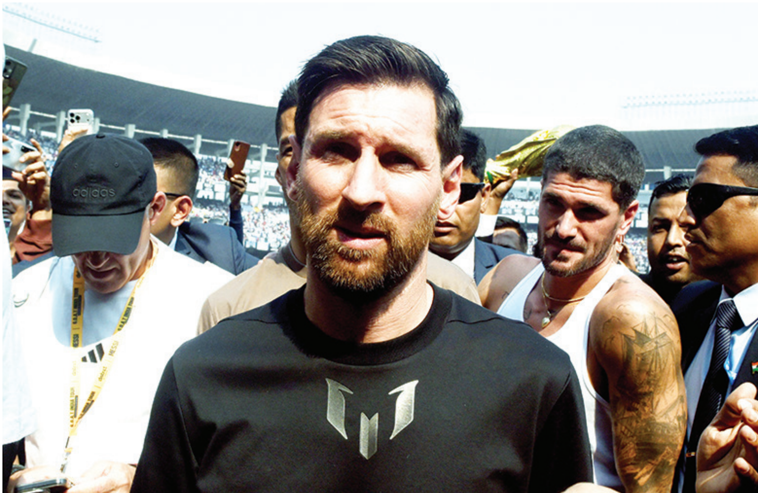
Argentine superstar footballer Lionel Messi during the Kolkata leg of the GOAT Tour at Salt Lake Stadium in Kolkata on Saturday.