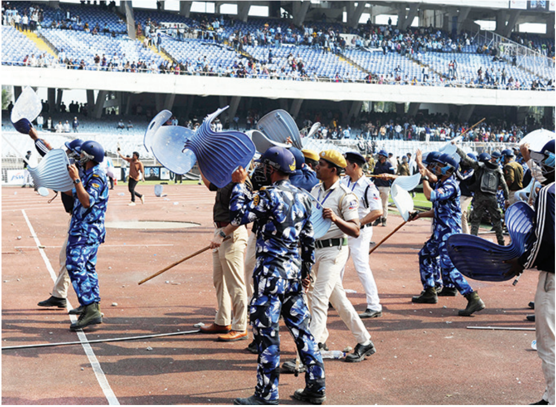
(L) Angry spectators erupted in protest at Salt Lake Stadium during Lionel Messi's Kolkata leg of the GOAT Tour, hurling bottles, forcing gates between stands, and damaging property alleging lack of mismanagement, after the Argentine superstar exited the venue prematurely on Saturday.(R) Police personnel use plastic chairs thrown by spectators as makeshift shields to protect themselves amid unrest by enraged fans at Salt Lake Stadium in Kolkata on Saturday.