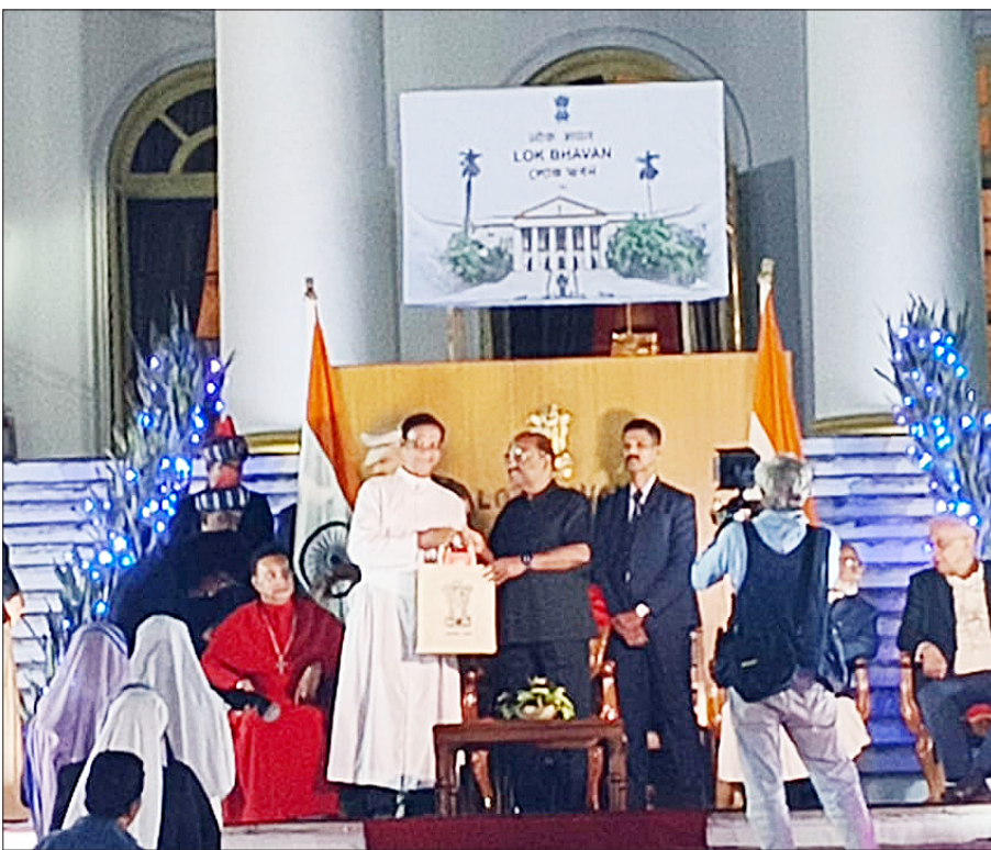
West Bengal Governor Dr C. V. Ananda Bose attends the pre-Christmas celebrations at Lok Bhavan, where various cultural programmes were organised on Saturday.