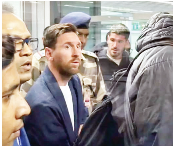
Messi Mania grips Kolkata as thousands welcome Argentine icon

MI News Service, Kolkata : Thousands braved the December chill and waited past midnight to give a rousing welcome to Argentine superstar footballer Lionel Messi as he arrived in Kolkata for his whirlwind three-day, four-city GOAT India Tour 2025. The Barcelona legend's 2.26 am touchdown in the early hours of Saturday sent the city into a frenzy. Gate 4 of the international arrivals turned into a roaring sea of chants, flags and flashing phones, with fans sprinting between gates for even a fleeting glimpse of their