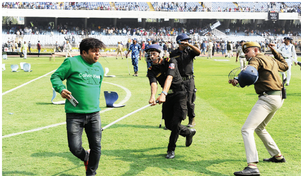
Police personnel used mild force to disperse the angry crowd after they tried to vandalise the Salt Lake Stadium, alleging poor management of the Argentine Legend Lionel Messi's GOAT Tour event in Kolkata, on Saturday.

MI News Service, Kolkata : Argentine football superstar Lionel Messi's brief visit to Kolkata descended into chaos as angry fans broke security protocols after failing to catch even a glimpse of the world's most popular footballer during his blink-and-miss 22-minute appearance at the Salt Lake Stadium on Saturday morning. What was meant to be a red-letter day for thousands of football fans in the City of Joy turned into a virtual nightmare, with "less of Messi" and more of what many described as a "royal mess", as massive disorder