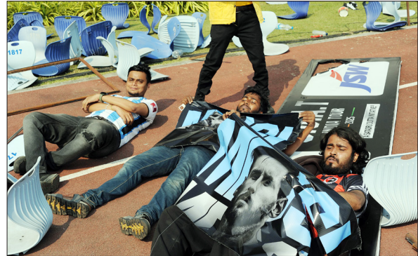
The angry mob entered the ground and attempted to vandalise the tent and the goalpost after Argentine footballer Lionel Messi left early following his brief appearance during the Kolkata leg of the GOAT Tour at Salt Lake Stadium in Kolkata on Saturday.

A fan of Messi said, "It is very disappointing that after paying such a hefty amount. They had 50 people around him, and we could not even get a glimpse of him for once... He just waved a