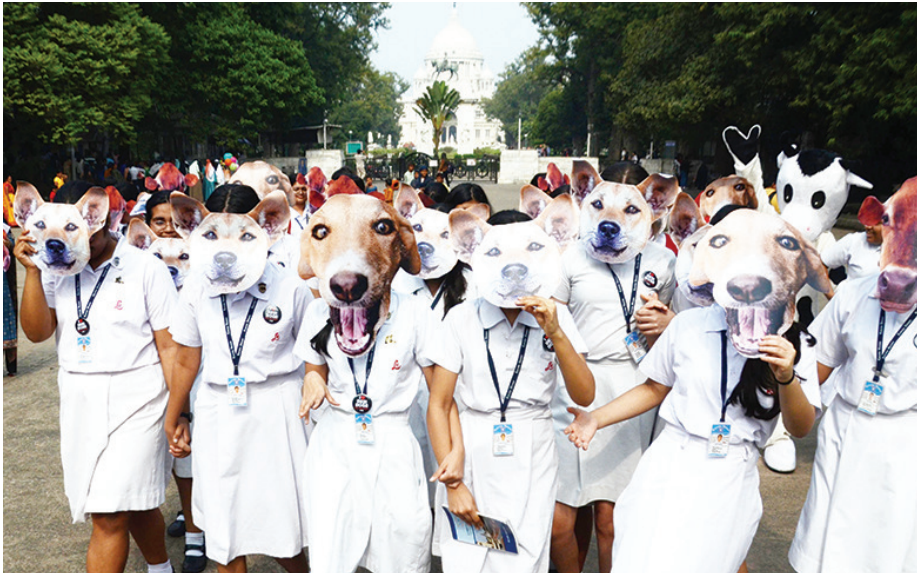
Schoolchildren wearing dog and cow masks lead PETA India's protest against the Supreme Court's community animal roundup order on the National Day of Action, in Kolkata on Tuesday.

by suicide, some due to stress-related illnesses during SIR duties. We offer our heartfelt condolences," she said. According to figures she cited, at least 39 people have died so far and 13 remain hospitalised in serious condition, including several BLOs. To support these affected families, Banerjee announced an immediate financial relief package: Families of deceased workers (BLOs or SIR-listed) will receive ₹2 lakh each. And Workers who have been hospitalised or suffered severe injury—whether from stroke or suicide attempts—will be provided ₹1 lakh each. She added that two families had already received financial aid and instructed officials to ensure speedy delivery of assistance by removing bureaucratic hurdles. "Let these families at least feel that the government is with them in their darkest hour. Whether it's an accident or a disaster, we stand beside our people. It is our social responsibility," she said.