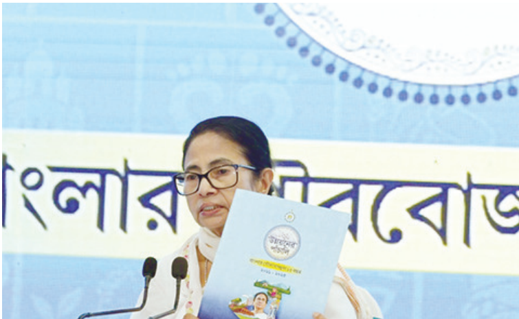
West Bengal Chief Minister Mamata Banerjee reassured the people of West Bengal that she will not allow any detention centre in the state, as she released Unnayaner Panchali (Ballad of Development) at Nabanna, highlighting major developmental strides across various sectors.

MI News Service, Kolkata:Amid heightened anxiety across West Bengal over citizenship verification and documentation procedures linked to the ongoing SIR, Chief Minister Mamata Banerjee sought to reassure citizens. The Chief Minister declared firmly, "We will not allow any detention centre in Bengal." Banerjee said that relentless fear-mongering around citizenship status had pushed many residents into extreme psychological distress, with some even driven to take their own lives. Condemning what she called a deliberate attempt to create panic, she said, "Everyone in Bengal should remember—your safety is guaranteed. We do not allow any detention camps, nor will we permit any kind of harassment or unrest. In this state, every human being—regardless of religion or community—has a secure place. We do not practise politics of division." The Chief Minister also expressed deep grief over the deaths and medical emergencies in-