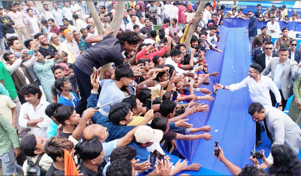
TMC National General Secretary Abhishek Banerjee during the inauguration of Sebaashray camp at Maheshtala.

tone even before the House convened. In his customary address, he said, "Those who want to do drama may do so, but this is not a place for theatrics. This is a place for work. Here, the focus should be on policy, not slogans."