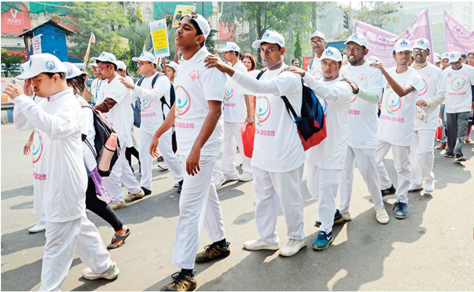
Persons with disabilities took part in a rally ahead of the International Day of Persons with Disabilities, in Kolkata on Tuesday.

From PG 1 Pakistan Navy to remain close to their ports or near the Makran coast," he said. The Navy chief said Operation Sindoor has put financial strain on Pakistan as significant number of merchant ships avoided travelling to that country following the hostilities. The cost of insurance for the vessels to travel to Pakistan had also gone up substantially, he said.