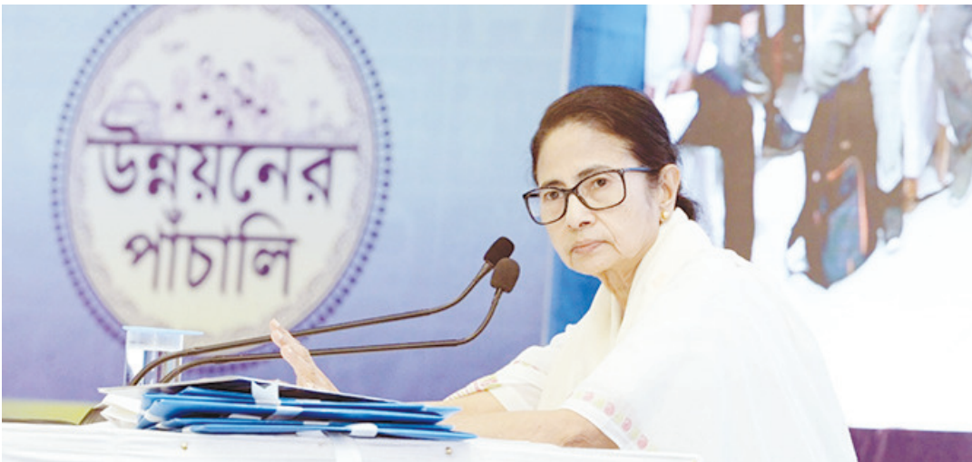
Chief minister Mamata Banerjee is releasing 'Unnayaner Panchali' (Ballad of Development) at Nanbanna on Tuesday, highlighting massive development strides in agriculture, employment, and health sectors under her leadership during 15 years of TMC government in West Bengal

Releasing 'Unnayaner Panchali' (Ballad of Development) Mamata Banerjee highlighted massive development strides in agriculture, employment, and health sectors under her leadership. The state government alleges that the Central Government has stopped funding many of the state's welfare and development schemes, forcing the state to finance these projects on its own every year.