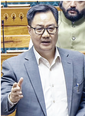
Union Minister Kiren Rijiju speaks in Lok Sabha during the winter session of Parliament, in New Delhi on Tuesday.

Rijiju's remarks came after Opposition INDIA bloc MPs in the House refused to withdraw their demand for a debate on the Special Intensive Revision (SIR) of the voters' list in nine states and three Union Territories. The minister said there are several important issues, and the proceedings cannot be disrupted over one issue. The government is ready to discuss anything but the Opposition should not fix timelines, Rijiju told the members. After Leader of Opposition Mallikarjun Kharge demanded that a discussion on the crucial issue of SIR should begin in the House immediately, Rijiju said he will hold consultations with leaders of various parties later today