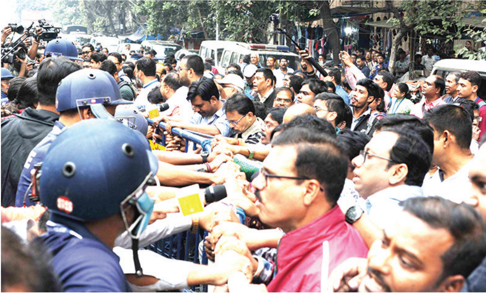
Members of the BLO Adhikar Raksha Committee erupted in protest, alleging excessive workload during the ongoing Special Intensive Revision exercise, as a BJP delegation led by Opposition Leader Suvendu Adhikari visited West Bengal's Chief Electoral Officer in Kolkata on Monday.

From PG 1 employ someone for a fraction of the cost of an American citizen, then I guess these other companies would hire people just to save costs". However, at his companies, the tech billionaire said, they are just trying to get the most talented people in the world. "We pay way above average, so... that's not my experience, but that's what a lot of people do complain about," he said. Asked what message he had for young Indian entrepreneurs, Musk said he respected "anyone who wants to build". "Aim to make more than you take, be a net contributor to society... If you want to create something valuable... pursue providing useful products and services... then money will come as a natural consequence," he said. "Are you a value creator? That's what really matters," Musk said.