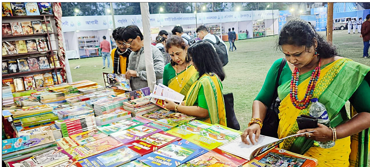
The North 24 Parganas District Book Fair was inaugurated on Monday, inspired by Chief Minister Mamata Banerjee. Organized by the Department of Public Education Extension and Library Services, the event has been jointly managed by North 24 Parganas and Naihati Municipalities. The fair is being held at the Naihati Railway Ground and will continue until December 7, from 2 pm to 9 pm each day. West Bengal Food Minister Rathin Ghosh and other dignitaries visited the fair.