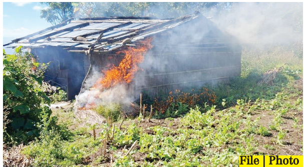
Security forces destroyed nearly 18 acres of illegal poppy cultivation in Manipur's Churachandpur and Tengenoupal districts. File | Photo