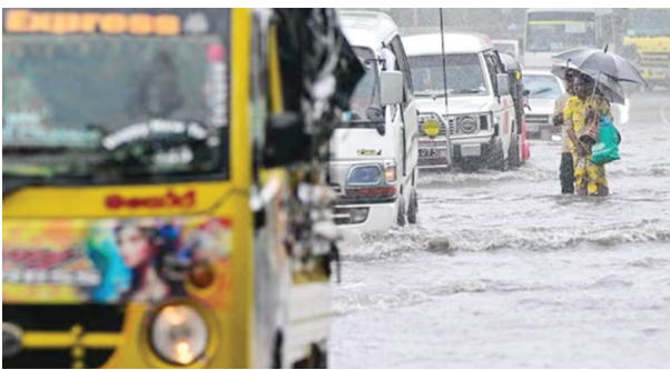
Sri Lankan authorities deployed the military for relief and rescue operations on November 28, as the death toll from floods and landslides rose to 56, with another 21 people listed as missing.

MI News Service, Colombo : Incessant heavy rain, coupled with a number of landslide during the past two days, have claimed as many as 56 lives so far with and 21 more people still remaining missing in Sri Lanka. As a result the government has announced a public holiday on Friday other than for those involved in essential services. All the 56 deaths have been recorded during the past 48 hours as adverse weather conditions continue to affect the island nation, the Disaster Management Centre (DMC) said. Weather in Sri Lanka turned severe last week that led to heavy downpours since Thursday, flooding homes, farm lands, roads, and triggering landslides. More than 600 houses have been damaged so far, according to the officials. In view of this severe natural disaster, the government has ordered closure of all government offices and schools for the time being as the death toll from floods and