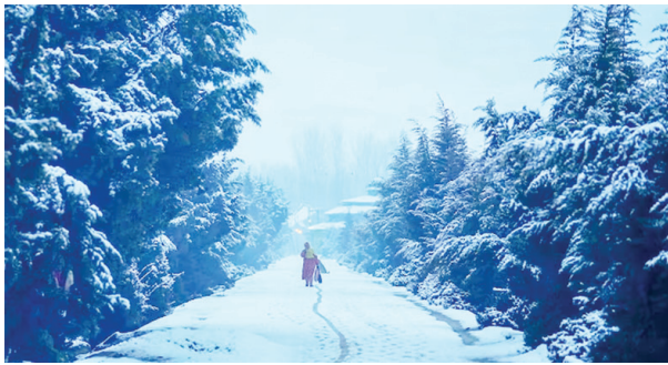
A Kashmiri woman walks on a snow-covered road early in the morning after a fresh snowfall in the outskirts of Srinagar

There is a very high chance of more snowfall here.. it is very cold right now. People should take all measures to protect themselves