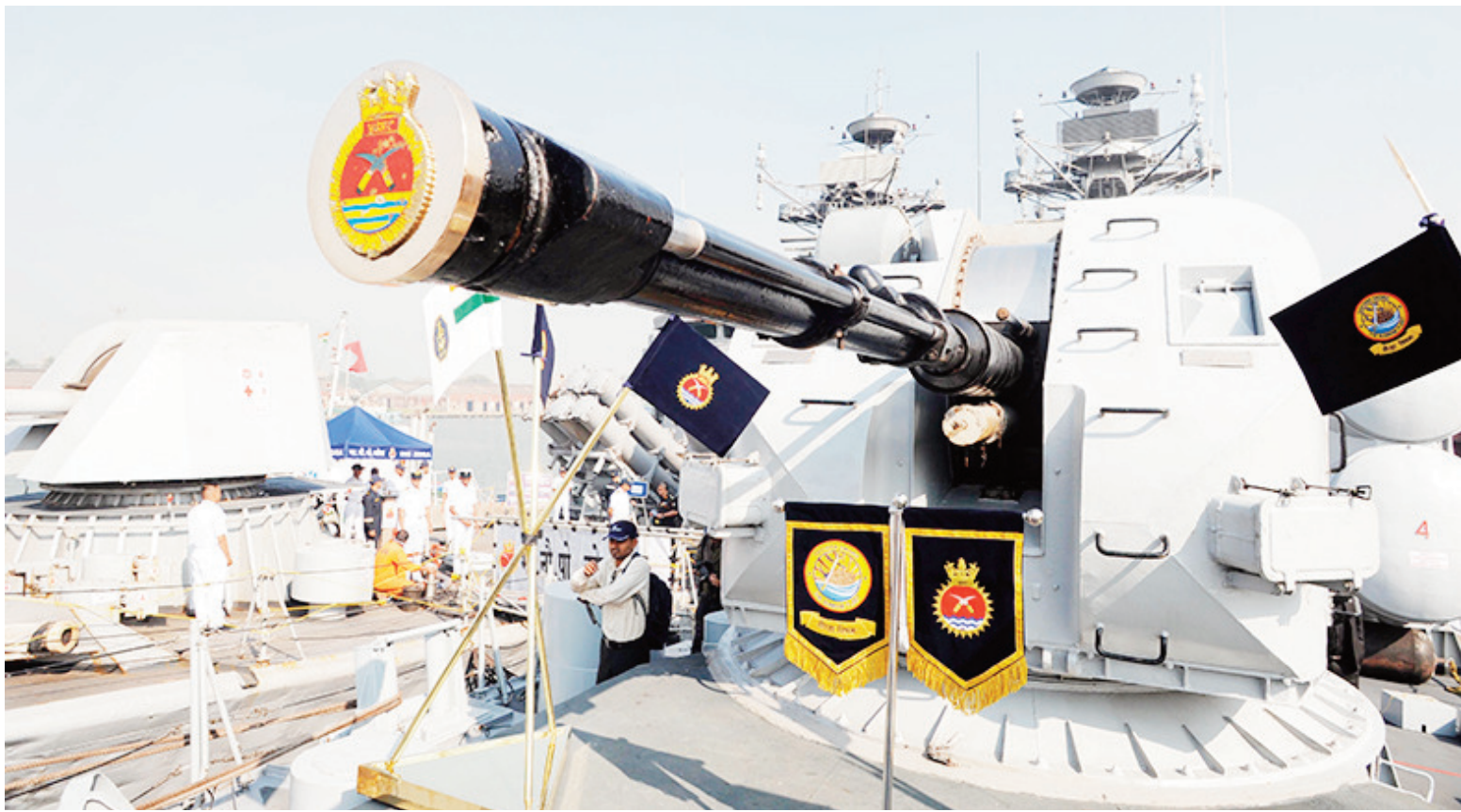
Two frontline guided-missile corvettes of the Eastern Fleet, INS Khanjar and INS Kora, docked at Kidderpore as part of the Navy Week 2025 celebrations organised by the Indian Navy, aimed to engage with citizens, in Kolkata on Friday.