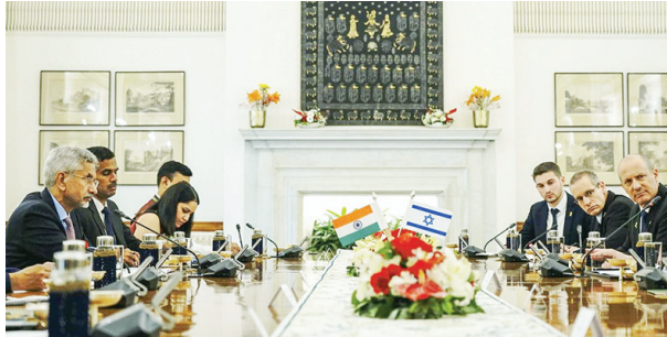
External Affairs Minister S. Jaishankar with Israel's Foreign Affairs Minister Gideon Sa'ar and others during a meeting, in New Delhi.

MI News Service, New Delhi : India and Israel should work together to build a global approach of "zero tolerance" in combating terrorism, External Affairs Minister S Jaishankar said on Tuesday. He made the remarks at a meeting with his visiting Israeli counterpart Gideon Sa'ar here in the National capital this afternoon. "Our two nations face a particular challenge from terrorism," Jaishankar said. During his maiden three day visit to India since yesterday, Israeli Foreign Minister Sa'ar described his meeting with EAM Jaishankar as very fruitful. Incidentally, the Israeli minister's India visit comes ahead of a possible trip by Prime Minister Benjamin Netanyahu in December. Sa'ar's visit also coincides with the implementation of the US-brokered Gaza ceasefire that has facilitated the release of all 48 Israeli hostages, both alive and dead, by Hamas and hundreds of Palestinian prisoners. Delhi is seeking to advance connectivity initiatives linking India, the Middle East, and Europe, which would pass through Israel, following the restoration of