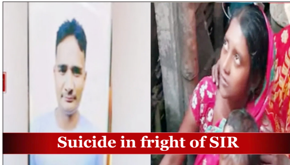
Suicide in fright of SIR