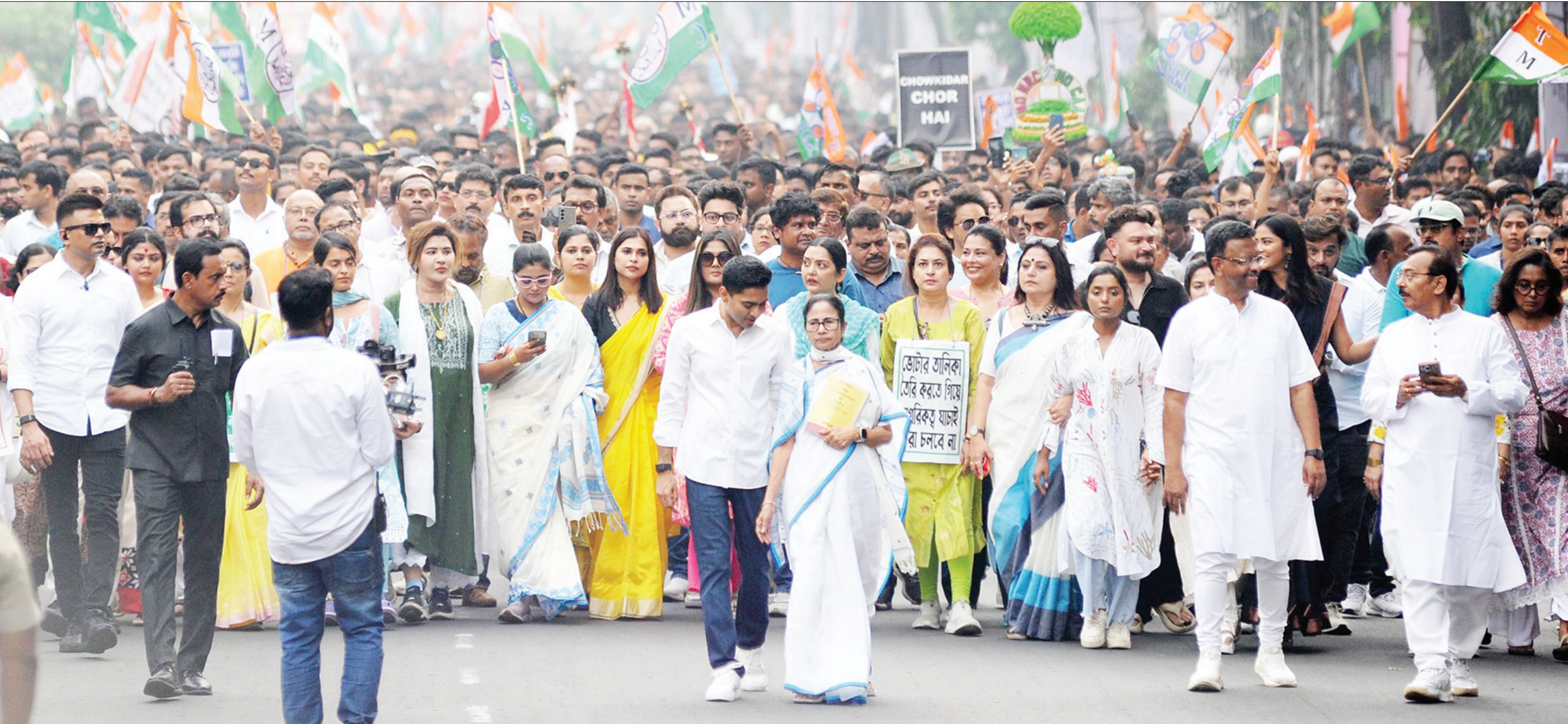
TMC supremo Mamata Banerjee, All India Trinamool Congress General Secretary Abhishek Banerjee, along with other TMC leaders and activists, took part in a protest rally against the SIR in Kolkata on Tuesday.