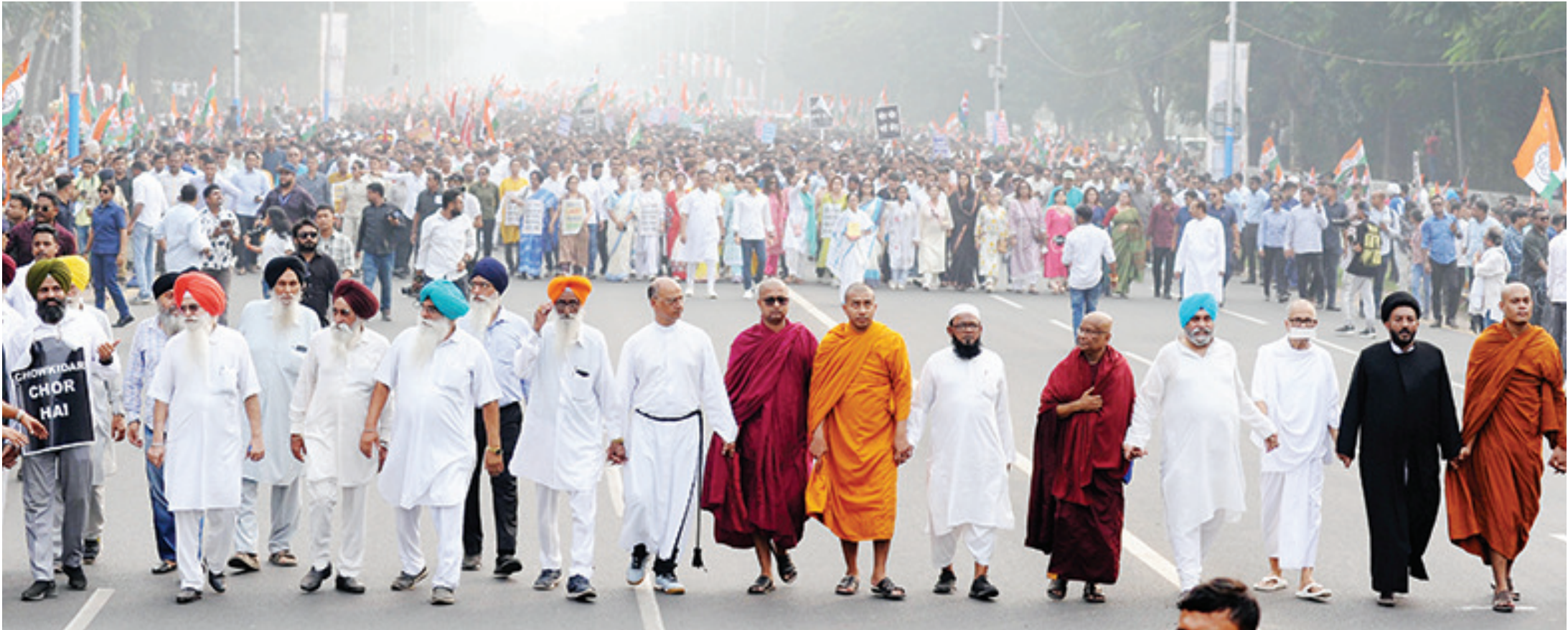
Various spiritual leaders of the society joined hands and participated in a massive protest rally against the ongoing Special Intensive Revision (SIR) of electoral rolls, led by TMC Supremo Mamata Banerjee and joined by TMC National General Secretary Abhishek Banerjee in Kolkata on Tuesday

From PG 1 20-point peace plan and said it was a step towards reaching long-term peace and security for not just Israelis and Palestinians but the whole of Middle East region at large. "We welcome President Donald Trump's announcement of a comprehensive plan to end the Gaza conflict. It provides a viable pathway to long-term and sustainable peace, security and development for the Palestinian and Israeli people, as also for the larger West Asian region," said Modi in a post on X.