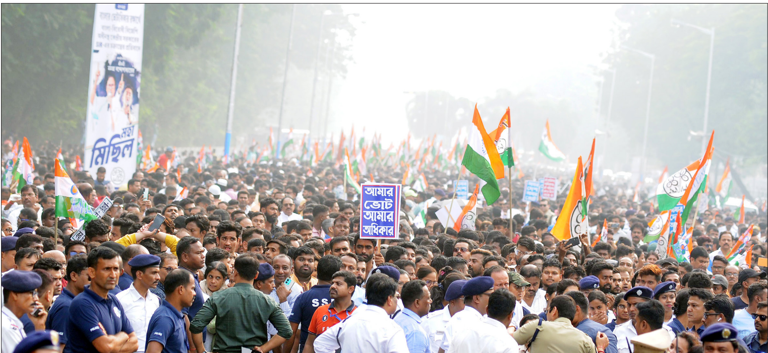
Mamata Banerjee alongwith Abhishek Banerjee led a massive protest rally in Kolkata on Tuesday in protest of Special Intensive Revision (SIR)

MI News Service, Malda: The Darjeeling Welfare Society has extended the registration deadline for Rozgar Mela 2.0 to November 7, 2025, aimed at youth from North Bengal and the hills. The event will occur on November 15 and 16 at Salesian College, Siliguri, featuring over 60 companies and more than 10,000 job openings in various sectors. Participation is free, and candidates can register on the society's website. MP Shri Harsh Vardhan Shringla encouraged eligible youth to take advantage of this opportunity.