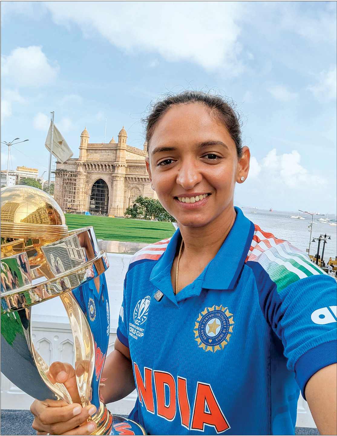
India Women’s captain Harmanpreet Kaur poses with the ICC Women’s Cricket World Cup Trophy after leading the team to their maiden title.