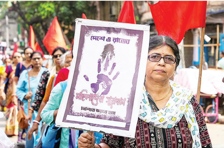
Nurses from various hospitals participate in a protest march over incidents of workplace violence, in Kolkata.