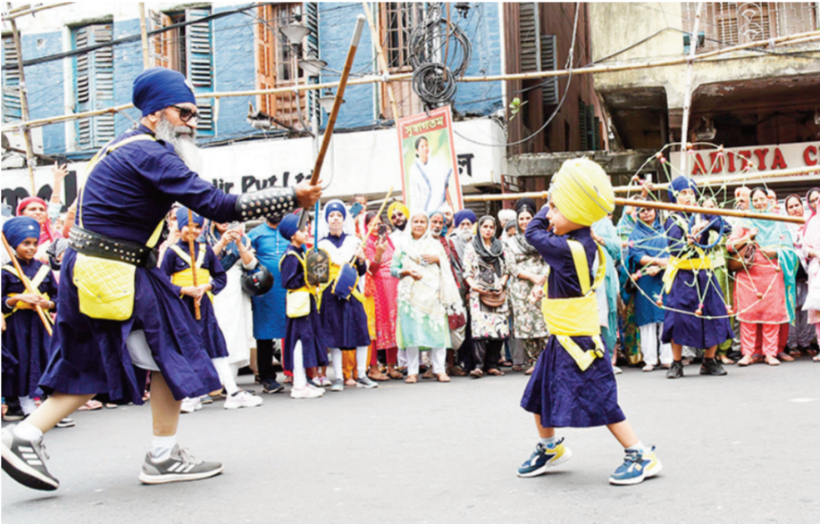
Sikh devotees participate in a rally (Nagar Kirtan) for the upcoming 556th Birth Anniversary of Guru Nanak in Kolkata on Sunday.