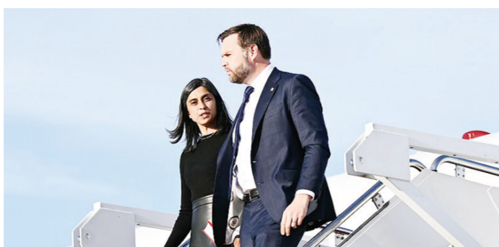
US Vice President JD Vance and Second Lady Usha Vance

With respect, @JDVance, if your wife encouraged you to re-engage with your faith, why not reciprocate that and engage with Hinduism too? --HAF