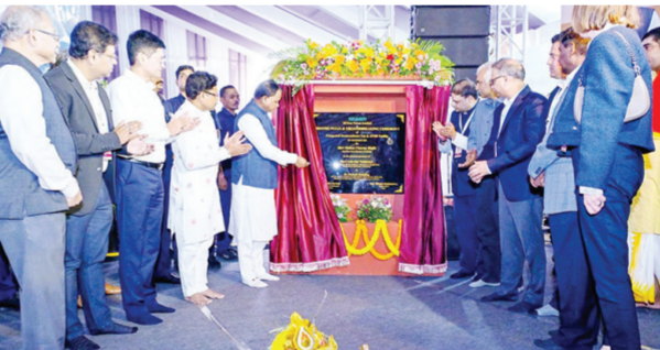
Odisha CM Mohan Charan Majhi, during the foundation stone laying ceremony of the state's first compound semiconductor manufacturing unit, in Bhubaneswar.

and foundation stone laying of the Compound Semiconductor Fab and ATPM (Assembly, Testing, Marking and Packaging) Facility — a project by SiCSem Pvt. Ltd., approved under the India Semiconductor Mission — at Info Valley, Bhubaneswar, marks a defining moment in Odisha's semiconductor journey. With a capital investment of ₹2,067 crore, this unit will create 5,000 direct and indirect jobs, and achieve an annual output of