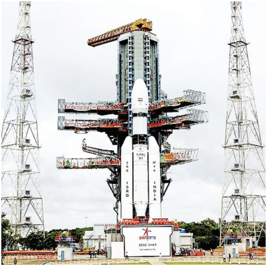
Indian Navy's GSAT-7R (CMS-03) communication satellite ahead of its launch by Indian Space Research Organisation (ISRO).