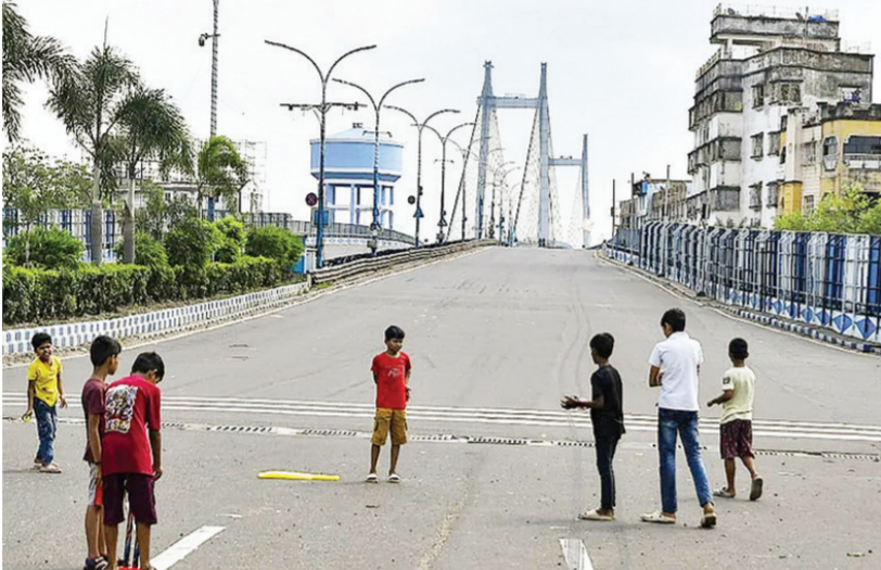
Children play on a nearly deserted road leading to the Vidyasagar Setu, also known as the second Hooghly bridge, on which vehicular movement has been restricted citing repair and rehabilitation in Kolkata on Sunday.

MI News Service, Kolkata: The Second Hooghly Bridge will be closed for essential maintenance work this Sunday, disrupting a critical arterial route into Kolkata. According to Howrah City Police, the bridge will remain shut from 6 a.m. until 2 p.m., a total closure lasting eight hours, to facilitate urgent repairs