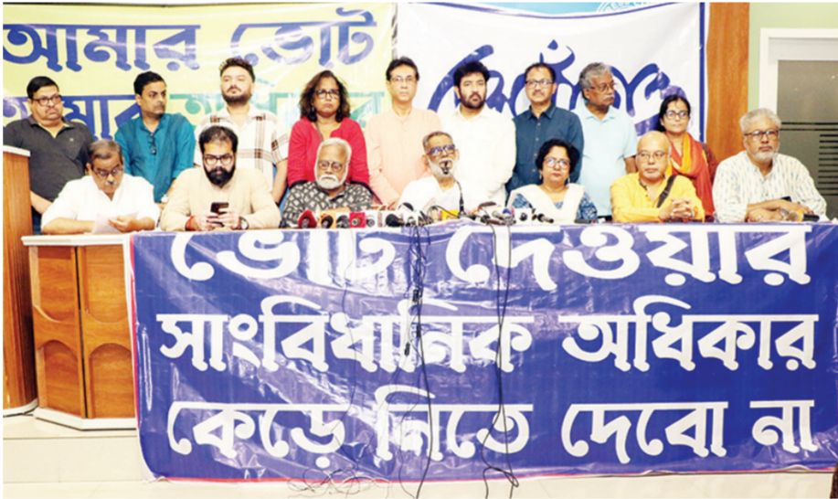
Press conference of Desh Bachao Ganamanch at Kolkata Press Club, protesting against the conspiracy to make Bengalis stateless, the intimidation of a community in the name of SIR on Sunday in Kolkata.