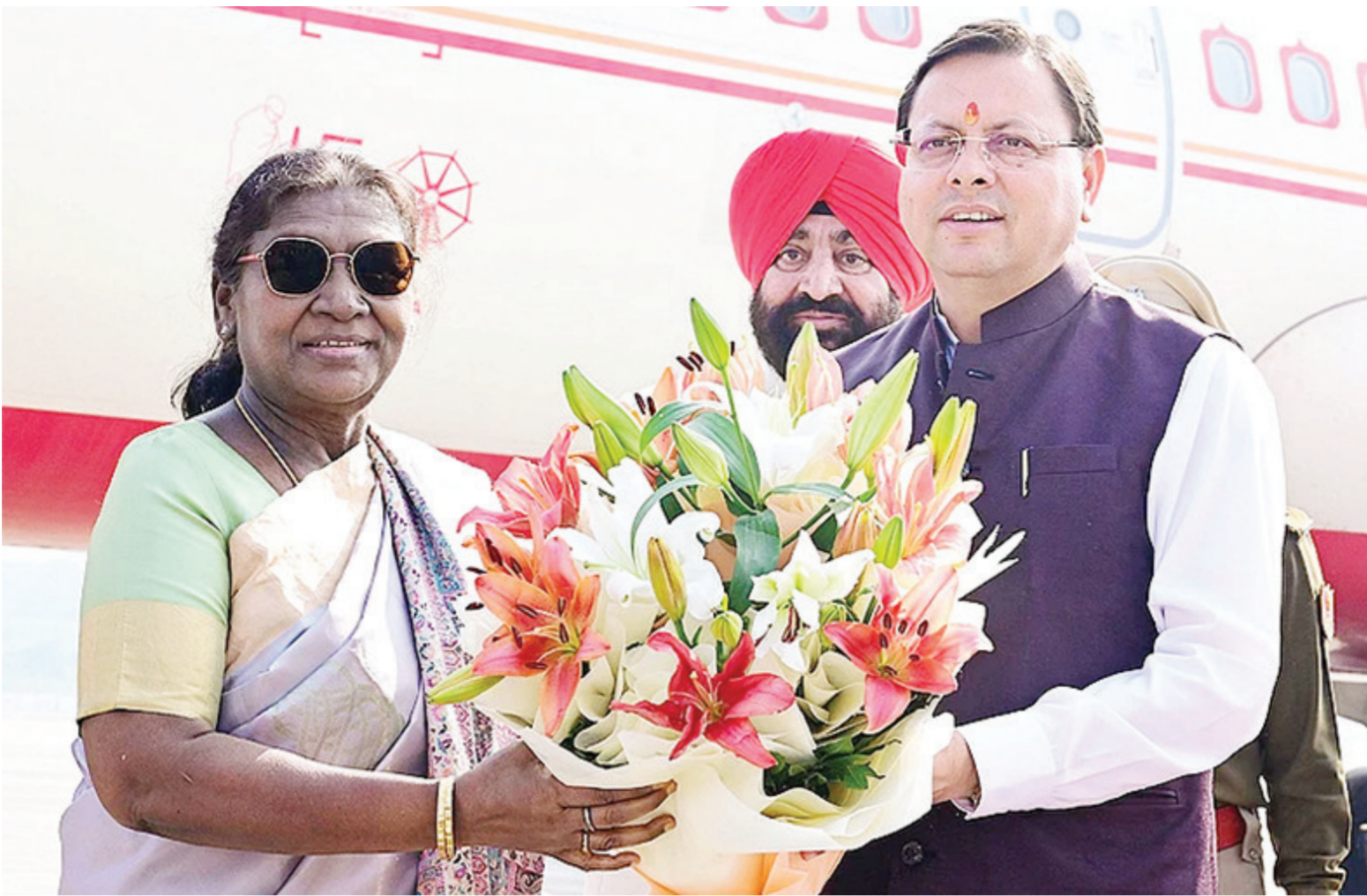
President Droupadi Murmu being received by Uttarakhand Chief Minister Pushkar Singh Dhami on her arrival in Dehradun. State Governor Lt. Gen. Gurmit Singh (Retd.) was also present.

He added: "The government must make a public statement on how it plans to recover fines imposed on leaseholders." On Wednesday, the Supreme Court rebuked the Odisha government for its slow pace in recovering dues from defaulting mining leaseholders accused of illegal extraction of iron and manganese ore in Keonjhar, Mandargarh and Mayurbhanj districts without environment clearance.