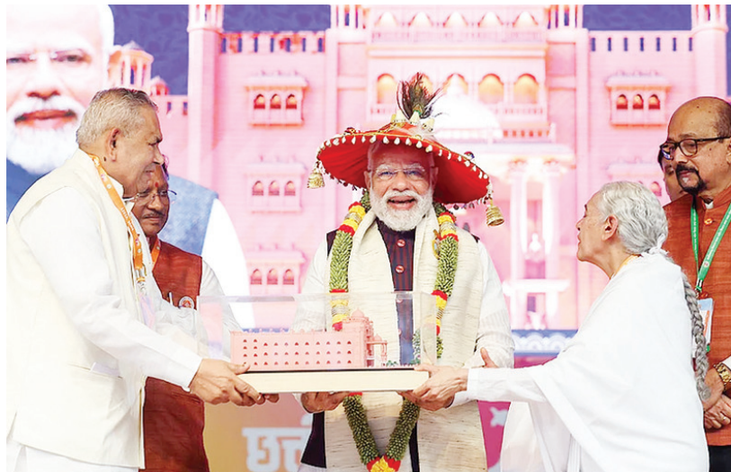
PM at inauguration of the 'Shanti Shikhar' of Brahma Kumaris at Nava Raipur, in Chhattisgarh on Saturday.

Guided by the mantra that the development of the state leads to the development of the nation, the government is engaged in the Viksit Bharat mission to make India developed, PM Modi said adding "In this crucial journey towards a developed India, institutions like Brahma Ku-