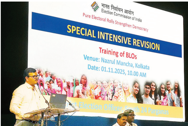
Election Commission officials during a training session for Booth Level Officers (BLOs) for the upcoming Special Intensive Revision (SIR) of electoral rolls in West Bengal, in Kolkata on Saturday.

"BLOs will be trained to operate the application, identify acceptable documents and explain procedures to voters," a senior ECI official said. The commission also