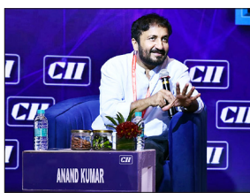
Anand Kumar, Founder of Super 30