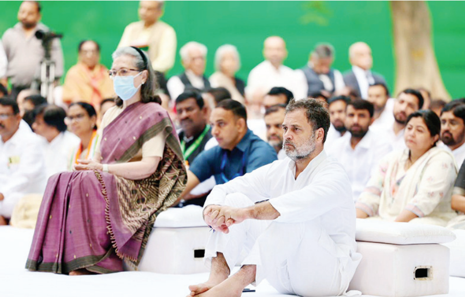
Lok Sabha LoP Rahul Gandhi and Congress Parliamentary Party Chairperson Sonia Gandhi, during the 41st death anniversary of the former Prime Minister Indira Gandhi at Indira Gandhi Memorial, in New Delhi on Friday.

MI News Service, New Delhi : Describing her a fearless and unwavering individual while facing the powerful, the Congress on Friday paid rich tributes to former Prime minister Indira Gandhi on her death anniversary, with party leader Rahul Gandhi saying she “taught us that nothing is more important than India’s self-respect”.