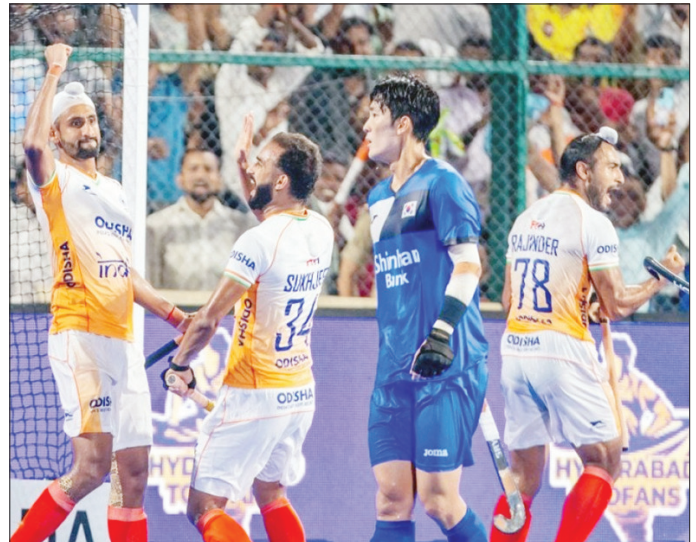
Major Dhyan Chand National Stadium in New Delhi, where the morning will open with an evocative exhibition match featuring the Honourable Sports Minister's XI vs Hockey India's Mixed XI, uniting men and women on one field - symbolising the inclusive future of the sport. Hockey legends across generations will be honoured, the commemorative book "100 Years of Indian Hockey" will be unveiled, and a stirring photo

NEW DELHI : A century ago, on November 7, 1925, Indian hockey became affiliated with the FIH - and what followed was not merely the rise of a sport, but the birth of national pride. Within three years came Amsterdam 1928, and with it a historic Olympic gold that announced India as a hockey superpower. Over the decades that followed, the tricolour dominated the world stage, earning eight Olympic golds - the most by any nation in hockey history - along with one silver and four bronze medals. It has been a journey of brilliance, testing phases, and stirring comebacks. The golden era from 1928-1959 shaped India's sporting identity; the 1980s and 90s challenged its legacy; and then came the resurgence - highlighted by the iconic Tokyo 2020 bronze and reaffirmed at Paris 2024 with another podium finish. Alongside the 1975 World Cup triumph and a rich haul of Asian Games medals for both men and women, hockey remains deeply woven into the nation's sporting soul. On November 7, 2025, India will pause to celebrate this remarkable century. The heart of the celebration will beat at the