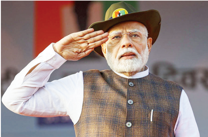
PM Narendra Modi takes salute of the Ekta Diwas Parade at the Statue of Unity on the occasion of Sardar Vallabhbhai Patel's birth anniversary, in Kevadia, Friday

MI News Service, Ahmedabad : Prime Minister Narendra Modi on Friday said Sardar Patel wanted to unite the entire Kashmir, just as he did with other princely states, into India, but the then PM Jawharlal Nehru did not allow it to happen. “Sardar Patel believed that one should not waste time writing history but we should work hard to create history,” PM Modi said, addressing the gathering after the Rashtriya Ekta Diwas parade near the Statue of Unity in Gujarat’s Ekta Nagar. “Sardar Patel wanted to unite the entire Kashmir, just as he did with other princely states. But Nehru ji stopped his wish from being fulfilled. Kashmir was divided, given a separate Constitution and a separate flag - and the nation suffered for decades because of Congress’ mistake,” PM Modi said. The policies that Sardar Patel formulated, the decisions he took, created new history, the Prime minister said. “After Independence, the impossible task of uniting more than 550 Princely states was made possible by Sardar Patel. The idea of One India, Excellent India, was paramount for him,” PM Modi said. “Sardar Patel once remarked that his