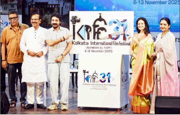
West Bengal MLA Indranil Sen, State Cabinet Minister Arup Biswas, actor Prosenjit Chatterjee, actress Koel Mallick and TMC MP June Malia during the inauguration of the logo of the 31st Kolkata International Film Festival at a media conference, in Kolkata on Tuesday.

The ED has already filed a chargesheet against Ayan Sil before a special PMLA court in Kolkata.