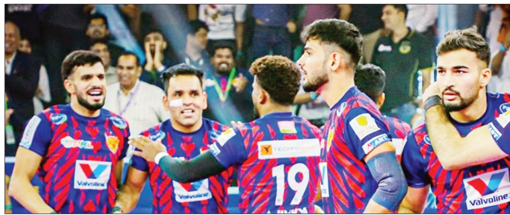
the franchise's long-term approach for the benchmark they have set with a well-rounded squad over the last few seasons. "This is a team game, so we have to play together and win together. We train together