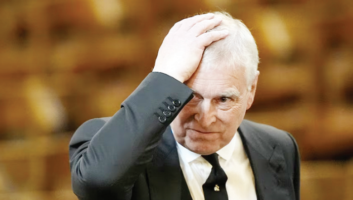
The King’s brother will no longer be known as a prince but as Andrew Mountbatten Windsor.