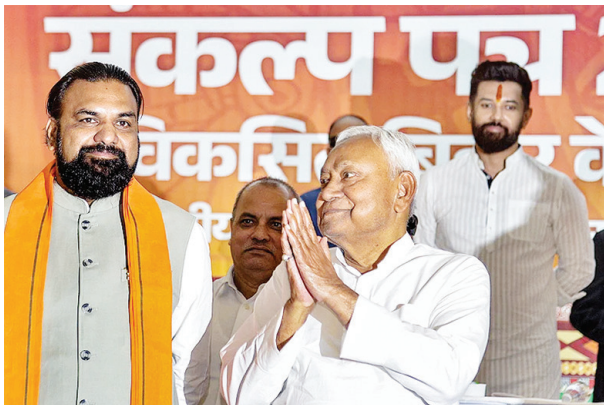
Bihar Chief Minister Nitish Kumar with Deputy CM Samrat Choudhary and JDU National Working President Sanjay Jha during release of the National Democratic Alliance’s (NDA) manifesto for the upcoming state Assembly elections, in Patna.

breed dogs from the BSF, including the celebrated Mudhol hound Riya which recently won the All-India Police Dog Competition. Rampur hounds and Mudhol hounds demonstrated their skills at the event, which included a spectacular air show by the Surya Kiran team of the Indian Air Force. The Surya Kiran Aerobatic Team was formed in 1996 and is among the very few nine-aircraft aerobatics teams in the world, and the only one of its kind in Asia. The parade also featured a motorcycle daredevil show by Assam Police, and a camel mounted contingent and band by the BSF. Ten tableaux from various states and union territories, including the NSG and NDRF, reinforce the theme of unity in diversity