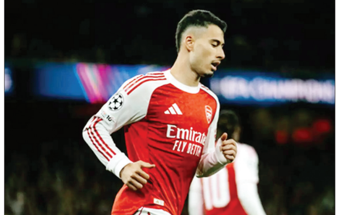
Odegaard, and Gabriel Jesus, and when they might return to action. Arteta was optimistic that he may have some fresh faces to select from in the near future. "I would say weeks and some of them pretty soon, hopefully if they keep evolving the way they are doing," he added. "It's difficult to put a game, you know that we have the international break, which is a two-week break there, and after that I think we'll have

LONDON : Arsenal manager Mikel Arteta confirmed on Friday that Gabriel Martinelli will miss Saturday's Premier League trip to Burnley due to injury, while William Saliba remains a doubt. The update comes as the Gunners aim to continue their impressive run of form. Martinelli, the Brazil international, was forced off during Arsenal's 1-0 win over Crystal Palace on Sunday, while Saliba was substituted at halftime at the Emirates after picking up a knock. "Martinelli is still out, Saliba. We have to wait and see. We have another training session this afternoon, and the rest are still getting closer, I think in the right direction, but not available yet," Arteta told reporters on Friday. After Martinelli missed Wednesday's 2-0 win over Brighton, Arteta was asked about a timeline for his potential return. "We don't know yet, but I think this game is going to come too early for him," he added. The Gunners boss also discussed long-term absentees Kai Havertz, Noni Madueke, Martin