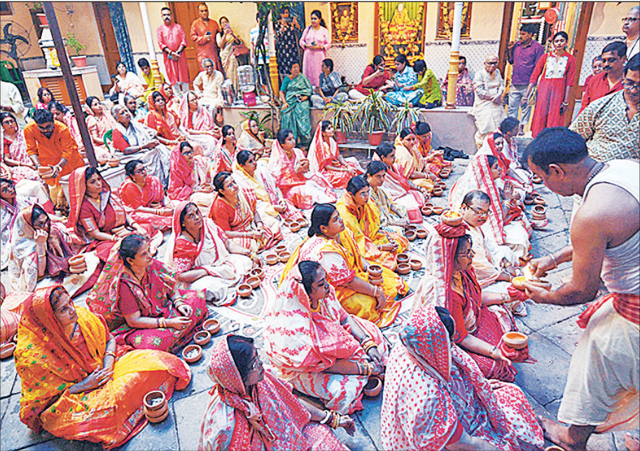
People perform rituals during the 179 years of Jagadhatri Puja celebration at BeniaTola Dawn Bari, in Kolkata

MI News Service, Durgapur: The epic battle of Kurukshetra, the intrigue over the Kuru throne, and Draupadi’s disrobing — this year, the timeless saga of the Mahabharata has been brought to life at the Jagadhatri Puja pavilion of Durgapur’s Arvind Sporting Association Club. The spectacular theme has become the talk of the town, drawing large crowds eager to witness the mythological grandeur recreated in dazzling artistry and light. Celebrating its 30th year, the Arvind Sporting Association’s Jagadhatri Puja has evolved into one of Durgapur’s most prominent and high-budget celebrations. What began decades ago as one among a handful of local pujas has today transformed into a major cultural attraction in the city’s Shivaji area of the Steel Township — rivaling the famed festivities of Krishnanagar and Chandannagar. This year’s theme, “Mahabharata,” encapsulates the entire epic journey — from the royal court and the Rajasuya Yajna of the Pandavas to the exile in the forest, the Bhishma and Drona Parvas, and ultimately, the Mahaprasthanika Parva depicting the Pandavas’ final ascent. Crafted meticulously by artists from Nabadwip, the elaborate sets and life-sized characters made from bamboo, fabric, and traditional materials lend an extraordinary realism to the mythic scenes.