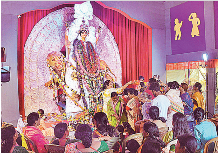
Jagadhatri Puja at Salt Lake in Kolkata...