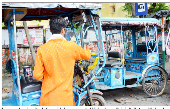
A man performing rituals for a rickshaw as a part of Vishwakarma Puja in Kolkata on Wednesday