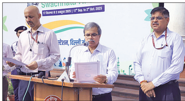
Under the Swachhata Hi Seva campaign, Chairman and CEO, Railway Board administered the Swachhata Pledge to Railway employees in New Delhi.

09437 Gandhidham – Sealdah Puja Special will leave Gandhidham at 18:25 hrs. on every Wednesday between 17.09.2025 & 08.10.2025 (04 trips) to reach Sealdah at 16:30 hrs. on the 3rd day and 09438 Sealdah – Gandhidham Puja special will leave Sealdah at 05:15 hrs. on every Saturday between 20.09.2025 & 11.10.2025 (04 trips) to reach Gandhidham at 02:00 hrs. on the 3rd day. The train will stop at Bardhaman, Durgapur and Asansol stations over Eastern Railway jurisdiction enroute in both directions . The train will have Sleeper class and air-conditioned accommodations.Booking of 09438 Sealdah - Gandhidham Puja Special is available through PRS & Internet.