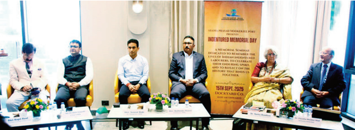
Syama Prasad Mookerjee Port, Kolkata, observed Indentured Memorial Day at the Indenture Memorial, Jetty No. 8, Kidderpore, on the banks of the Hooghly. A day-long seminar brought together dignitaries from India, Mauritius, Fiji, South Africa, the UK and USA to commemorate the resilience of indentured labourers who sailed from Kolkata between 1834 and 1920. The memorial, inaugurated in 2011, stands as a tribute to their courage and contributions across far-off lands while preserving Indian culture. Discussions highlighted Kolkata's role as the "Emigration Gateway," exploring diaspora identity, cultural legacies, socio-economic impact, and connecting descendants with their shared heritage.

Vaishali's historic triumph has been widely celebrated across India, underscoring the rise of Indian women in international chess and inspiring the next generation of players to pursue excellence on the global stage. With her qualification for the Candidates Tournament, Vaishali is set to further strengthen India's presence in elite women's chess competitions worldwide.