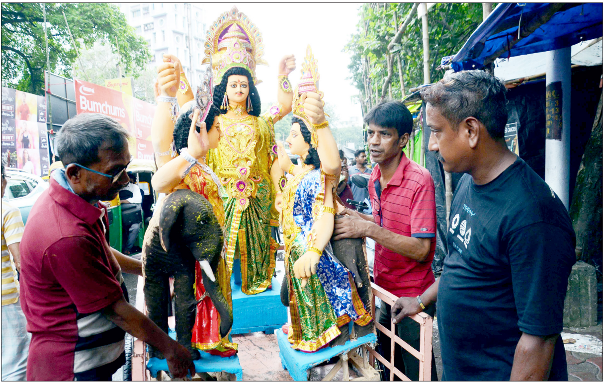
People are buying idols of Lord Vishwakarma in the market ahead of Vishwakarma Puja in Kolkata on Tuesday.

ural aerobic bacteria culture to transform human waste into nutrient-rich liquid fertilizer, eliminating pathogens and preventing wastewater contamination. The byproduct which is safe, organic and odourless can then be used for agriculture, landscaping and community gardens. Founded in Sweden, develops and markets patented eco-innovations providing sustainable sanitation solutions. Its waterless toilets are sewage-free, energy-free and maintenance-free, designed for schools, public places, construction sites and rural communities worldwide.