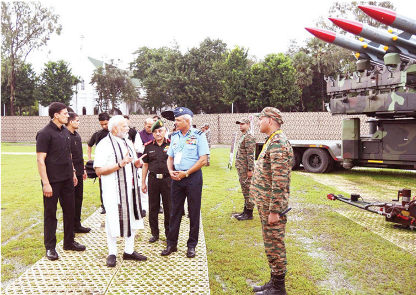
Prime Minister Narendra Modi is interacting with Army and Air Force personnel about the operational readiness of the Armed forces at the Eastern Command headquarters at Vijay Durg, formerly known as Fort Williams, in Kolkata on Monday.

The CCC, a biennial event, is the apex brainstorming forum of the armed forces, bringing together the nation's top civil and military leadership to exchange views and discuss strategic, institutional and operational priorities, with interactive sessions involving officers of various ranks. This