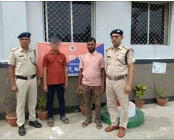
On 14.09.2025, under "Operation Nanhe Fariste", RPF officials of Howrah, Asansol & Malda Divisions of Eastern Railway have rescued 04 minor boys/girls from Dankuni, Madhapur & Tinpahar Railway Station and handed over to concern Child Line for further care and rehabilitation. Wherein, 01 rescued boy was going to work as a Mason offered by unknown person, 01 boy was found as per Rail Madad Complaint and 02 rescued girls were fled away from home due to family discord.