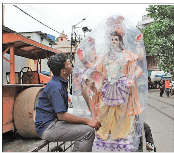
A man carries an idol of 'Lord Vishva Karma' fully protected from rain ahead of 'Vishva karma Puja' at Kumartoli in Kolkata on Monday.

MI News Service, Mursidabad: On the eve of his Higher Secondary examination, a teenager was caught in a shocking turn of events — allegedly making crude bombs inside a secret hide-out in Murshidabad's Rani-nagar area. The illegal activity ended in disaster when one of the bombs exploded, leaving three youths injured and triggering panic across the locality. The blast occurred late Sunday night at Nazrana Nabi intersection under Raninagar police station. Locals were jolted awake by a deafening explosion. Rushing to the spot, they found a young man writhing in pain with severe injuries, while two others had also sustained burns and shrapnel wounds. Police rushed the injured to Murshidabad Medical College and Hospital, where one youth remains in critical condition. According to investigators, the trio had been engaged in manufacturing crude bombs when one device went off prematurely. In a swift crackdown, Raninagar police arrested three persons, including the two injured youths. Officers confirmed that one of the arrested is a Higher Secondary examinee, scheduled to appear for his board exams this week. While police will produce two of the accused in court on Monday, the examinee has been granted temporary exemption to sit for the exam before being produced separately.