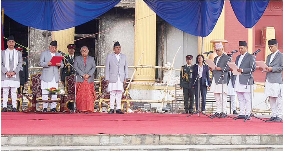
Nepalese President Ram Chandra Poudel, second from left, flanked by new Prime Minister Sushila Karki, third from left, attend an oath taking ceremony for ministers, right, in front of the presidential building vandalized during recent protests, in Kathmandu, Nepal.

MI News Service, Kathmandu : Nepal President Ramchandra Paudel on Monday administered the oath of office to three ministers inducted by newly appointed caretaker Prime Minister Sushila Karki into her cabinet.