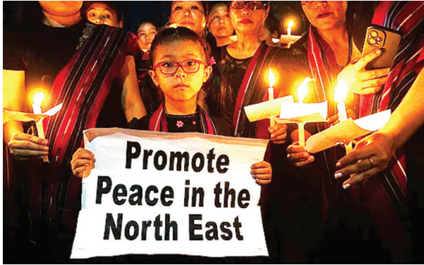
Homes of Kuki leaders in Manipur's Churachandpur were attacked, raising tensions despite existing peace agreements.