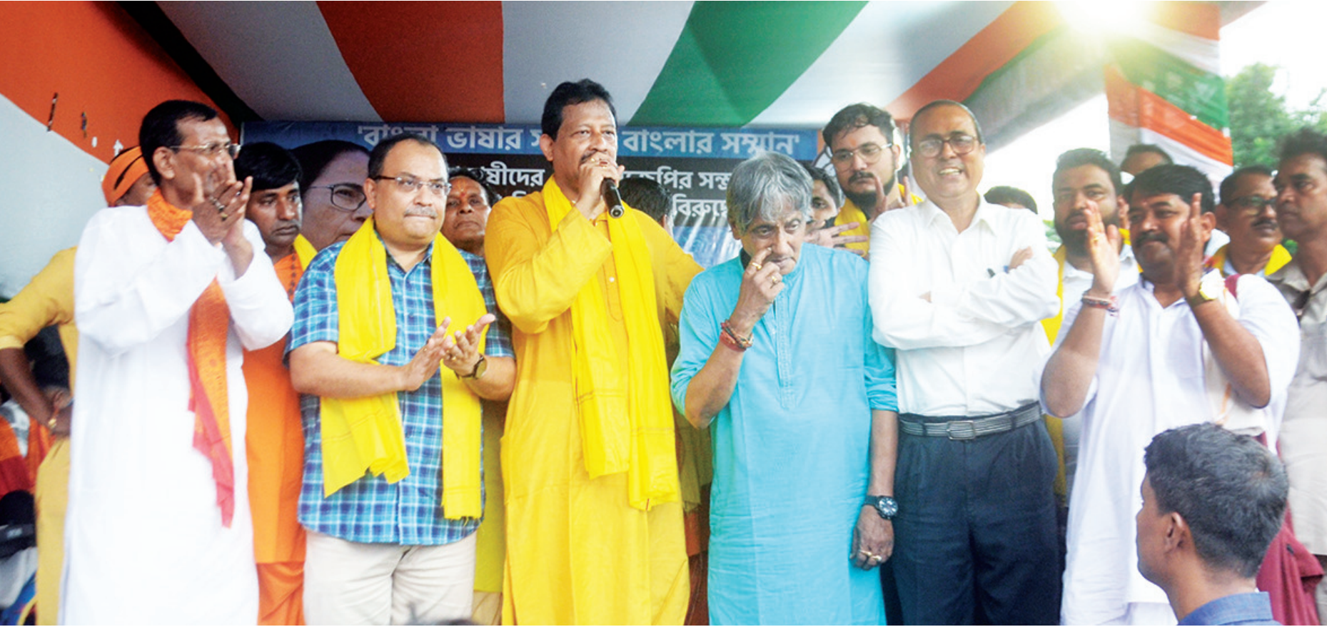
Protest by West Bengal State Sanatan Brahman Trust at Dharmatala against BJP's anti-Bengal stance on Monday in Kolkata.