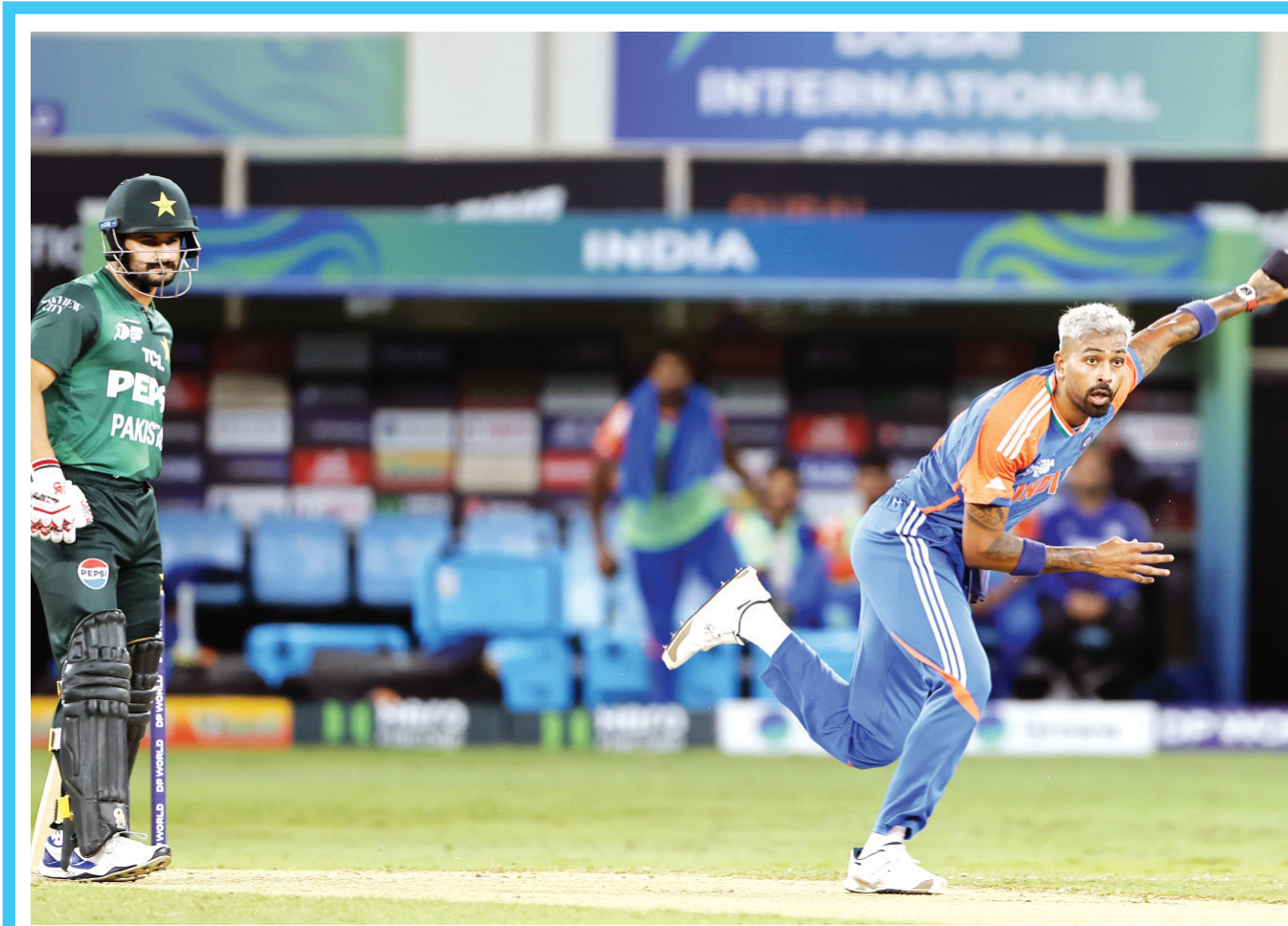
Hardik Pandya bowls during the Asia Cup 2025 match against Pakistan, at Dubai International Stadium in Dubai on Sunday.