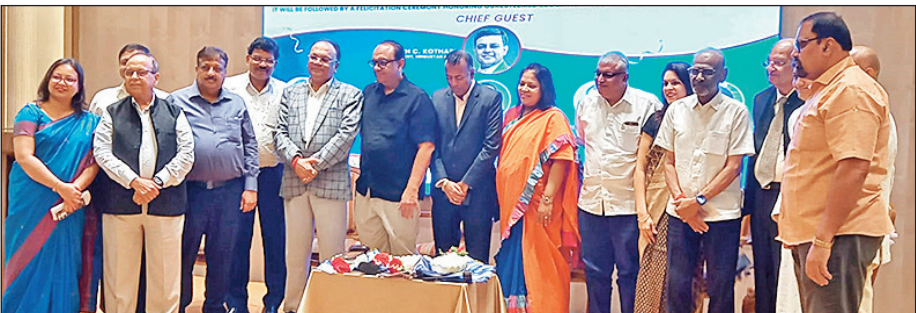
Hindustan Club, Kolkata recently hosted a symposium on 'Artificial Intelligence'. It was attended by host of scholars, intellectuals and entrepreneurs across Kolkata.