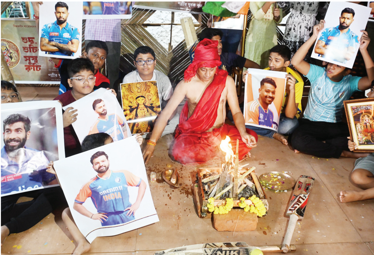
The youth of Amherst Street perform a Hom Yajna and prayer in Kolkata on Sunday for the India's victory in India-Pakistan cricket match in Asia Cup 2025.

From PG 1 the border's significance for Indian trade, noting that it is a key export point, with 99 per cent of the trade being exports and only one per cent being imports. "We only import herbal medicines from Nepal, and today, too, two trucks of herbal medicines have arrived from Nepal," he said.