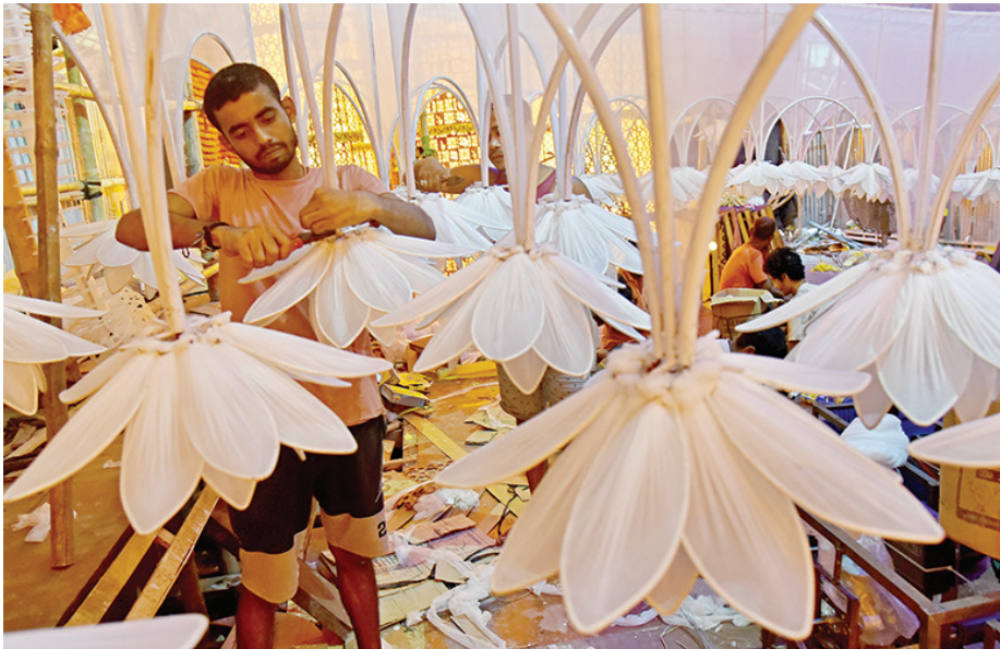
A worker is fully engrossed in a creative pursuit at Mudiali Puja pandal in Kolkata.

and Naxalbari, and postgraduate Hindi courses are now available in several institutions. The Chief Minister also noted that higher secondary question papers are now available in Hindi, and students of Rabindra Mukta Vidyalaya can take secondary examinations in Hindi. Further, she mentioned social welfare measures, including free social security schemes for workers in the unorganized sector, benefiting Hindi-speaking communities. Infrastructure developments for events such as the Ganga Sagar Mela were also highlighted. Acknowledging cultural traditions, CM Banerjee noted that the state government has declared a two-day holiday for Chhath Puja to respect the sentiments of the Hindi-speaking community. The Chief Minister concluded her message by extending warm greetings to all on Hindi Day.