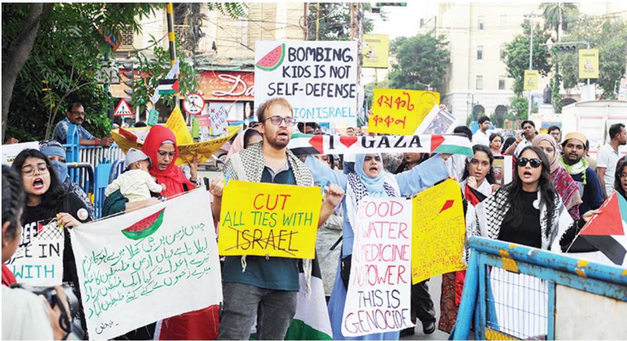
The Indian community held a protest condemning atrocities in Palestine. Demonstrators highlighted the loss of homes, families, and schools due to Israeli bombings and raised concerns over shortages of food, water, medicine, and electricity in Gaza. The rally expressed solidarity with Palestinians and called for urgent international intervention to end the crisis. The rally was organised in Kolkata on Saturday.