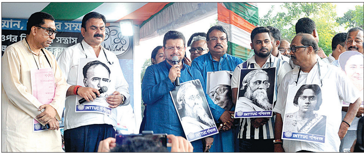
Trinamool Congress sit-in protest against BJP's anti-Bengal stance at Dharmatala, in Kolkata on Saturday.

An official inquiry has been launched, and police have begun examining CCTV footage from the hospital premises to identify the accused, a police sources said.