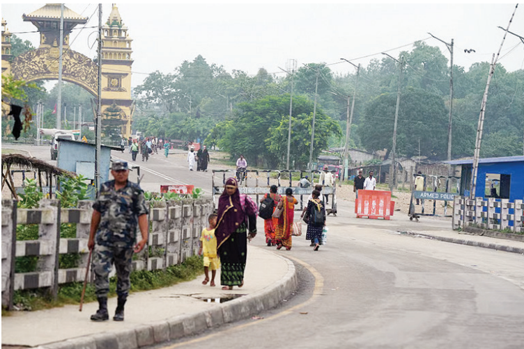
People move past a security check post in the wake of violent protests that erupted in Kathmandu, near the India-Nepal border, in Raxaul, Bihar.

Parliament building, the President's office, the Prime Minister's residence, government buildings, and offices of almost all political leaders. This rapid descent into chaos shocked many, and Nepal's military warned against "activities that could lead the country of over 30 million people into a total chaos and instability for the benefit of others".