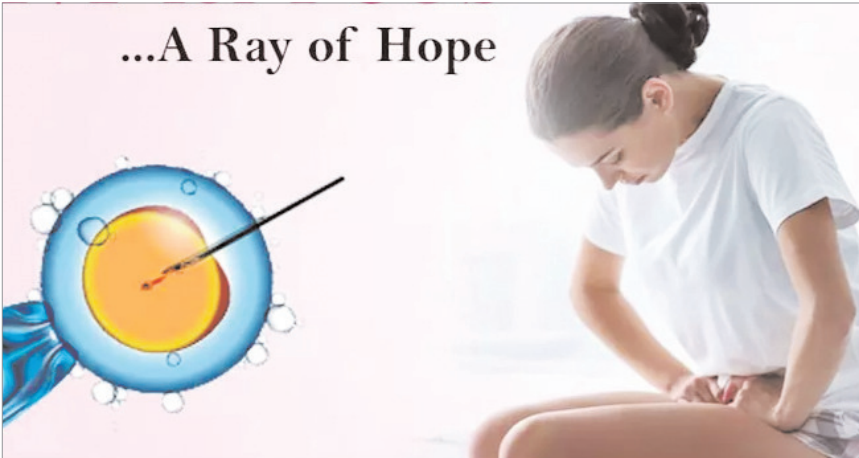
...A Ray of Hope Even during pregnancy, hormones are controlled by medication, thereby reducing the chances of hormonal imbalance and pregnancy loss in early pregnancy. This makes IVF an excellent option for women dealing with PCOS. Additionally, IVF offers a higher chance of getting pregnant with lower risks.

PATNA : Polycystic ovary syndrome or PCOS is one of the widespread causes of infertility among women. The hormonal condition affects an estimated 8-13% of women belonging to the reproductive age worldwide and of all up to 70% of cases remain undiagnosed, as per the World Health Organisation (WHO). Due to hormonal imbalance, women suffering from PCOS do not ovulate on time or may not ovulate at all. As a result, tracking their ovulation cycle becomes difficult, making it challenging for them to get pregnant. To all the women battling the condition, IVF offers hope and a pathway to achieve motherhood. IVF embraces a holistic approach when treating fertility. It does not only focus on using technology, but also emphasises on the importance of maintaining a healthy lifestyle. In some women battling with PCOS, making some moderate changes in their daily habits alone can increase the chances of getting pregnant. Ovarian stimulation is another important step in an assisted reproductive technique that corrects ovulation problems, thereby increasing the chances of concep-