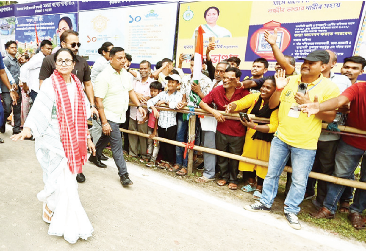
West Bengal Chief Minister Mamata Banerjee ahead of a meeting in Siliguri, North Bengal, on Wednesday.

and demanded that the government and large estates should step up their contribution to tea research. To address the resource constraints, she also called for setting up a committee to explore new revenue generation models, including property development and broadening TRA's membership base to small growers and bought-leaf factories. TRA said that it has developed climate resilient clones, advancements in pest management, IoT-based monitoring and product