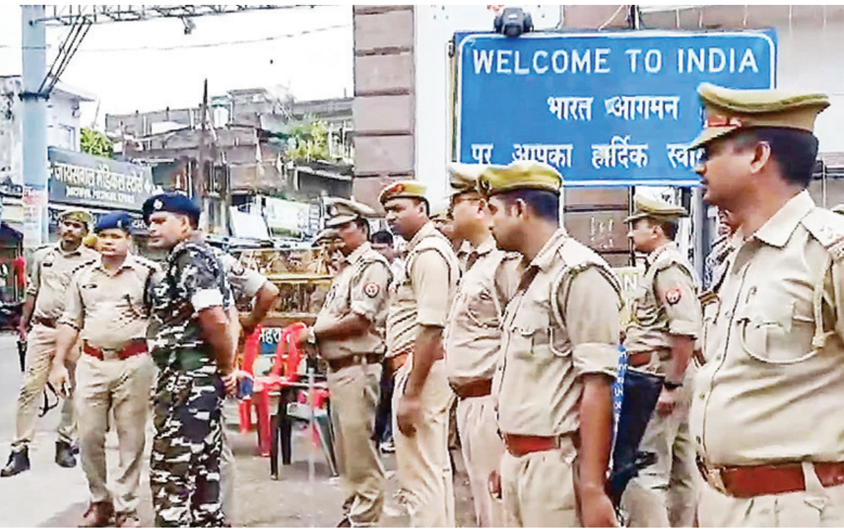
Security personnel keep vigil on the India side of the border with Nepal, in the aftermath of anti-government protests in the neighbouring country, in Mahrajganj district of UP.