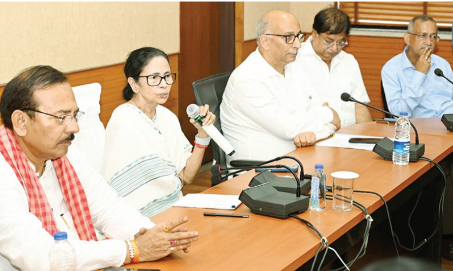
CM Mamata Banerjee addressing media at Siliguri on Wednesday.

MI News Service, Jalpaiguri : West Bengal Chief Minister Mamata Banerjee on Wednesday said efforts are underway to bring back tourists from Bengal, who have been stranded in violence-hit Nepal, within the next couple of days.