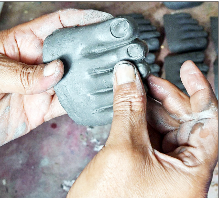
An artisan makes an idol of Goddess Durga at Kumortuli ahead of the Durga Puja festival in Kolkata