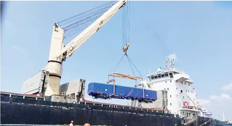
Syama Prasad Mookerjee, Kolkata facilitates arrival of coaches for Metro Railway, Kolkata- strengthening the march towards new India