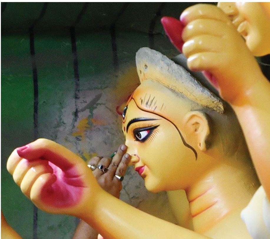
An artisan makes an idol of Goddess Durga at Kumortuli ahead of the Durga Puja festival in Kolkata, on Tuesday.

tapuri, Santali, Kurukh, Kurmali, Nepali, Hindi, Urdu, Odia, Punjabi, and Telugu. "Efforts are also underway to promote the Sadri language," she said. Institutions such as the Rajbanshi Development Board, Rajbanshi Cultural Academy, Rajbanshi Language Academy, and Kamtapuri Language Academy have been established to preserve and promote cultural and linguistic heritage. Nearly 200 Rajbanshi schools have also been granted government approval, she added. Banerjee also highlighted the formation of the Narayani Battalion of the state police, headquartered in Mekhliganj, and the installation of a 15-foot bronze statue of folk hero Mahabir Chila Ray at Baburhat, as part of wider efforts to honour Rajbanshi history and culture.