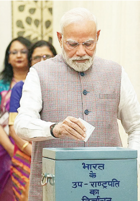
Prime Minister Narendra Modi casts his vote in the Vice-Presidential elections, at the Parliament premises, in New Delhi.