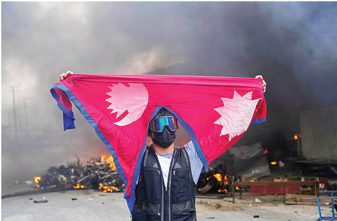
A protester shouts slogans carrying national flag after burning down a police station during protests against social media ban and corruption in Kathmandu, Nepal.

Demonstrations were reported from Kalanki, Kalimati, Tahachal, and Baneshwor in Kathmandu, as well as Chyasal, Chapagau, and Thecho areas of Lalitpur district. Protesters, mostly students, chanted slogans such as "Don't kill students", defying the restrictions on public gatherings. In Kalanki, demonstrators burnt tyres to block roads from the early hours of the morning, according to eyewitness accounts. According to media reports, four people were injured as police opened fire at the demonstrators. The agitating youths also pelted stones at the residence of Communication Minister Prithvi Subba Gurung in Sunakothi at Lalitpur district,