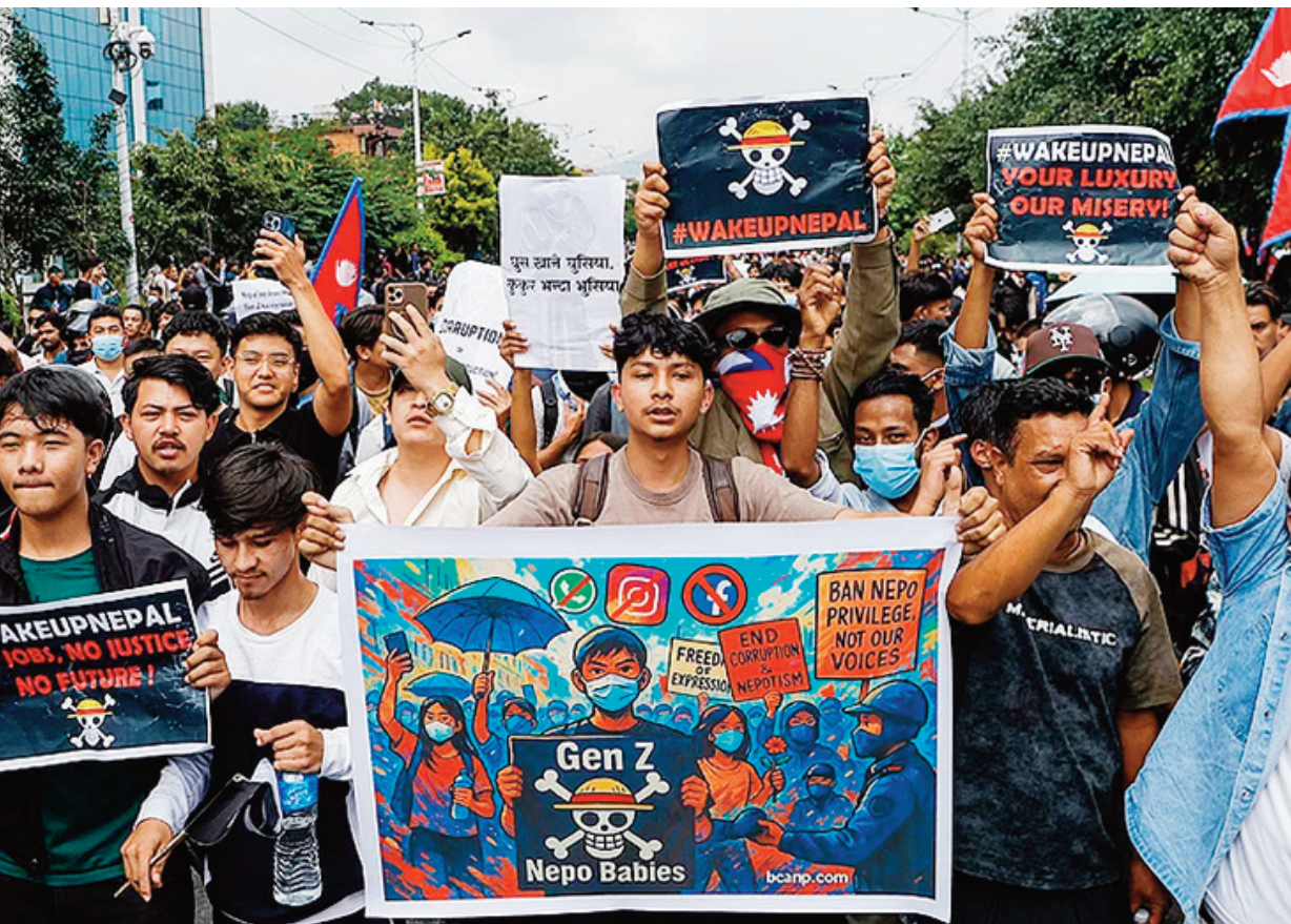
Students hold a protest over alleged corruption and Nepal government's decision to ban social media sites, in Kathmandu. The government later announced the withdrawal of the decision.