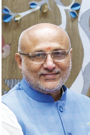
Newly elected Vice President of India C.P. Radhakrishnan

MI News Service, New Delhi : It was a day of numbers, loyalties, and quiet suspense as MPs gathered on Tuesday morning to elect India's 14th Vice President, a contest that