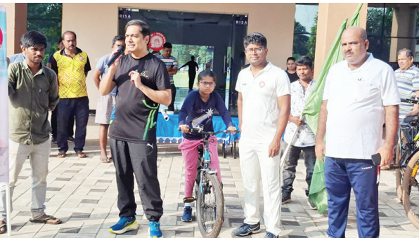
MI News Service, Bhubaneswar/Khurda Road:

In alignment with the nationwide Fit India Movement, Khurda Road Division of East Coast Railway organised a special Cyclothon-2025 under the banner of “Sundays On Cycle”. This initiative is aimed at promoting physical fitness, mental well-being and environmental awareness among railway employees and the wider community. To aware the FIT INDIA initiatives, East Coast Railway Sports Association (ECoRSA), Khurda Road Division in a Cyclothon from Railway Stadium to the Entrance Gate of IIT Bhubaneswar, Argul, and returned back covering a distance of 10 kilometers.