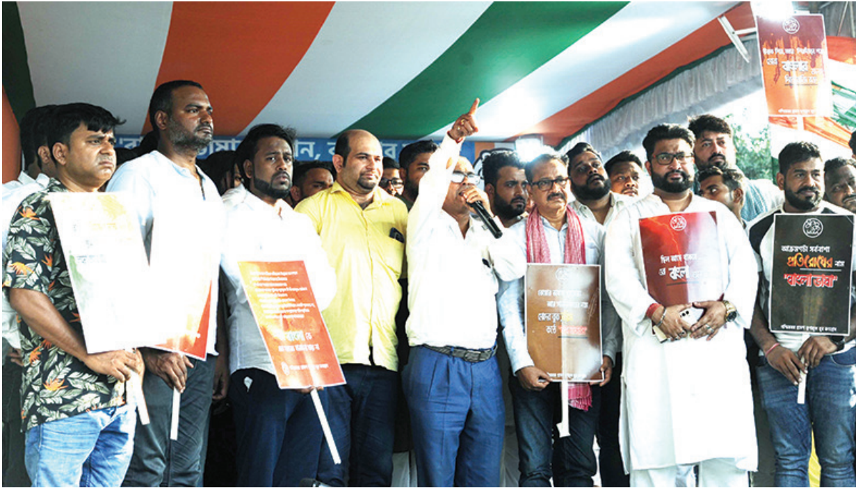
Trinamool Congress activists held a protest program against the atrocities on Bengali migrant workers in other states and the deprivation of Bengali language, in Kolkata on Monday

The upcoming programmes in Siliguri and Jalpaiguri are expected to highlight the government's ongoing welfare schemes and infrastructure projects in North Bengal. With Durga Puja around the corner, the Chief Minister's outreach to the region carries added significance, both politically and administratively. Despite the challenges posed by heavy rains, officials confirmed that security and logistical arrangements are being closely monitored to ensure smooth proceedings during Banerjee's two-day tour.