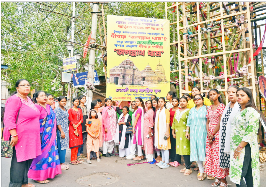
Inspired by Chief Minister Mamata Banerjee, this year's women-led puja organized by "Netaji Nagar Nagrikbrinda" in Ward 98, Tollygunge, has adopted the Jagannath Temple in Digha as its theme.