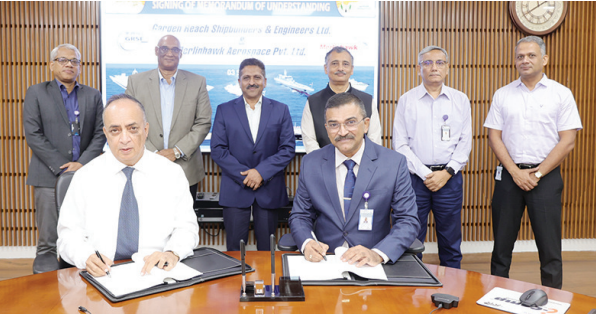
MI News Service, Kolkata:

Garden Reach Shipbuilders and Engineers (GRSE) Limited has signed a Teaming Agreement with M/s Merlinhawk Aerospace Pvt Ltd on 03 Sep 25, for the design, development, and manufacture of composite doors and hatches for the ships of Indian Navy being built at GRSE. Merlinhawk Aerospace is a well-recognized entity in the Indian industry ecosystem for its niche expertise in aerospace and defence sectors, offering design, prototyping and manufacturing solutions utilising high-end composite materials. This Teaming Agreement is aimed towards establishing a collaborative framework for the design, development, testing, manufacturing, and integration of composite doors and hatches onboard naval ships,