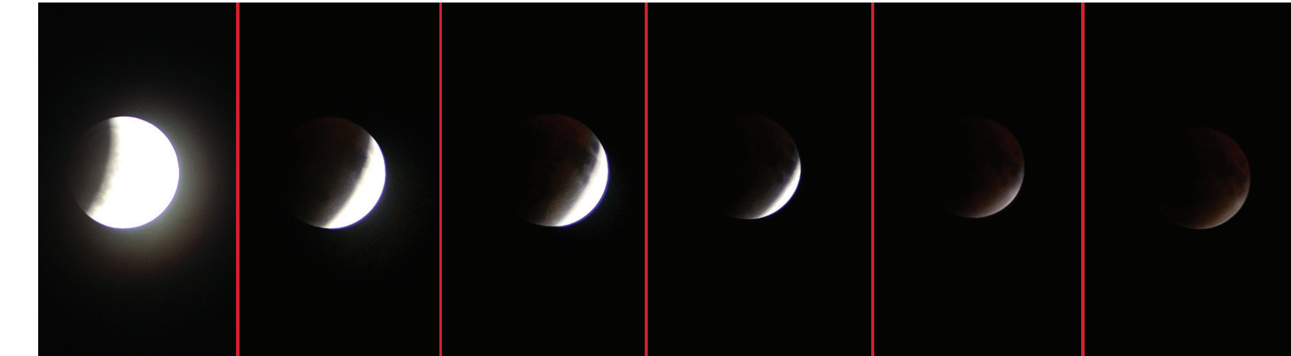
A total lunar eclipse of 'Blood Moon'. A cosmic spectacle that turned the night sky into a breathtaking canvas of red and shadow on Sunday night. A truly captivating astronomical event witnessed from Kolkata.