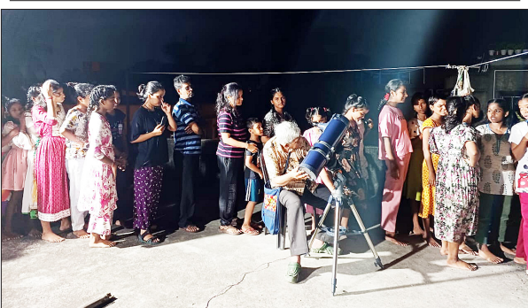
A large crowd gathered at Paschim Banga Vigyan Mancha's Lunar Eclipse awareness program on Sunday, September 7. The event was organized at Raipur Girls' High School in Bagha Jatin, South Kolkata.