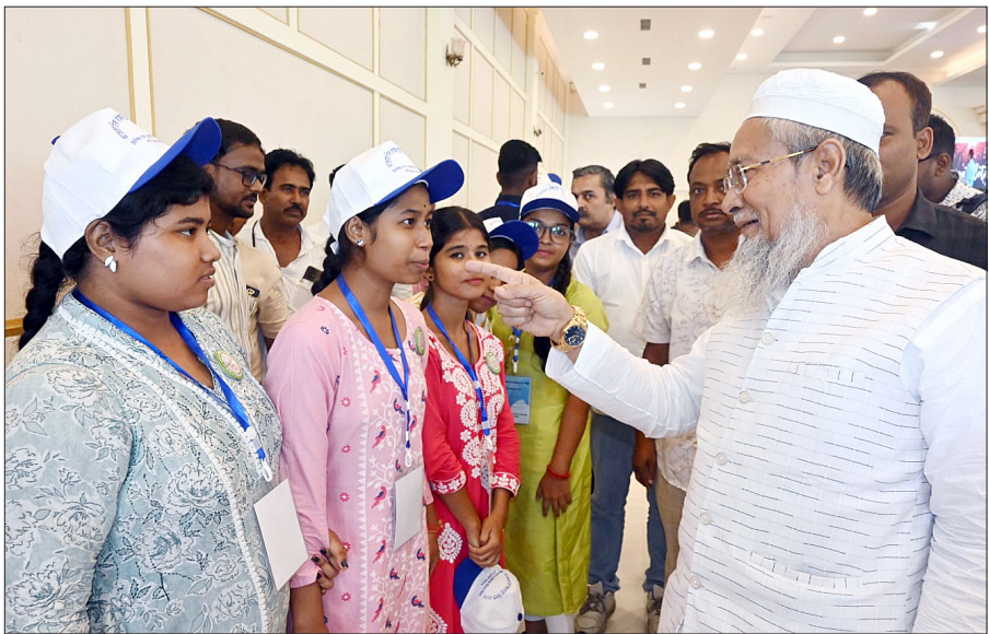
The Public Education Extension and Library Services Department of the Government of West Bengal celebrated International Literacy Day on Monday at the Utsari Sahagriha of Esopark. The program was officially inaugurated by the acting Minister of the department, Siddiquah Chowdhury, along with Law Minister Malay Ghatak, Chairman of the Legislative Assembly Municipal Corporation Sabayachi Chakraborty, and other departmental officials. The event focused on discussing the facilities and support available within the current educational system for students with special needs, including initiatives under the Department of Public Education Extension and Library Services, Adult Education, Social Education, and Education for Students with Disabilities. Students with special needs were honored with mementos, books, gifts, and other items during the ceremony. Minister Siddiquah Chowdhury emphasized that such programs will continue at the state level in the coming days to further encourage and support students with special needs.