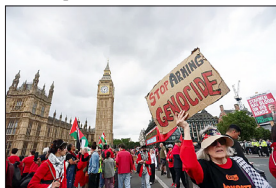
Pro-Palestine protesters attend a demonstration outside the UK Parliament, organised by campaign groups, calling for sanctions on Israel on June 4, 2025