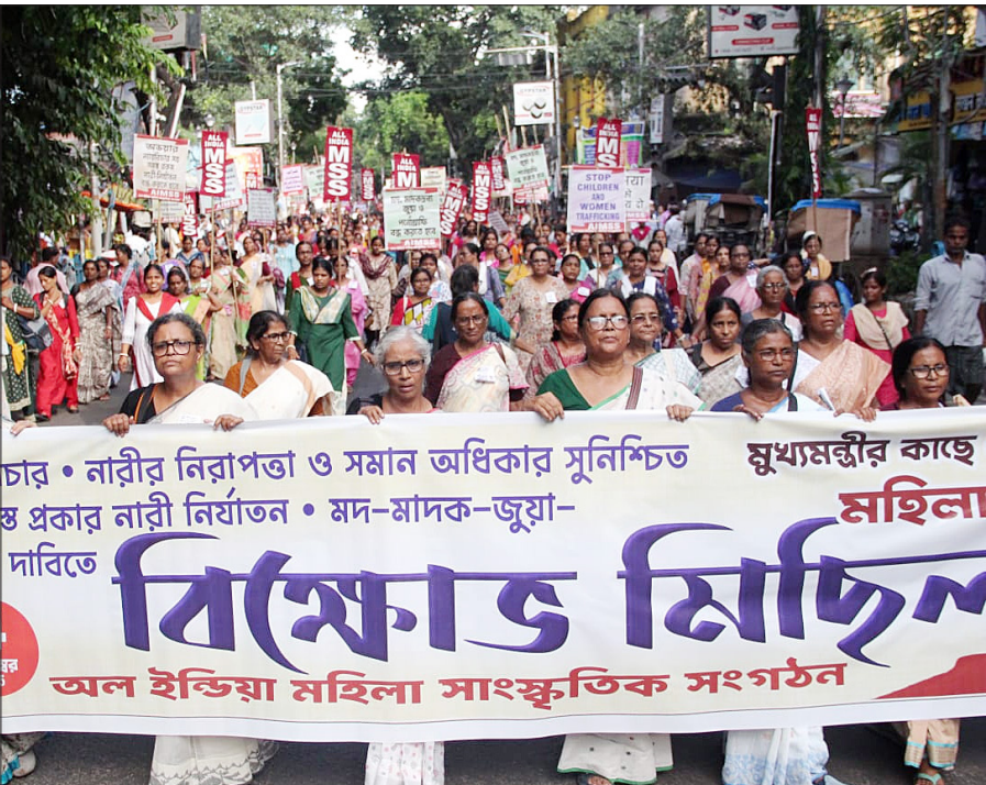
A women's organisation named 'All India Mohila Sangskritik Songothon' organised a rally regarding various issues and corresponding demands in Kolkata on Thursday.