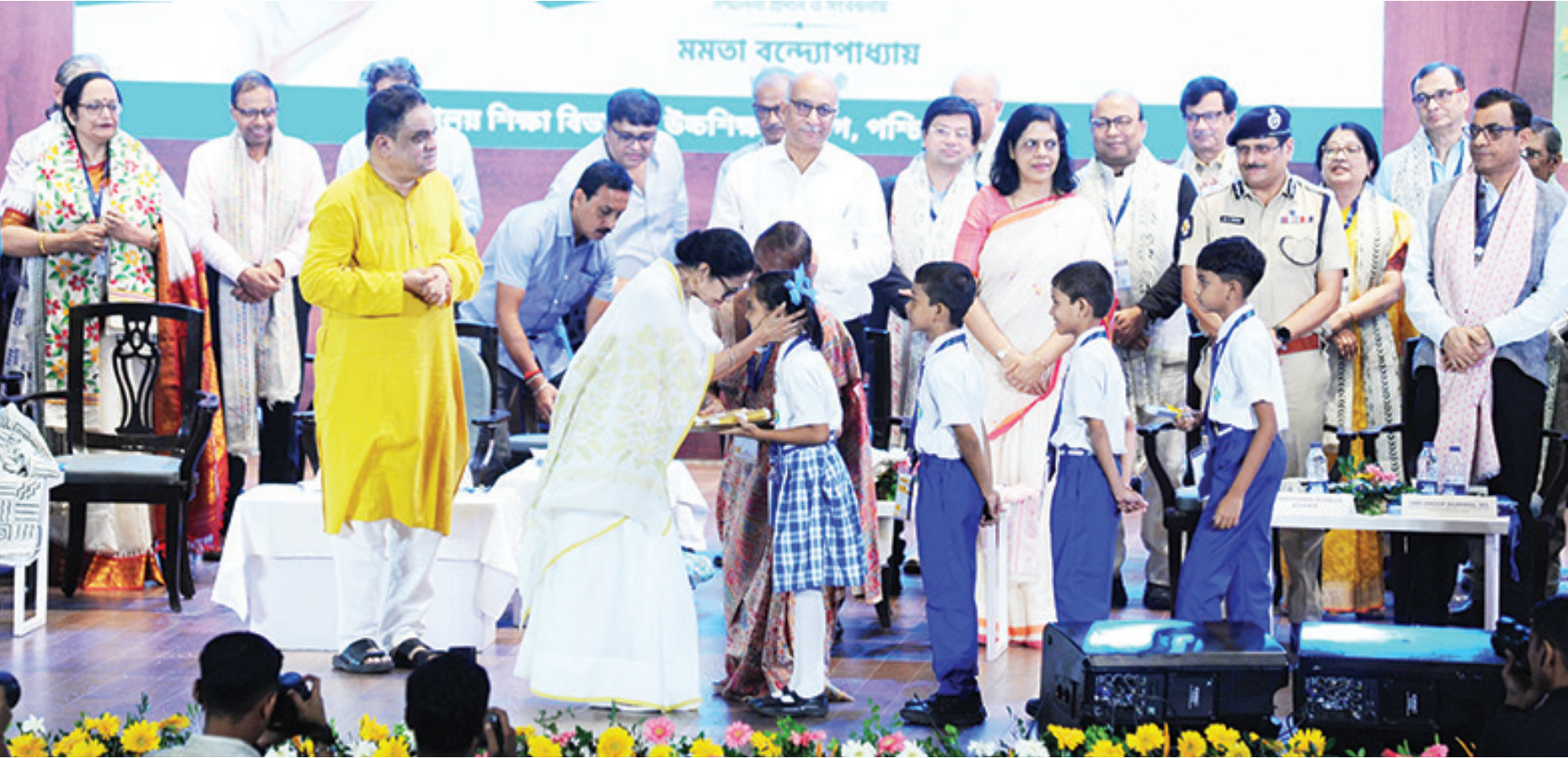
West Bengal Chief Minister Mamata Banerjee, who had served as a teacher at Bhawanipur Modern School in her early years, felicitated the school's headmistress and students on the eve of Teachers' Day, during a programme for celebration of Teachers' Day and felicitation of the toppers of board/council, organised by the State Department of Higher Education and School Education, at Dhono Dhanyo Auditorium in Kolkata on Thursday.