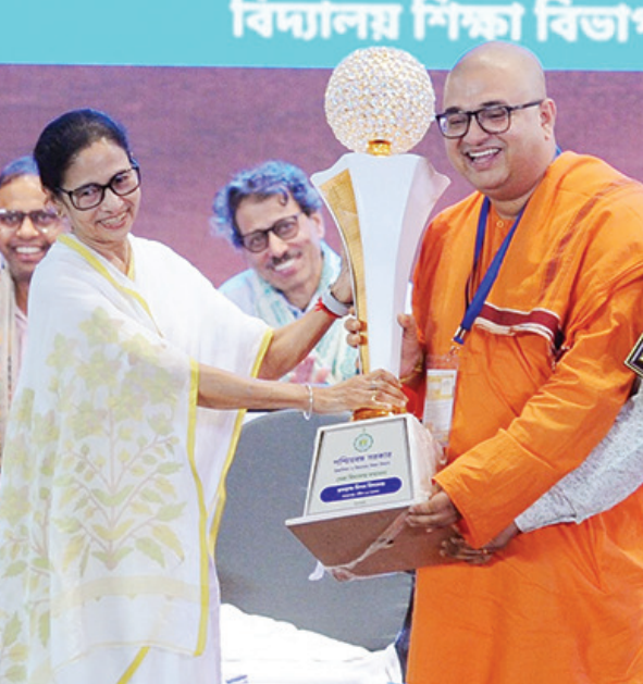
West Bengal Chief Minister Mamata Banerjee presented the Best School Awards to Narendrapur Ramakrishna Mission School and Baghbazar Nivedita School during a Teachers' Day celebration and felicitation of board and council toppers, organised by the State Departments of Higher and School Education at Dhono Dhanyo Auditorium, Kolkata, on Thursday.

jobs overnight. Banerjee announced that advertisements for 35,726 posts have already been issued, with another 21,000 vacancies pending. She further highlighted her government's record, stating that nearly 1.5 lakh appointments—covering primary, secondary, higher secondary, madrasa, technical, and non-teaching staff—have been made during her tenure, alongside 10,000 professors and principals. Welfare schemes such as Kanyashree, Sikshashree, and Aikyashree, she said, have also helped reduce school dropouts, bringing the primary-level dropout rate to zero, and at the higher levels, down to just three percent. From recognising schools to reciting poetry, from voicing cultural pride to addressing educational challenges, Mamata Banerjee's Teachers' Day was a reflection of both her political leadership and her personal creative spirit.