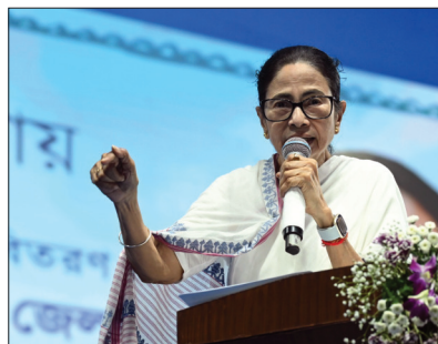
West Bengal Chief Minister Mamata Banerjee is addressing at a public distribution programme in Burdwan town on Tuesday.