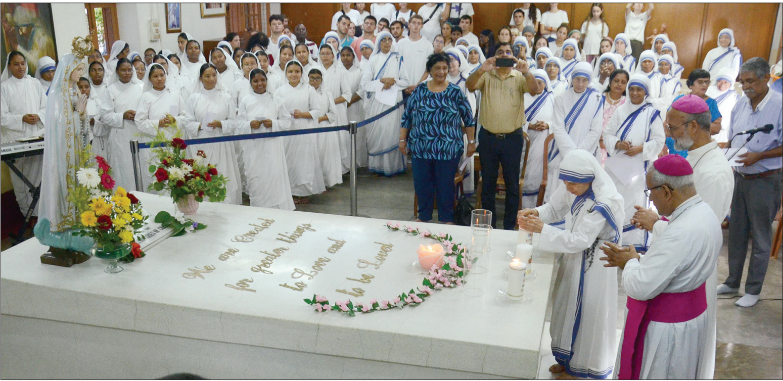
115th birth anniversary of Mother Teresa was observed at Mother House in Kolkata on Tuesday.