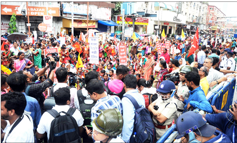
All Bengal Mid-Day Meal Workers Union supporters hold a protest over various demands during their 'March to Nabanna' in Kolkata on Tuesday.