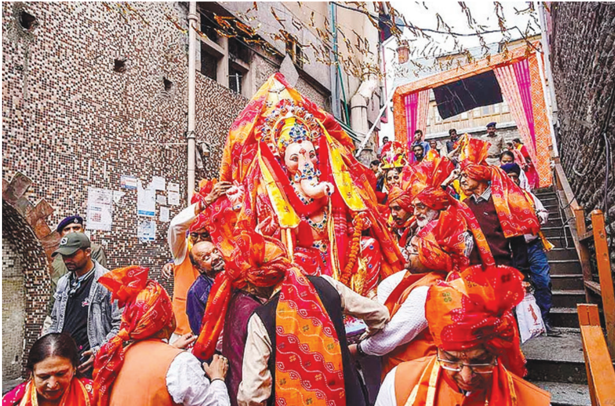
People carry an idol of Lord Ganesh on the eve of 'Ganesh Chaturthi' festival, in Shimla.