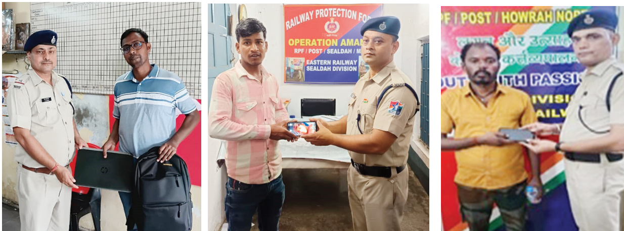
On 25.08.2025, under "Operation Amanat", RPF officials of Howrah and Sealdah Divisions of Eastern Railway recovered 03 mobile phones, 01 mobile charger, 02 fans, 02 wallets, and 04 bags containing laptop, clothes, mobile charger, documents, foreign currency, cosmetic items, miscellaneous articles, and cash of Rs. 3,030/-, all valued at Rs. 1,05,900/-, from different trains and railway premises at Howrah, Bamangachi, Barrackpore, Sealdah, and Coaching Sealdah Railway Stations. The recovered items were handed over to their rightful owners after due verification and proper documentation.

Ratnagiri, Rajapur Road, Vaibhavwadi Road, Kankavli, Sindhudurg, Kudal, Savantwadi Road, Thivim, Karmali, Madgaon Junction, Karwar, Gokarna Road, Kumta, Murdeshwar, Mookambika Road, Byndoor, Kundapura. In Central Railway, Ganpati special trains have been given stoppage at Dadar, Thane, Panvel, Pen, Roha, Mangaon, Veer, Khed, Chiplun, Kamathe, Sawarda, Aravali Road, Sangameshwar Road, Ratnagiri, Adavali, Vilavade, Rajapur Road, Vaibhavwadi Road, Nandgaon Road, Kankavli, Sindhudurg, Kudal and Jarap stations. Similarly, Ganpati special trains of South Western Railway will stop at SMM Haveri, Harihar, Davanagere, Birur, Arsikere, Tumkur, Yeshwantpur, Kunigal, Channarayana, Hassan, Sakleshpur, Subrahmanya Road, Kabakaputtur and Bantawala stations.