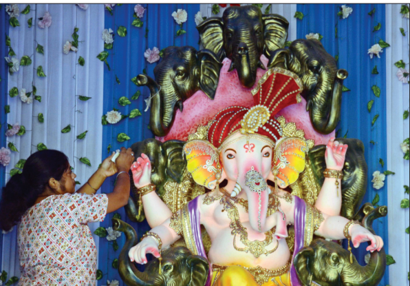
A woman decorating idol of Lord Ganesha ahead of Ganesh Chaturthi festival in Kolkata on Monday.

said. No one was injured in the accident, they added. The accident led to heavy congestion on the busy stretch on the first working day of the week. The driver of the bus fled following the accident, while the damaged vehicles were towed away.