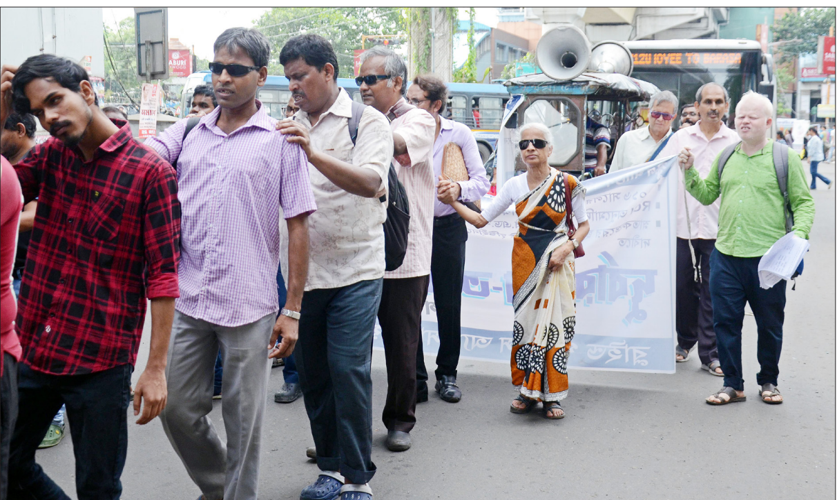
Protesting against the abolition of most of the posts reserved for the visually impaired in the 2016 SLST, illegal imposition of unscientific method of approving the blind as a copywriter and non-recognition of RCI approved special B.Ed. degree, visually impaired people march to SSC Bhawan demanding medical tests for disabled candidates to stop the use of fake disability certificates, at Salt Lake in Kolkata on Monday