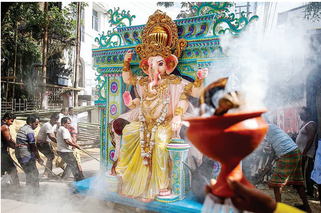
People carry an idol of Lord Ganesh ahead of the 'Ganesh Chaturthi' festival, in Agartala.

MI News Service, Tehran: Iran's Supreme Leader Ali Khamenei said that the United States confronts Iran because it wants the country to be "obedient," a demand he called "offensive" and vowed the nation would resist. Speaking in Tehran, on Sunday, Khamenei rejected calls for direct negotiations with Washington and said US hostility has been consistent since the 1979 Islamic Revolution. Xinhua news agency reported quoting the official news agency IRNA. He referred to a June 13 attack on Iran, saying that US-linked groups met in a European capital the next day to discuss a "post-Islamic Republic" order, even proposing a monarch. Those efforts, he said, were thwarted by the resilience of the Iranian people and state institutions. The rare Israeli and US attacks in June, which targeted key nuclear sites and prompted Iranian retaliation, were designed to destabilise the Islamic republic, Khamenei argued.