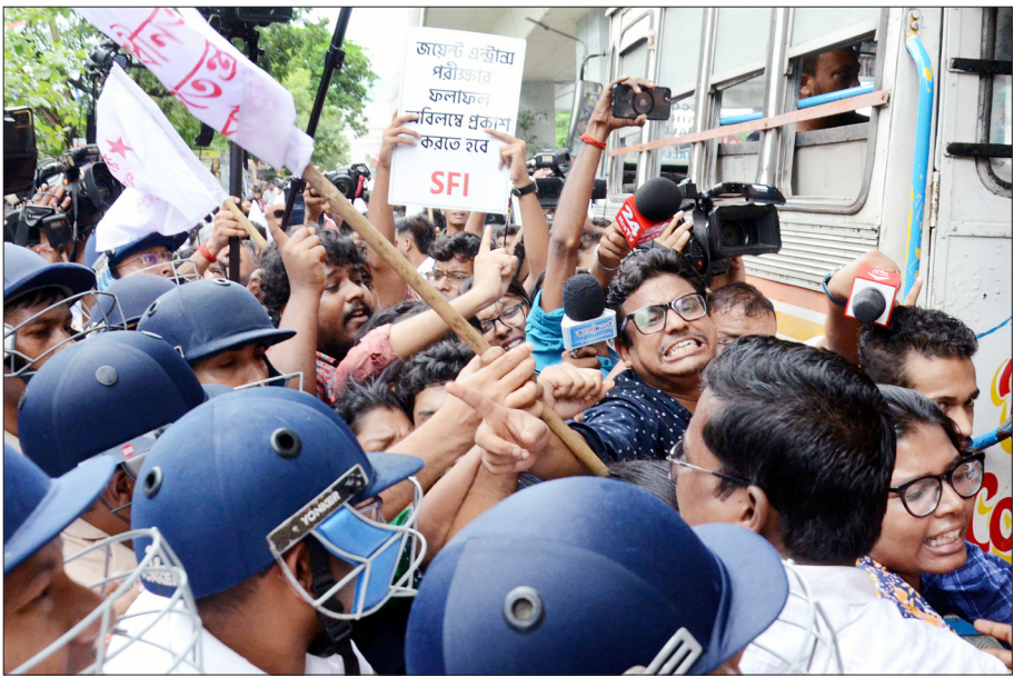
Police detain Students' Federation of India (SFI) activists took part in a protest rally against State Government Bhawan during their march to Bikash Bhawan over merit list for admission to college after higher secondary is not out yet and the results of the Joint Entrance Examination are not out issue, at Salt Lake in Kolkata on Tuesday