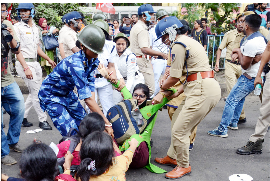
Police detain interview neglected 2022 Primary Teacher Eligibility Test (TET) passed candidates took part in a protest rally against the State Government, demanding for their permanent jobs at Salt Lake in Kolkata on Tuesday.

He also shared that the film got a good response in the US, "aur hum ko waha ka Capitol Hill mein invite kiya gaya, 'The Bengal Files' ko present karne ke liye."