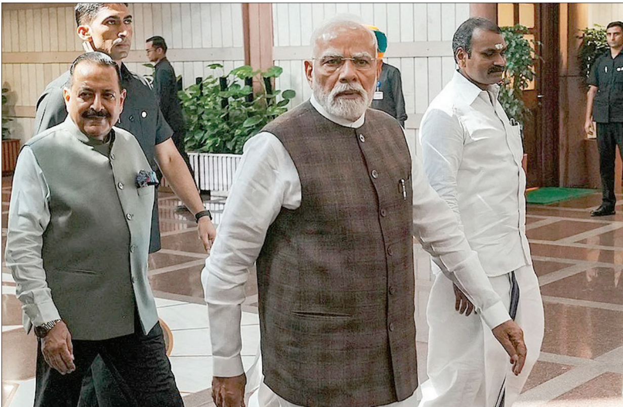
Prime Minister Narendra Modi arrives to attend the NDA parliamentary party meeting, in New Delhi.