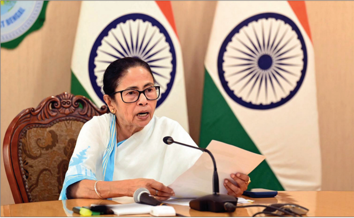
West Bengal Chief Minister Mamata Banerjee addressing a press conference at Nabanna on Monday.