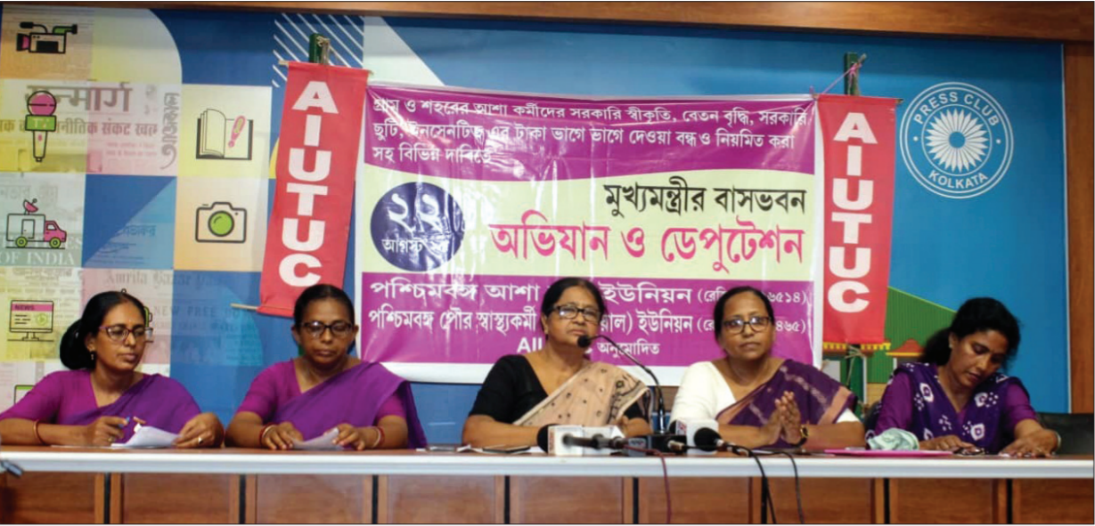
Thousands of ASHA workers from villages and cities will hold a Kalighat drive and submit a deputation to the Chief Minister regarding their various problems and demands. A joint press conference of the West Bengal ASHA Workers' Union and the West Bengal Municipal Health Workers' Contractual Union was held on August 18 at 3 pm at the Kolkata Press Club. The unions have called for a larger movement in the coming days on key issues, including an increase in allowances, payment of pending monthly incentives, and an end to installment-based payments.