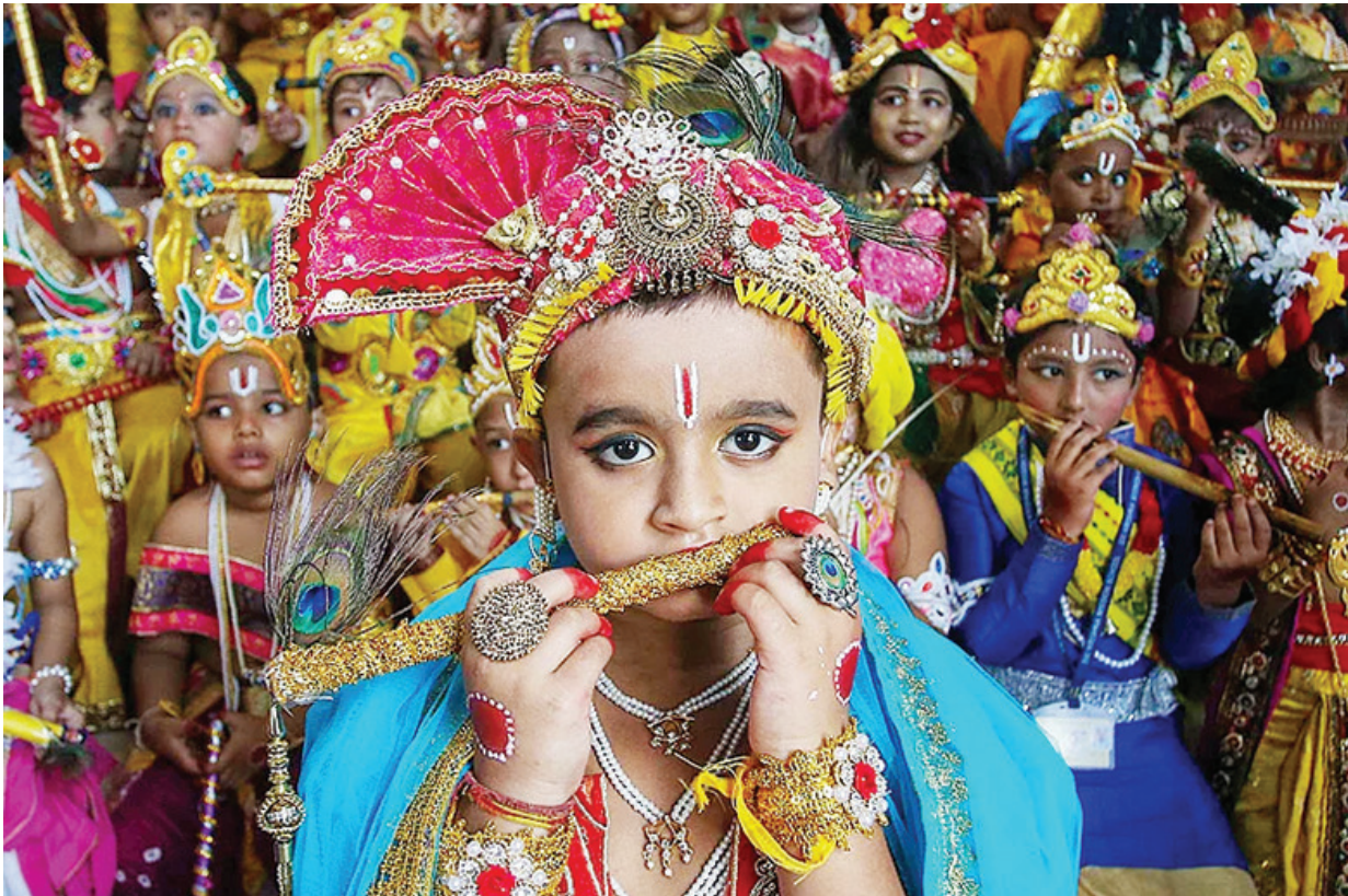
A student dressed as Lord Krishna at a school function ahead of Janmashtami festival, in Agartala.