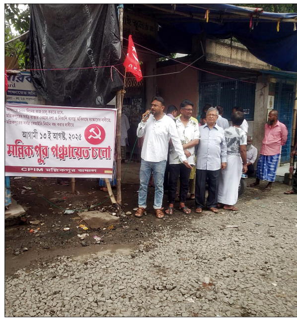
Protest corner meeting of the CPI(M) was held in front of Mallickpur Abdas Shakur High School against various problems faced by residents of the Mallickpur Panchayat area, including rainwater logging on the main road and lanes. For these issues, and demands such as a better drainage system and the establishment of a new high school, a deputation was submitted to the panchayat authorities.