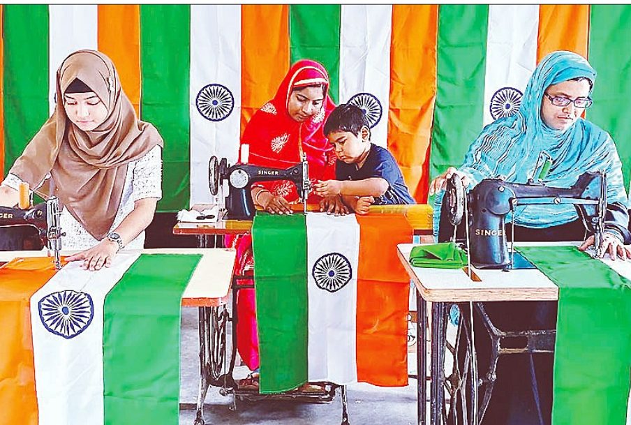
Women prepare the tricolour ahead of Independence Day celebrations, at a workshop in Nadia, West Bengal.