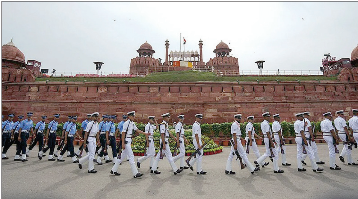
Indian Navy and Air Force personnel march during full dress rehearsal for 79th Independence Day celebrations, at the Red Fort complex in New Delhi.