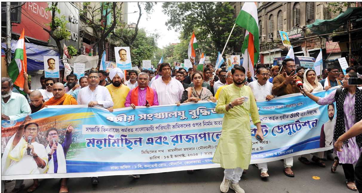
Bangiyo Sankhalaghu Buddhijibi Mancha held a rally condemning discrimination against Bengali migrant workers, unfair “Bangladeshi” accusations, and denial of voting rights via SIR. The march went from Moulali Ramnala Mandir to Dharmatala Gandhi Statue, in Kolkata on Wednesday.