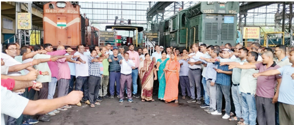
Pledge taking ceremony at diesel shed Jamalpur