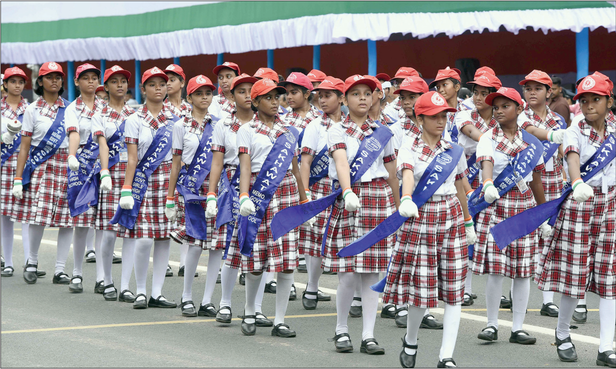
Kolkata Police personnel, school students, and artists participate in a full-dress rehearsal of the parade at Red Road ahead of the Independence Day celebrations in Kolkata on Wednesday.

The Commission, however, said that it has already flagged its reservations about these documents, citing several fake ration cards. The bench, however, verbally told the Commission again to consider at least the statutory documents of Aadhaar and EPIC.