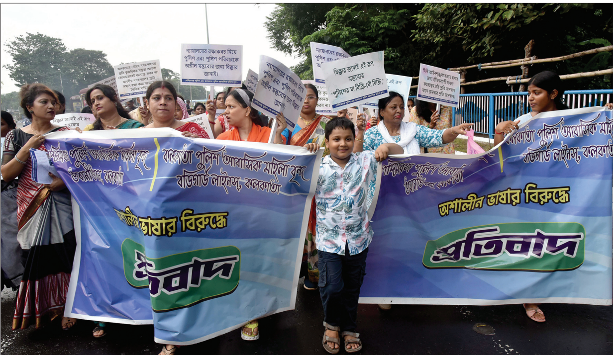
Female family members of serving Kolkata and West Bengal Police personnel held a press conference at the Press Club condemning abusive language and personal attacks on police officers, followed by a rally from the Gandhi statue in Kolkata on Tuesday.

the 2026 Assembly elections, highlighting its three-month operational plan at the booth level to deliver public services swiftly and effectively. She had assured that this mechanism would enable quick and simple solutions to local problems, reducing bureaucratic delays. Implementation began promptly after her announcement, and within just two days, record numbers of services had been delivered through these camps. Both government officials and elected representatives have been instructed to partici- pate actively in the programme. With the latest directive, Mamata Banerjee has now formalised the role of ministers, ensuring they act as active field leaders rather than passive overseers. The expectation is that their regular presence, coupled with on-the-spot decision-making in coordination with DMs, will make Amader Para, Amader Samadhan a model of participatory governance—where solutions are brought to people's doorsteps and their voices directly shape administrative action.