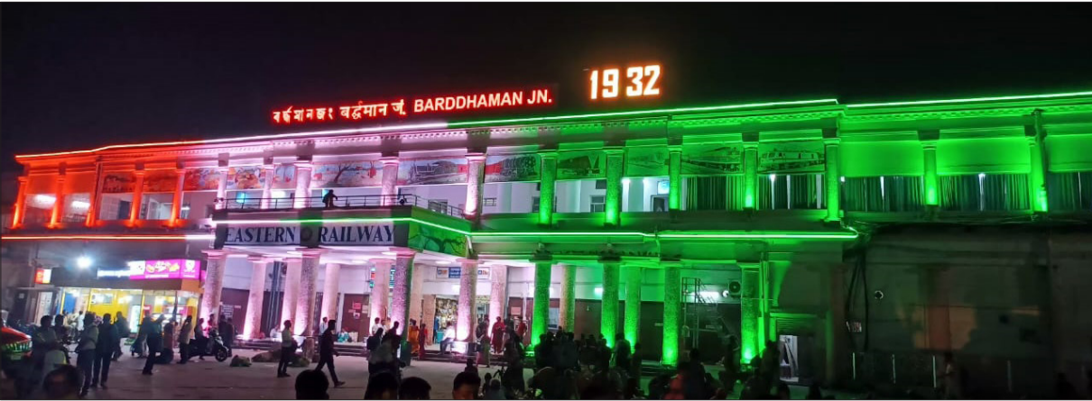
As part of Azadi Ka Amrit Mahotsav and in the run-up to the 79th Independence Day, Howrah Division of Eastern Railway has illuminated iconic locations, including Howrah Station, Bardhaman Station, and the Gitanjali Rail Museum at Bolpur, in tricolour. The Division is also actively promoting the Har Ghar Tiranga campaign, encouraging railway staff, passengers, and the public to capture photographs with the national flag.