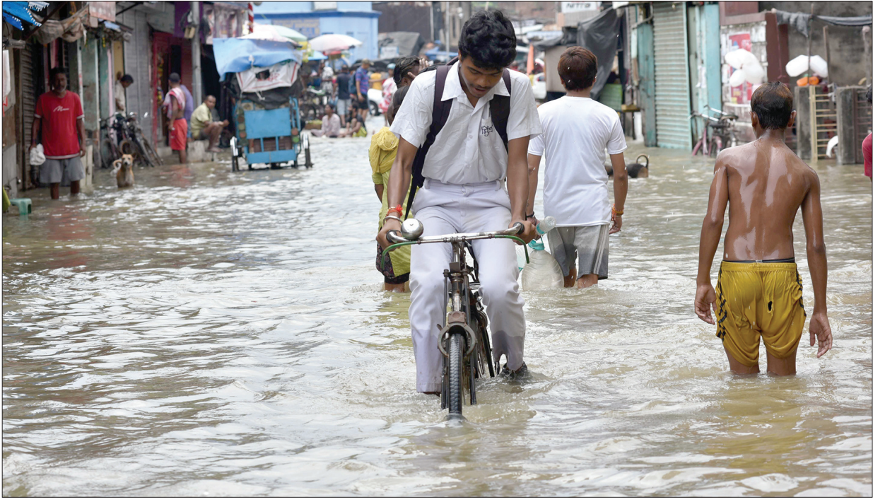
People move through a waterlogged road during high tide in the Ganga River, at Kalighat area in Kolkata on Monday.

According to the civic body's Planning and Development Department, the target is to install fencing along approximately 31 kilometres of Adi Ganga's banks. Thus far, only about five kilometres have been completed, with progress dependent on the phased release of allocated funds. The first iron mesh installation was undertaken a few years ago at the Kalighat bridge over the TollyNullah, followed by similar work along the Kalighat stretch of the Adi Ganga. Gradually, this initiative expanded to key points in Alipore, Chetla, and Garia. In parallel, a massive desilting and dredging operation is underway along the TollyNullah — from Doyghat through Garia to Sonarpur — covering roughly 15.5 kilometres. Desilting up to Garia has been completed, with work now progressing toward Sonarpur. However, civic officials lament that despite the high costs of cleaning and dredging, sections of the canal are again being polluted due to the actions of some residents. Offerings such as flowers and bel leaves, as well as everyday household waste, continue to be dumped into the water. To combat this recurring problem, the KMC is installing not only iron mesh but also raised walls along the banks to reinforce protection. The civic body believes this dual measure will substantially reduce waste disposal into the Adi Ganga. Nonetheless, officials acknowledge that securing the necessary state funding remains the biggest challenge to completing the project in its entirety.