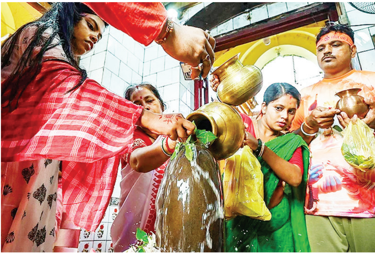
Devotees perform 'Jalabhishek' of a shivling at Shiv Bari temple, in Agartala.

Albanese said. Those commitments included no role for Hamas in a Palestinian government, demilitarisation of Gaza and the holding of elections, he said. "A two-state solution is humanity's best hope to break the cycle of violence in the Middle East and to bring an end to the conflict, suffering and starvation in Gaza,"