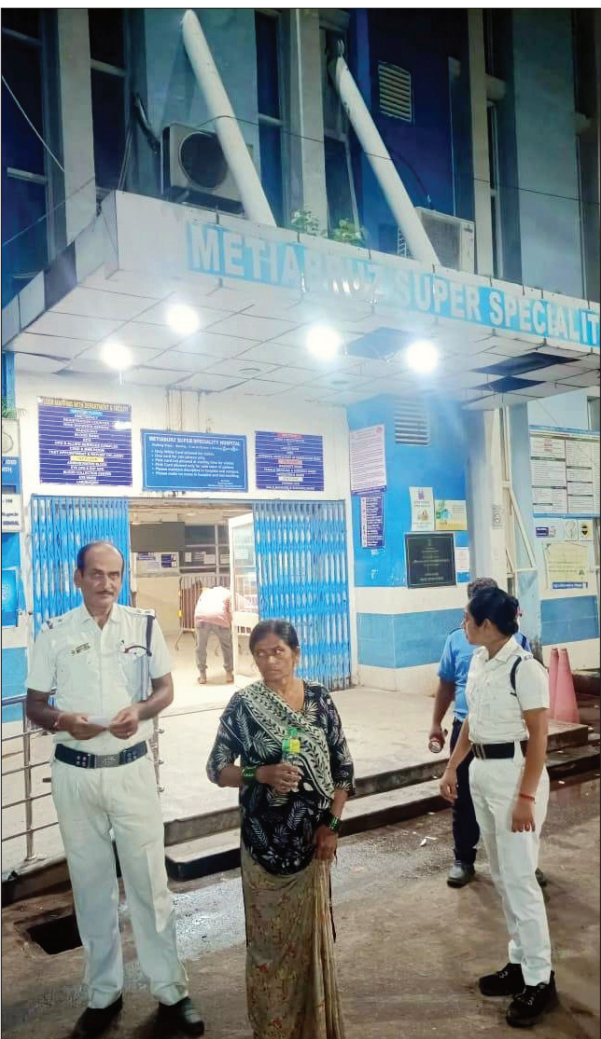
In a swift and heroic effort, the Indian Navy rescued a woman from drowning in the Hooghly River past midnight. At around 12:45 AM, the crew of a Sagar Prahari Bal Fast Interceptor Craft, under the Naval Officer-in-Charge, Kolkata, spotted the woman struggling in the river's strong current. Despite complete darkness, the crew acted promptly, navigating towards her and pulling her aboard safely. After calming the distressed woman, they brought her ashore and handed her over to the River Traffic Police. The Navy's timely response averted a potential tragedy and showcased their unwavering vigilance.

What began as a procedural disagreement has now expanded into a full-blown political and constitutional clash, with disciplinary actions against state officials and strong remarks from both the ruling party and the opposition. Whether the Commission or the state prevails remains to be seen—but the SIR has clearly become a major flashpoint in Bengal's electoral landscape.