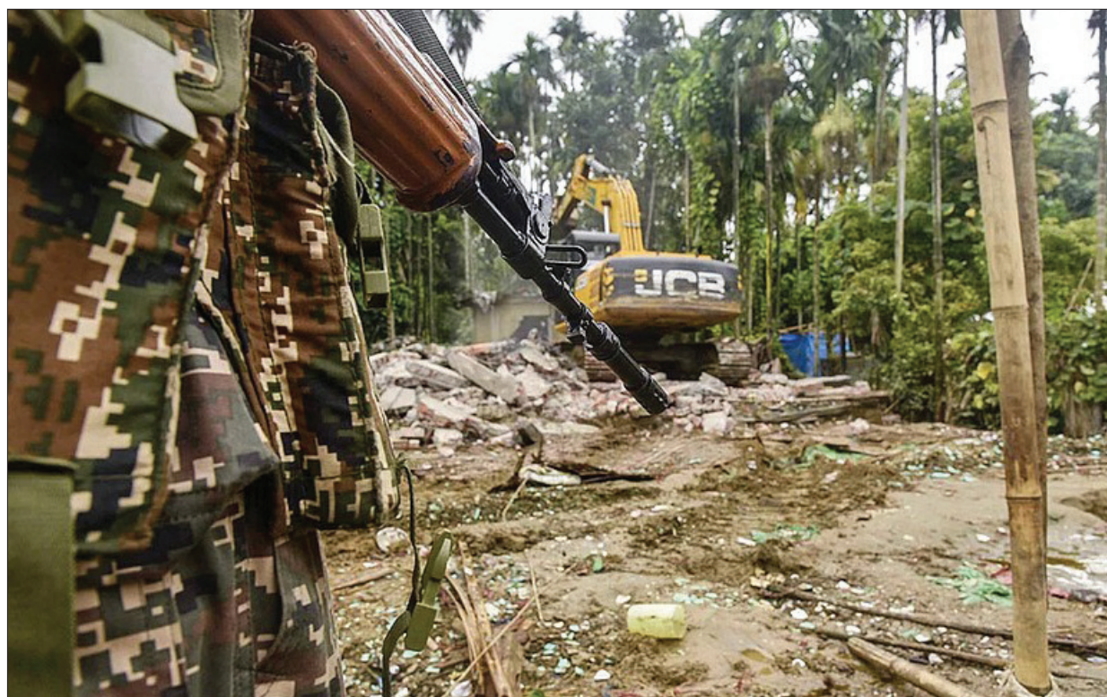
An excavator being used to demolish encroachments during a drive, at Negheri Bil in Golaghat district, Assam.