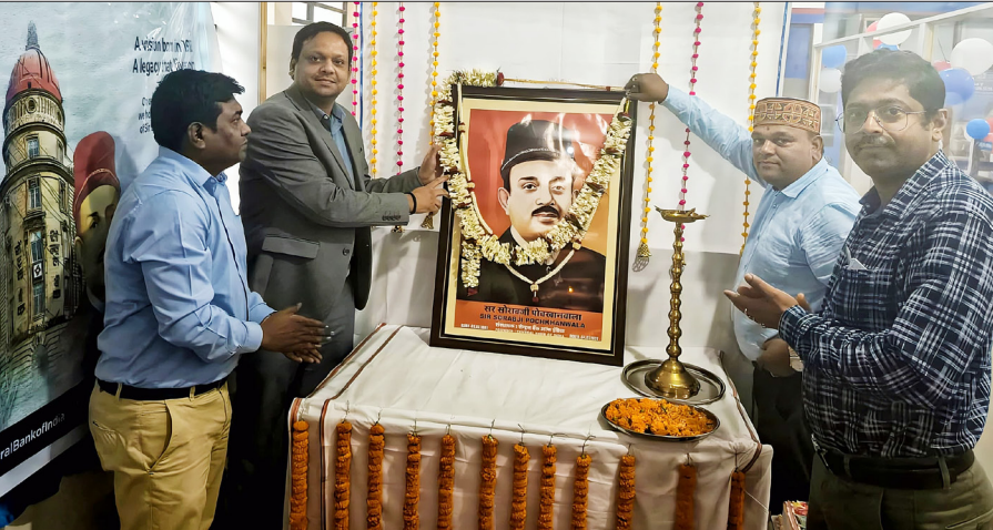
On Friday Central Bank of India celebrated its 144th foundation day which was scheduled for August 9. The Bank personnels garlanded the founder Sir Sorabji Pockhanawala's portrait on this auspicious occasion.