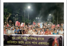
Junior Doctors & Doctors took out a protest march in Kolkata on Friday night