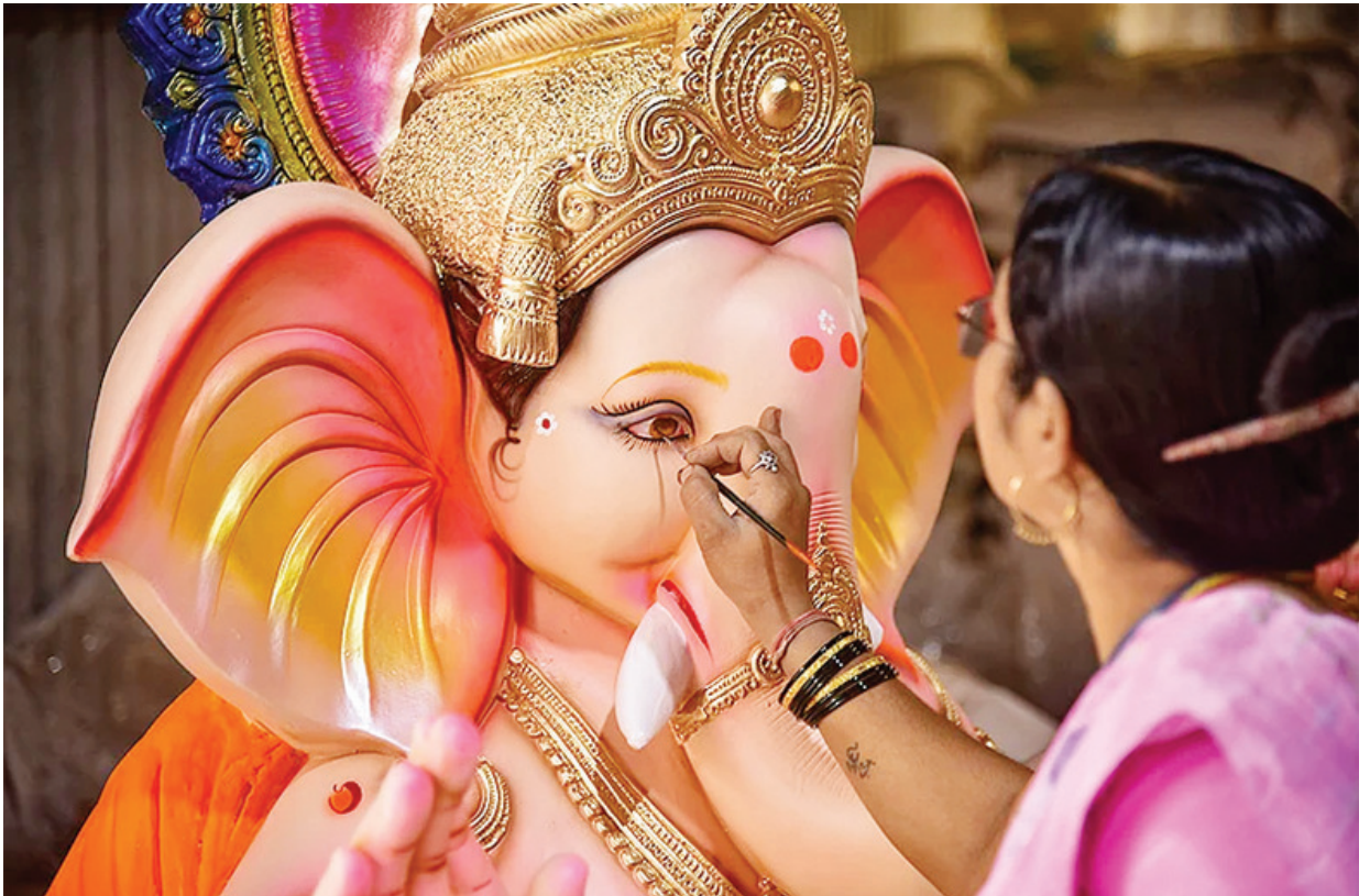
An artist gives finishing touches to an idol of Lord Ganesha ahead of Ganesh Chaturthi festival, in Karad, Maharashtra.

These trains are capable of running at 130 km/h. For the first time in Indian Railways history, semi-automatic couplers have been introduced, improving ride quality and coach connectivity. With the locomotive, the rake ensures high-speed stability and better performance. For enhanced safety, the coupler is equipped with crash tubes and a mechatronics-assisted braking system, enabling faster and more effective braking — a first in Indian trains. Additionally, the train is equipped with fully sealed gangways and vacuum evacuation systems. To facilitate two-way communication between passengers and security personnel, an emergency talk-back system has been installed in each coach. For the first time, fire detection systems have been introduced in non-AC coaches, marking a new milestone in passenger safety. The train also features On-Board Condition Monitoring System (OBCMS) for real-time monitoring of wheels and bearings. Internet-based water level indicators assist station staff and on-board personnel. Moreover, external emergency lighting has been introduced for the first time in any Indian train.