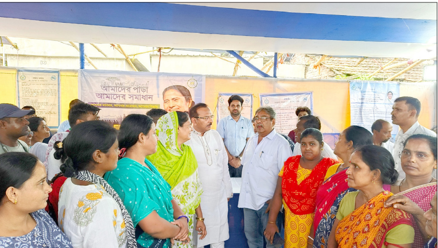
State Minister Aroop Biswas, along with local municipal representative Sandeep Nandi Majumdar, visited the 'Paray Samadhan' Booth No. 1 and Booth No. 2 at Remount Club in Ward 94 of Tollygunge on Friday.