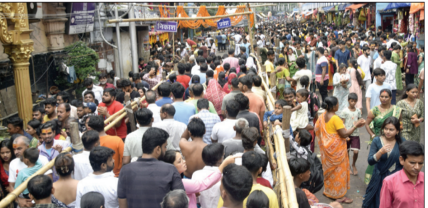
Devotees through the streets in large numbers as they wait in a long queue for darshan during a vibrant religious celebration of Sravan at Bhutnath Temple, with the lanes buzzing with chants, colors, and spiritual fervor in Kolkata on Monday.

MI News Service, Kolkata: With less than two months to go before the festive Durga Puja season, cyber fraudsters have launched a sophisticated scam operation targeting travel enthusiasts. Their method is deceptively simple—posing as luxury hotel agents, they contact unsuspecting travellers by phone under the pretext of facilitating exclusive bookings, only to dupe them of large sums of money. According to Kolkata Police's Detective Department, this isn't the first time such incidents have occurred. Similar frauds have previously been reported in tourist hotspots like Puri, where multiple travellers lost significant amounts during fraudulent hotel booking attempts. One recent victim from Parnasree, intending to book a hotel in Puri for 7,000, ended up losing 70,000. The scam, now dubbed by police as the "Online Five-Star Scam," has reportedly expanded beyond domestic destinations to include international hotel bookings.