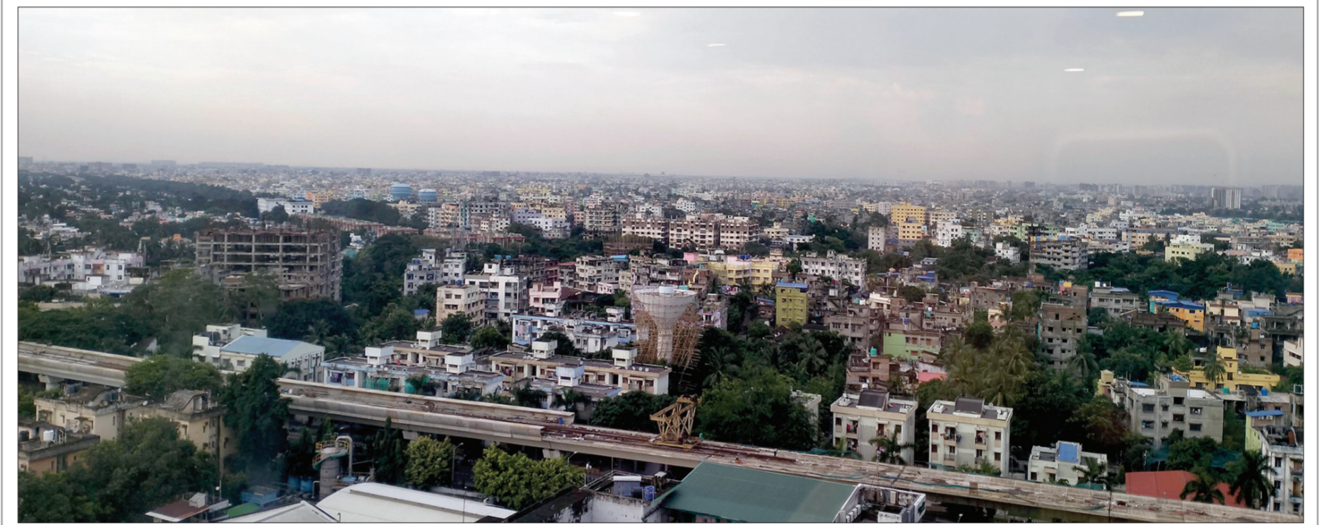
A captivating aerial view of Bidhannagar, revealing a sprawling urban expanse with a mix of residential buildings, lush greenery, and ongoing construction, all beneath a calm, overcast sky, on Monday.

The Chief Minister has demanded immediate central intervention, stating that such indiscriminate actions are "disastrous and deeply worrying for Bengal's future."