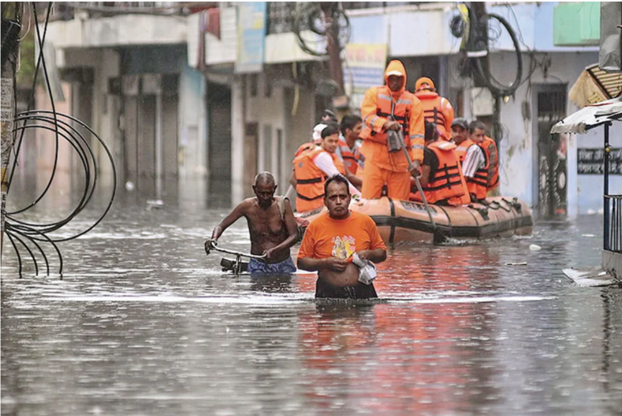
SDRF personnel evacuate people from a flooded area amid a rise in the water level of the Ganga river during the monsoon season, in Prayagraj.