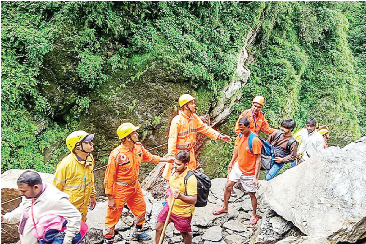
Rescue personnel assist people in moving on a route blocked by debris and boulders after heavy rainfall during the annual 'Kedarnath Yatra', near Gaurikund, in Rudraprayag district, Uttarakhand.