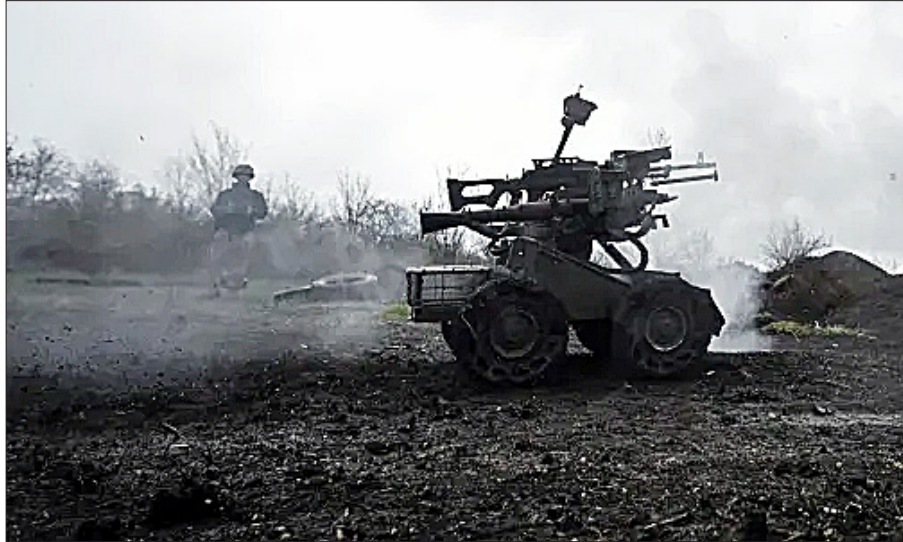
A Ukrainian soldier fires an RPG-7 grenade launcher mounted on an unmanned vehicle during training in the Zaporizhzhia region of Ukraine.

Air strikes on Sochi, about 400km (250 miles) southeast of the Ukrainian border, are relatively rare compared with other Russian cities. However, Ukrainian drone attacks killed two people in the