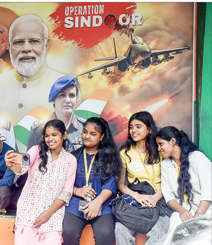
College students take selfie with Sindoor poster near Thane Rest House, on Sunday.

These new services by Indian Railways reflect a forward-looking approach that places the aspirations of every citizen, every state, and every region at the center. Under Prime Minister Narendra Modi's leadership, Indian Railways has transformed from merely a transportation network into the backbone of a self-reliant India.