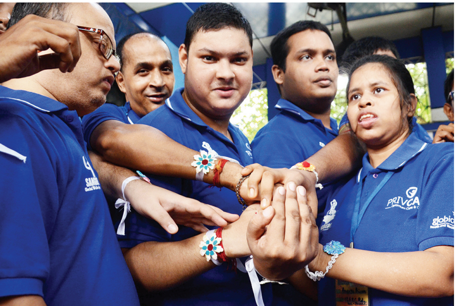
Differently abled students tie rakhi to each other on the occasion of Friendship day organised by 'Sangbedan' ahead of Rakhi Bandhan Festival in Kolkata on Sunday.

preparedness among her party's MPs. The Trinamool Congress has already taken a firm stance, warning of mass protests if any eligible voters are excluded during the revision process. In addition to electoral matters, Mamata is also likely to discuss the party's recently launched grassroots outreach initiative, 'Paray-Paray Sambal', instructing MPs on their roles and responsibilities within the program aimed at strengthening the party's local presence. Notably, this is not the only high-level meeting scheduled. Trinamool All India General Secretary and MP Abhishek Banerjee will also chair a virtual meeting on August 5, which will include all district presidents and leaders of the party's frontal organizations. The meetings are being seen as part of a coordinated strategy to mobilize the party and tighten organizational preparedness in the lead-up to the 2026 state elections.