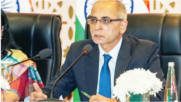
Ambassador Kwatra said in his statement that the new Indian Consular Application Centres would be in Boston, Columbus, Dallas, Detroit, Addison, Orlando, Raleigh, and San Jose.

MI News Service, New Delhi/Washington: India has opened eight new consular centres across the US, significantly expanding the delivery footprint for visa, passport and other services and streamlining them to make them more accessible and efficient for the Indian diaspora in the country.