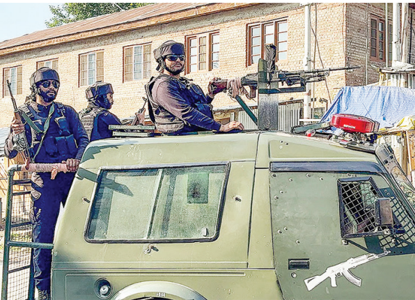
Kulgam: Security personnel keep a vigil amid an ongoing encounter between security forces and terrorists in a forest area at Akhal, in Kulgam district, Jammu and Kashmir.

MI News Service, Srinagar: The anti-terrorist operation in Kulgam district of Jammu and Kashmir entered the third day on Sunday as security forces tightened the noose around the ultras engaged in the gun battle with them. "The encounter has entered third day as intermittent exchange of firing has been going on since Sunday morning," an official said.