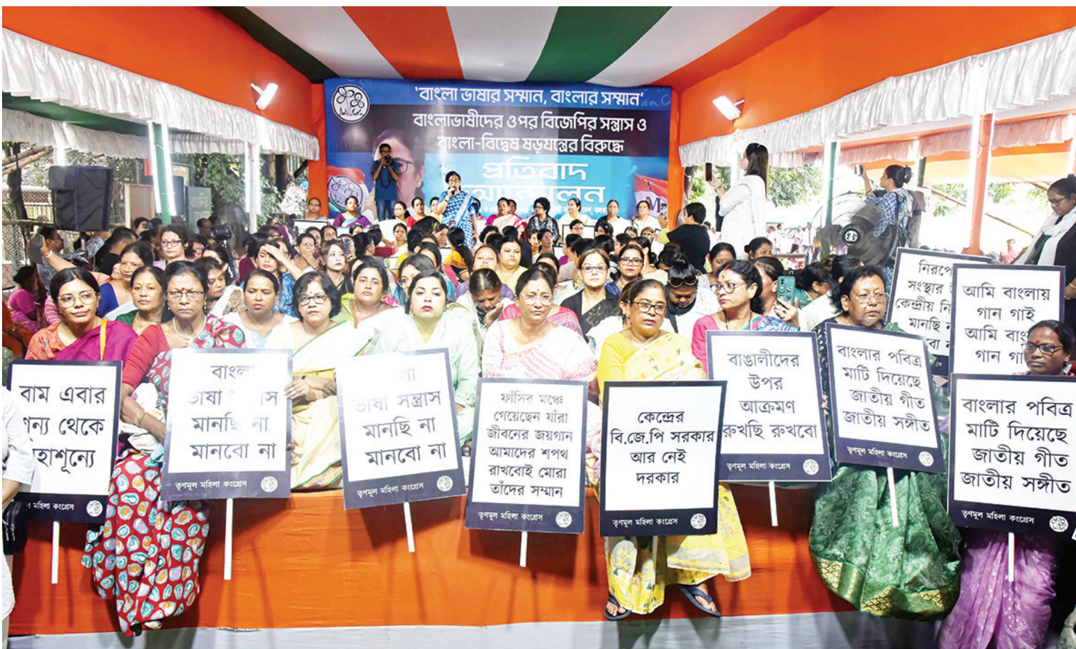
The Trinamool Mahila Congress leaders and activists held a demonstration condemning the attack and harassment faced by Bangla-speaking people in other states, in Kolkata on Sunday.