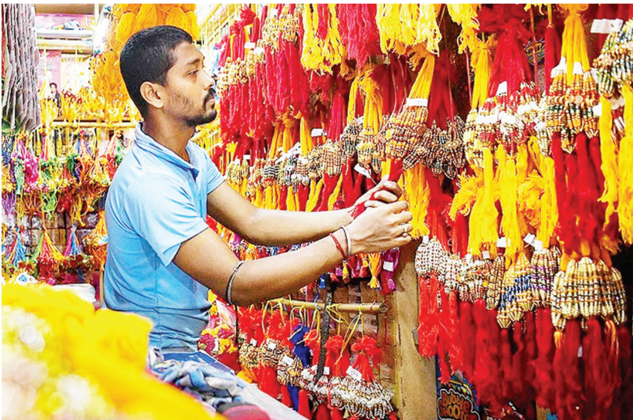
A shop owner arranges 'Rakhis' ahead of the 'Raksha Bandhan' festival, in Agartala.