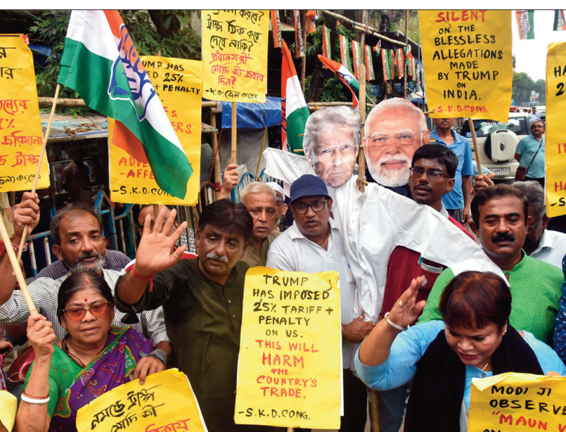
Congress activists held a protest rally against Prime Minister of India Narendra Modi and U.S. President Donald Trump at Jadubabur Bazar in Kolkata on Friday.