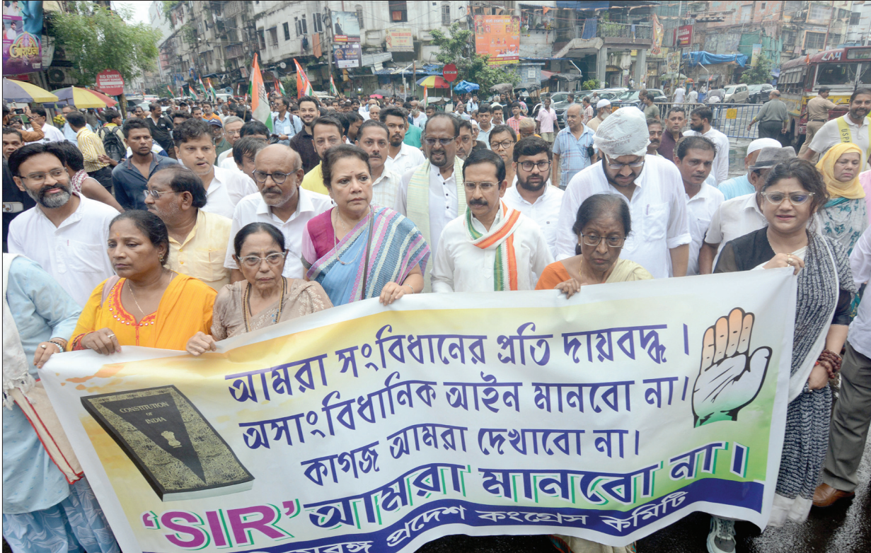
The West Bengal Pradesh Congress holds a protest rally in support of Bengali language rights and against the alleged oppression of Bengali-speaking people in BJP-ruled states. The rally started from Jorasanko Thakurbari and concluded at College Street in Kolkata.