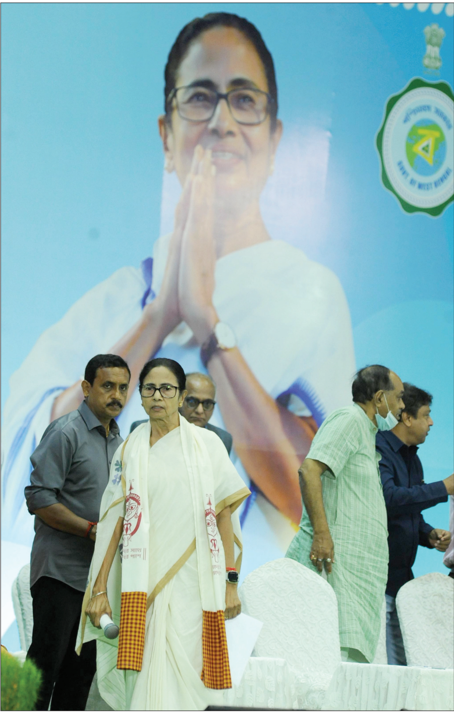
West Bengal Chief Minister Mamata Banerjee chaired a coordination meeting with the organisers of Durga Puja committees at Netaji Indoor Stadium in Kolkata on Thursday.

Banerjee during a press briefing on Thursday. This year's entrance test, held on April 27, was conducted for admissions into engineering and pharmacy programs across government and private institutions in the state. However, despite the exam being held in April, the prolonged delay in the announcement of results had left candidates frustrated, with some opting to seek admission elsewhere. The situation