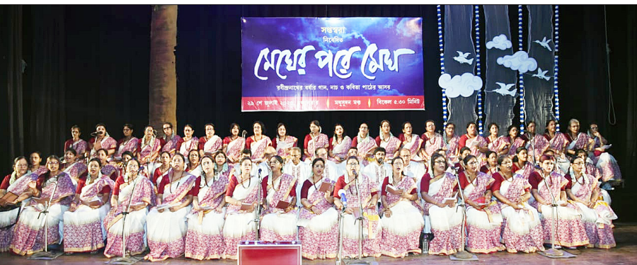
Rabindra sangheet song title "megher pore megh" performed by students of Swaptasara at Madhusudan Mancha recently.