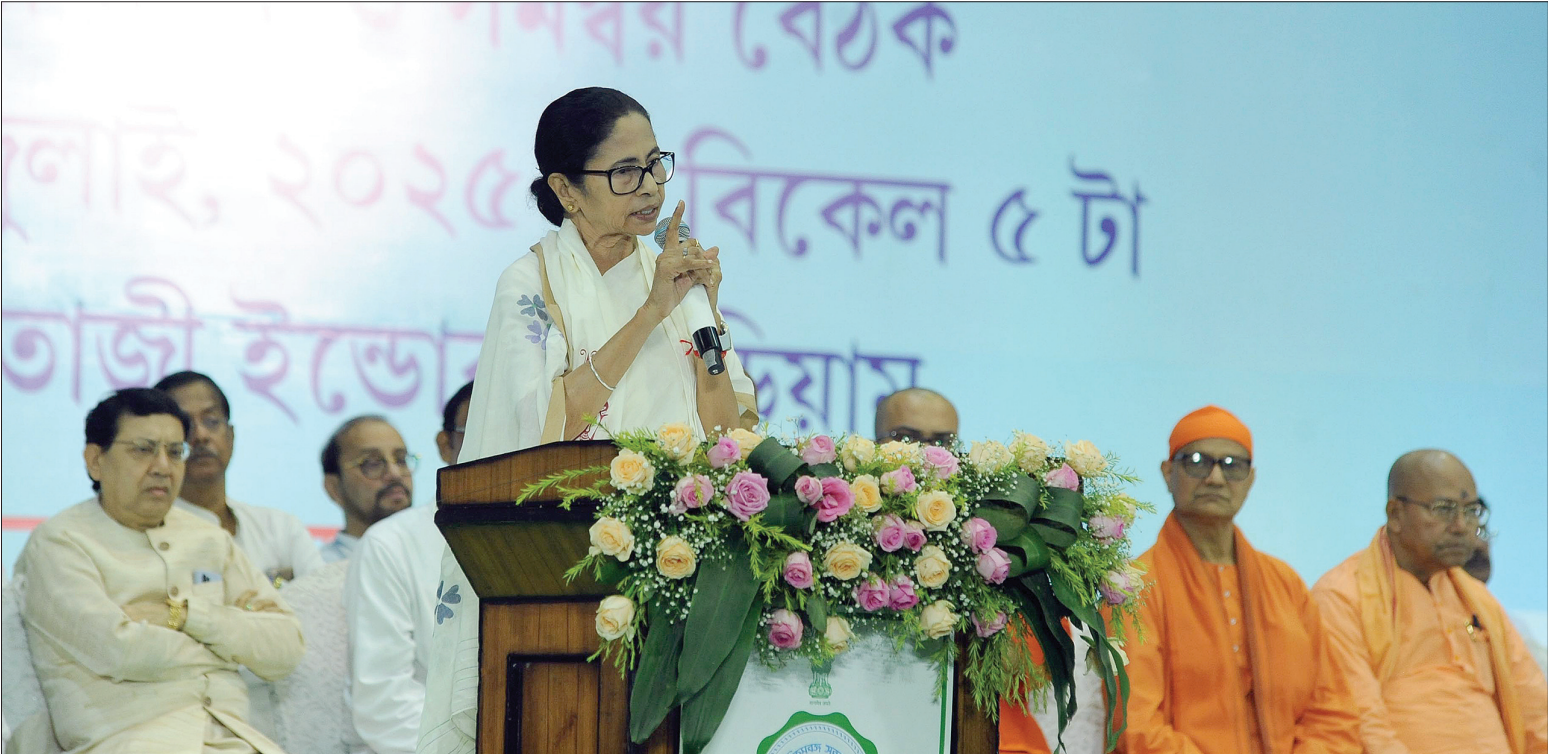
West Bengal Chief Minister Mamata Banerjee addresses a coordination meeting with the organisers of Durga Puja committees, where she announces a Rs 1.10 lakh grant to the organisers, at Netaji Indoor Stadium in Kolkata on Thursday.