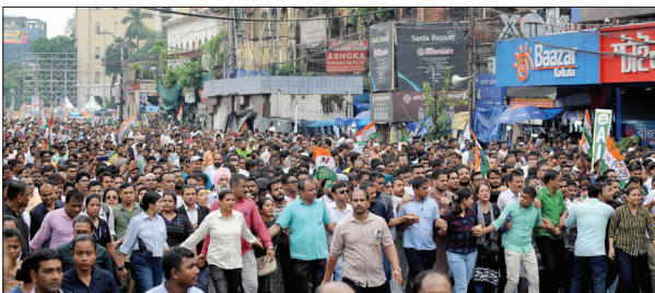
A large crowd of supporters and people participated in the protest rally against the harassment of Bengali migrants, called by West Bengal Chief Minister Mamata Banerjee in Kolkata on Wednesday.

any matter related to the Union territory of Jammu and Kashmir. "As you are aware, we have a long-standing national position that any issues pertaining to the Union territory of Jammu and Kashmir have to be addressed by India and Pakistan bilaterally. That stated policy has not changed. As you are aware, the outstanding matter is the vacation of illegally occupied Indian Territory by Pakistan," the Ministry of External Affairs stated. The MEA further stated that the "issue of trade" did not come up between Indian and the US leaders since the commencement of 'Operation Sindoor' and the cessation of hostilities.