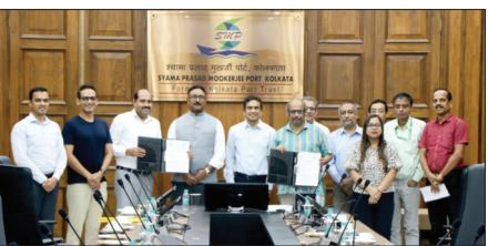
Syama Prasad Mookerjee Port, Kolkata, during the signing of the MoU between SMPK and PS Group to revamp Nimtalla Immersion Ghat under the Swachhata and Namami Gange Mission, in Kolkata on Wednesday.