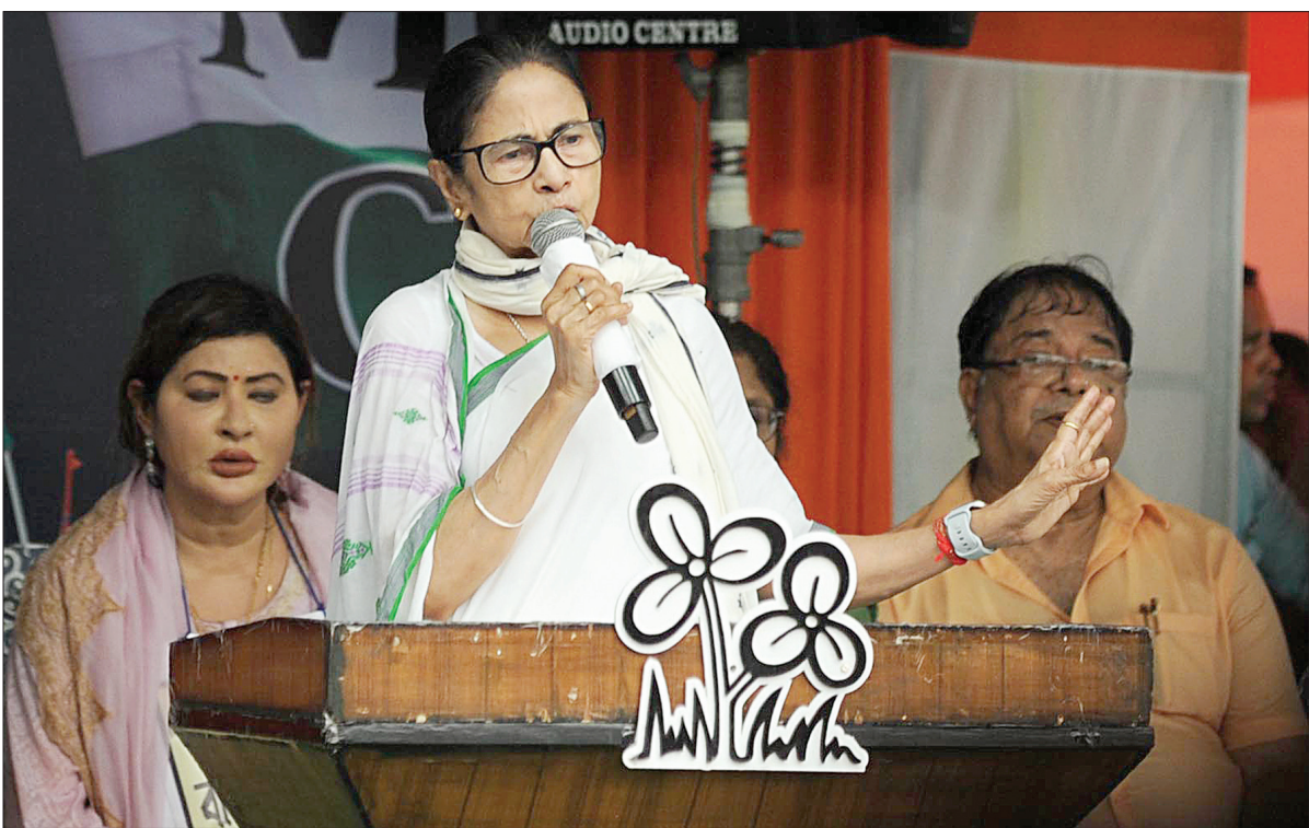
West Bengal Chief Minister Mamata Banerjee addressed a gathering after leading a protest rally, voicing strong opposition to what her party describes as "systemic harassment" of Bengali-speaking people in other states. The gathering was held in Kolkata on Wednesday.

and conducted due checks." He added that cyber police experts are ascertaining the source of the email. The compound of all the three schools were also immediately vacated in systematic manners and the parents were asked to take back their wards from the respective schools at the earliest as a preventive measure. "Security has been tightened in the school. However, fortunately nothing suspicious has been found so far," the DCP said and describe the threats as nothing but a hoax. Incidentally, in similar incidents a few months ago, another bunch of schools in New Delhi received similar bomb threats, forcing the city police to take immediate steps following which a number of suspects were arrested. All those calls were also turned out to be hoax to the relief of students, teachers and parents of those schools.