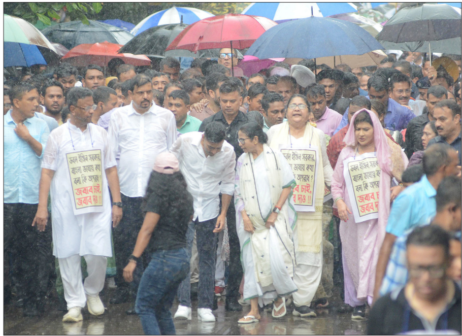
West Bengal Chief Minister Mamata Banerjee was seen in talks with TMC National General Secretary Abhishek Banerjee as the rally, condemning the harassment of Bengali-speaking migrants in other states, commenced braving the rain in Kolkata on Wednesday.

level. Prices of commonly consumed vegetables have soared over the past few weeks. Brinjal, which was earlier priced at 40 per kilogram, is now selling for 80. Cucumber, once available at 30-40, has risen to 60. Bitter melon and pointed gourd (patal) have followed the same trend. Chilli prices have escalated dramatically, reaching 100-150 per kilogram, and capsicum and shrim gourd have also seen similar spikes. With the task force now active and promising stricter oversight, there is cautious optimism among consumers that prices may stabilize. However, much will depend on weather conditions in the coming days and how effectively the authorities can control unfair pricing practices in the supply chain.