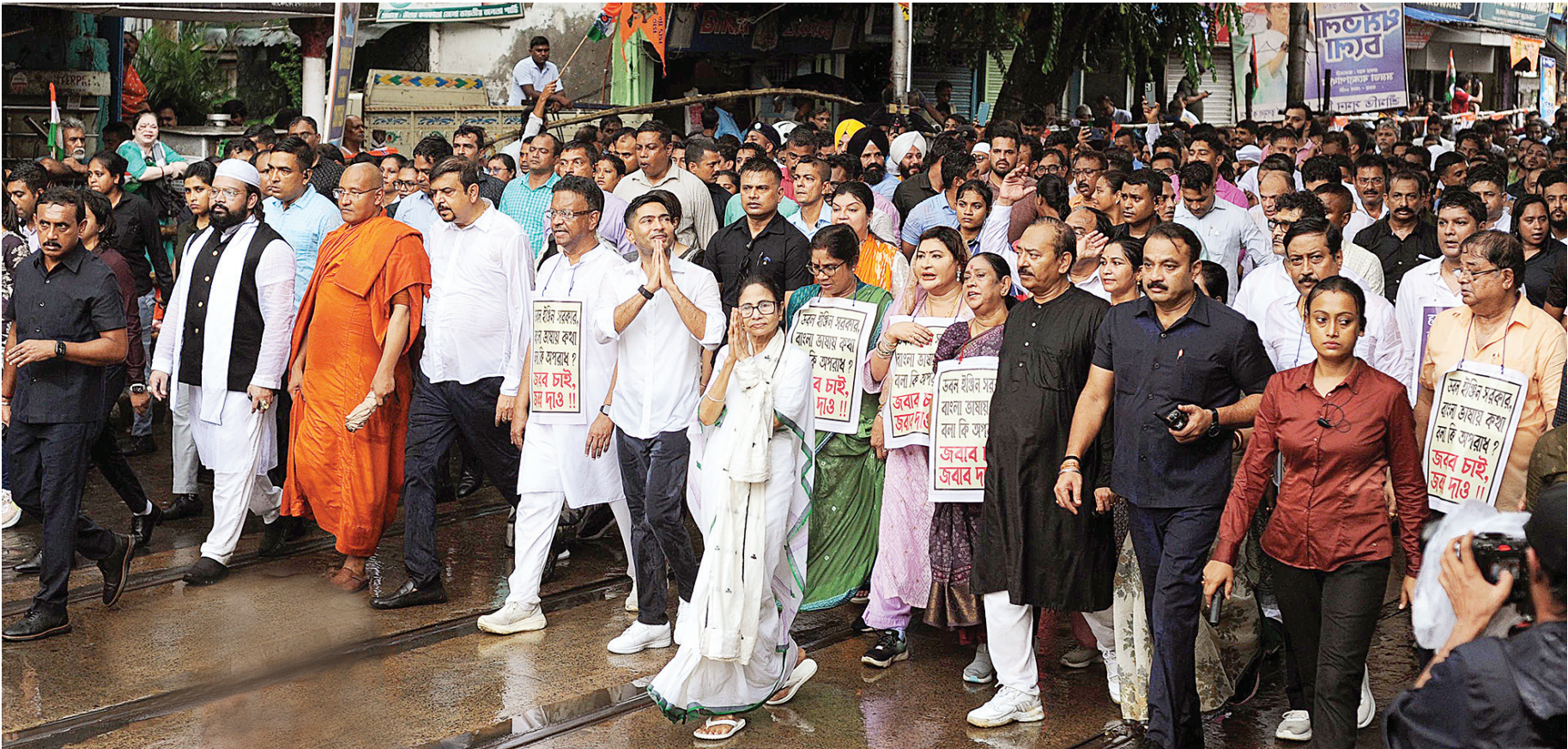
West Bengal Chief Minister Mamata Banerjee, braving the rain, spearheaded a protest rally accompanied by TMC MP Abhishek Banerjee and other senior party leaders, protesting against the harassment of Bengali-speaking migrants in various other states. The demonstration addressed issues of linguistic profiling and detentions. The rally commenced from College Square and concluded at Dorina Crossing in Kolkata on Wednesday.