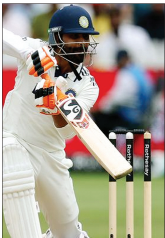
the team to 100-run mark in 32 overs. The partnership of hope between Jadeja and Nitish lasted for just 30 runs, as Woakes

with a ball in hand during the 24th over and produced another miracle. He managed to take down KL Rahul, trapping him leg-before-wicket with a massive nip-backer. Rahul wanted to block, but his bat got stuck in the pad and could not come across the line of the ball. Stokes took a review, and it proved to be a success, sending back KL for 39 in 58 balls, with six fours. India was 81/6, with Stokes having his second scalp. India continued to crumble, as Washington Sundar's stay at the crease lasted just four balls and yielded no runs. Archer's superb reflexes came in clutch as he stretched out his right hand to take a brilliant catch to get his third wicket. India was 82/7. The all-rounder pair of Ravindra Jadeja and Nitish Kumar Reddy fought hard, taking