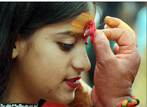
Devotees gather in large numbers at Bhutnath Temple of North Kolkata to offer prayers on the first Monday of Sawan, marking the auspicious beginning of the holy month with devotion and fervor.