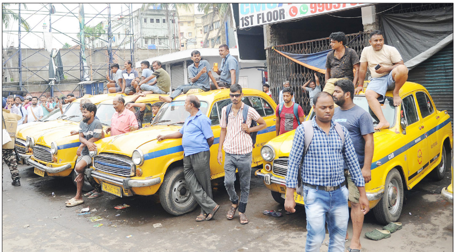
Taxi drivers and commuters near the Howrah Maidan area faced slight disruptions in their work due to the protest rally, 'Nabanna Abhijaan', organized by protesting teachers from Howrah Taxi Stand on Monday.