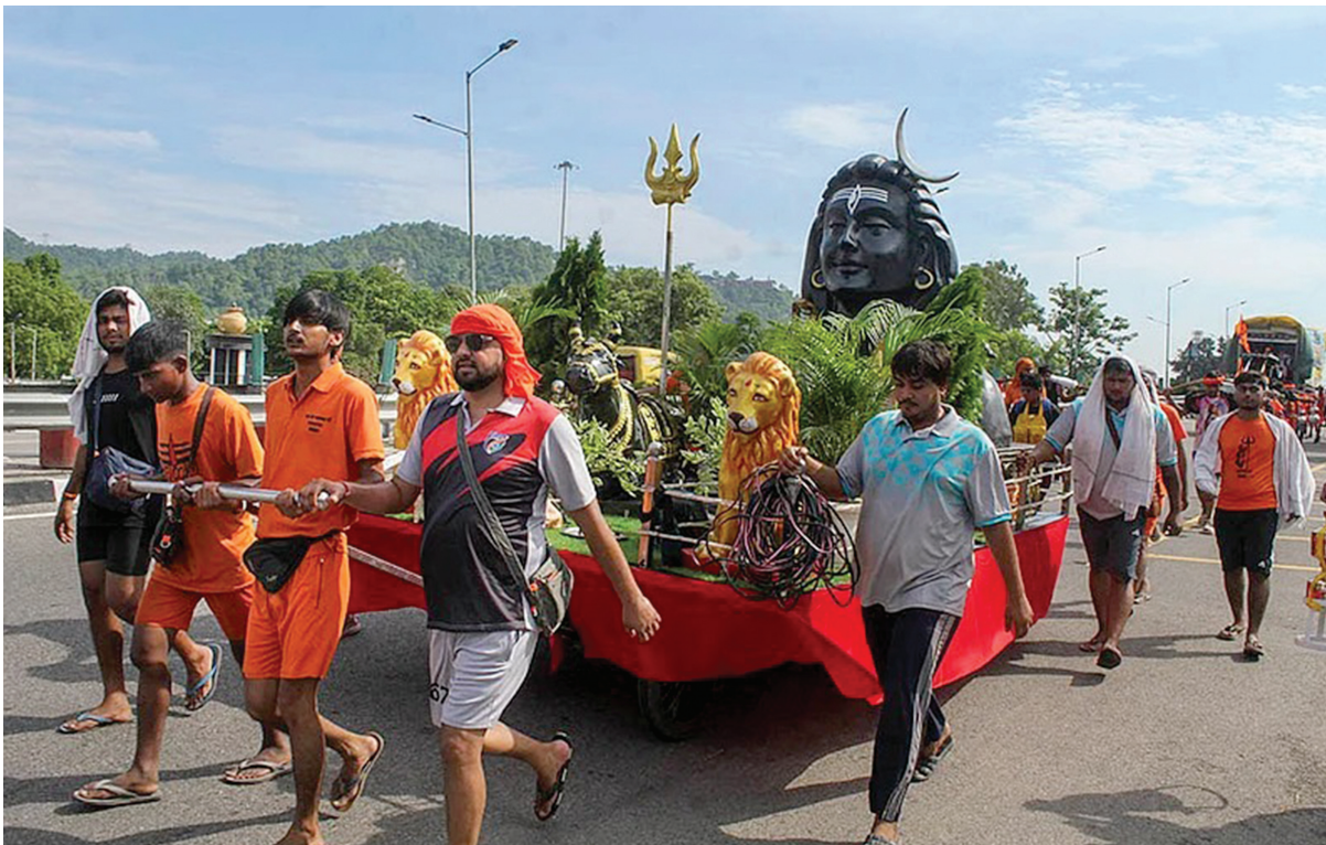
'Kanwariyas', Lord Shiva devotees, pull a 'kanwar' with an idol of Lord Shiva as they walk along the Delhi-Haridwar Expressway during the ongoing 'Kanwar Yatra', in Haridwar, Uttarakhand.