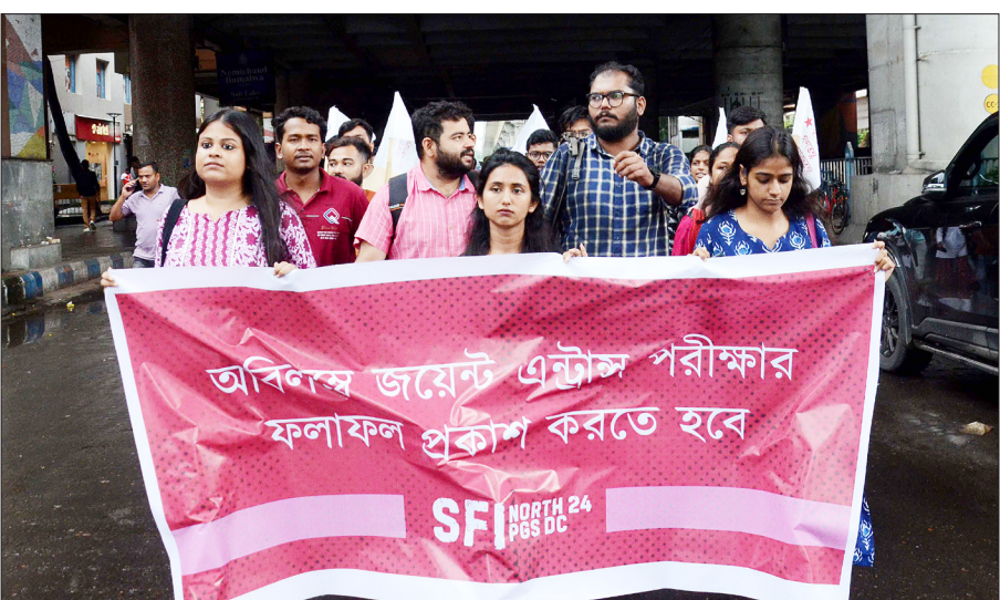
SFI activists took part in a protest rally demanding the immediate announcement of Joint Entrance results during their 'March to West Bengal Joint Entrance Examinations Board' in Kolkata on Monday.