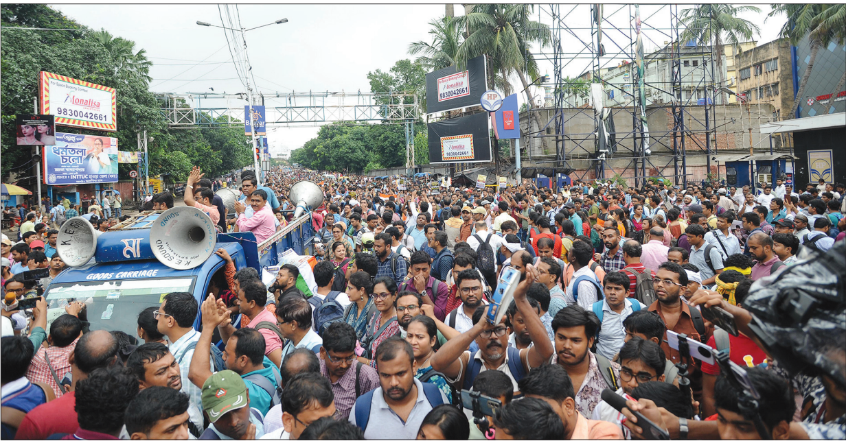
Qualified teachers, staff, and SSC 2016 panel candidates, who remain on waiting lists or were not called for verification, along with hunger strikers, hold a protest rally demanding the immediate release of OMR mirror images, cancellation of illegal appointment notices, an emergency Assembly session, and termination of tainted teachers as per the Supreme Court's April 3rd order, etc. The rally commenced from Howrah Taxi Stand to the State Secretariat, on Monday.