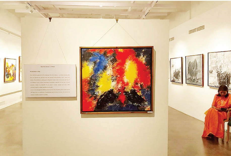
Paintings on display during an art exhibition at a gallery at Triveni Kala Sangam, in New Delhi. The exhibition has been dedicated to India's Operation Sindoor.

integrating with major markets also... we just concluded an agreement with the UK, we are in an advanced stage of negotiations with the European Union, we are trying to negotiate and finalize a deal with the USA," he said here at an event on export logistics. India, he said, is also negotiating trade pacts with Latin American countries including Chile and Peru. "We have done (trade pact) with Australia and UAE. We are in negotiations with New Zealand... So, the idea is that we are also integrating in a big way with the major trading partners and major economies," he added.