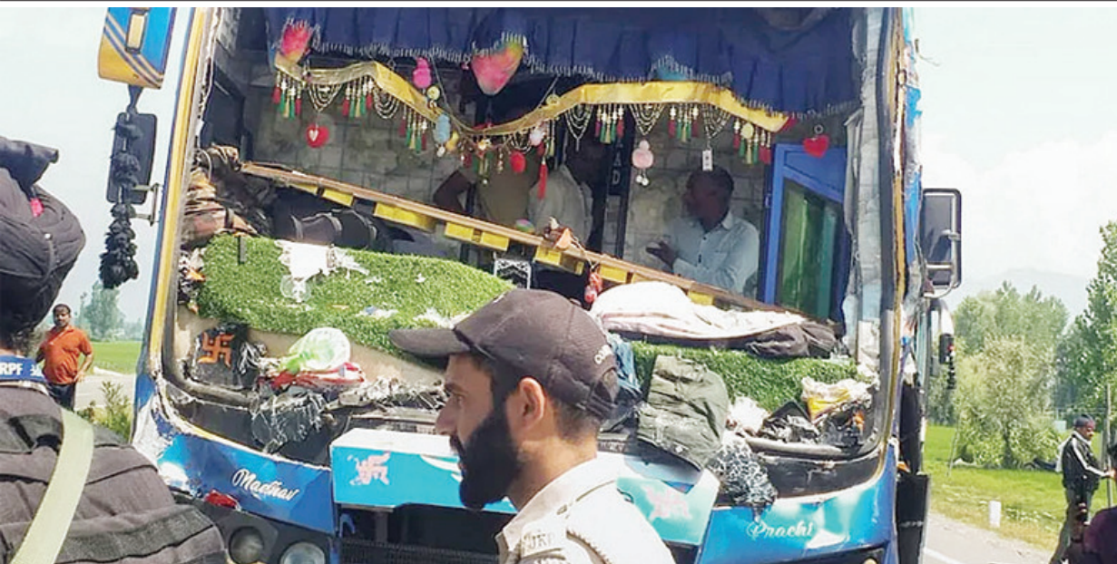
Security personnel stand near a damaged bus after a multi-vehicle collision at Khudwani, in Kulgam district, Jammu and Kashmir. Many pilgrims going for the annual 'Amarnath Yatra' were injured.

• Data privacy at the core: The purpose of fitting cameras in the common movement areas of coaches is to improve safety and security of passengers. While preserving privacy, these cameras will help in identifying miscreants. The modernization efforts of Indian Railways are a reflection of its commitment towards a safe, secure, and passenger-friendly travel experience.