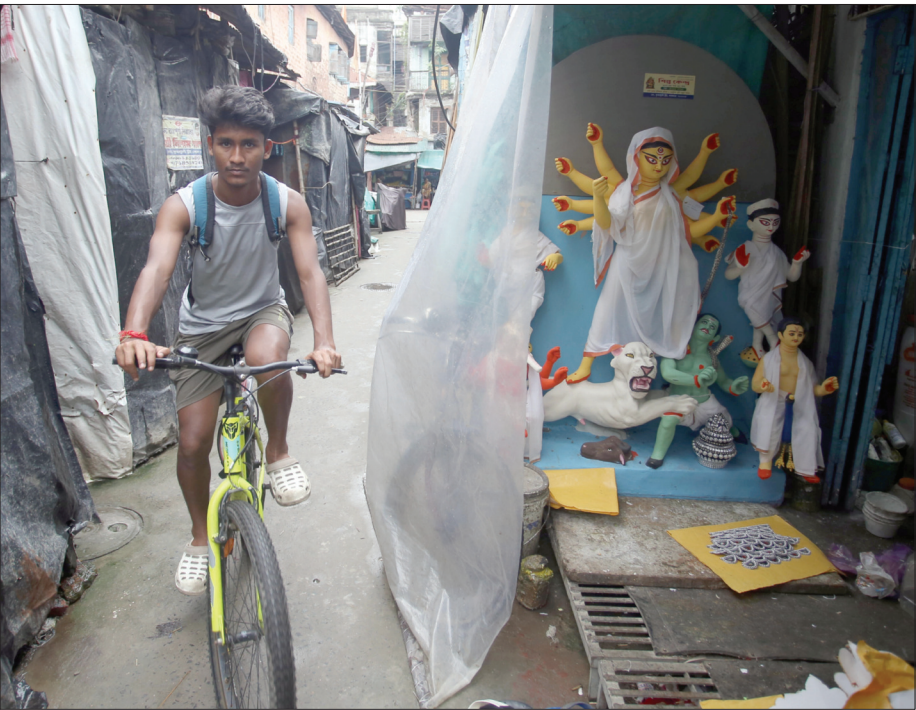
A young man enjoys a bicycle ride through the narrow lane of iconic Kumartuli area in Kolkata on Sunday where glimpses of pre-Pujo preparation can be seen.

The villagers have warned that they may boycott next year's Assembly election if the road is not repaired immediately. Islam said: "Several meetings have been held, but no resolution has been reached yet because of disputes and land encroachments."