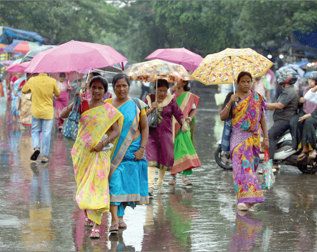
Commuters brave the rain with umbrellas and raincoats as monsoon showers drench the city streets in Kolkata on Sunday.