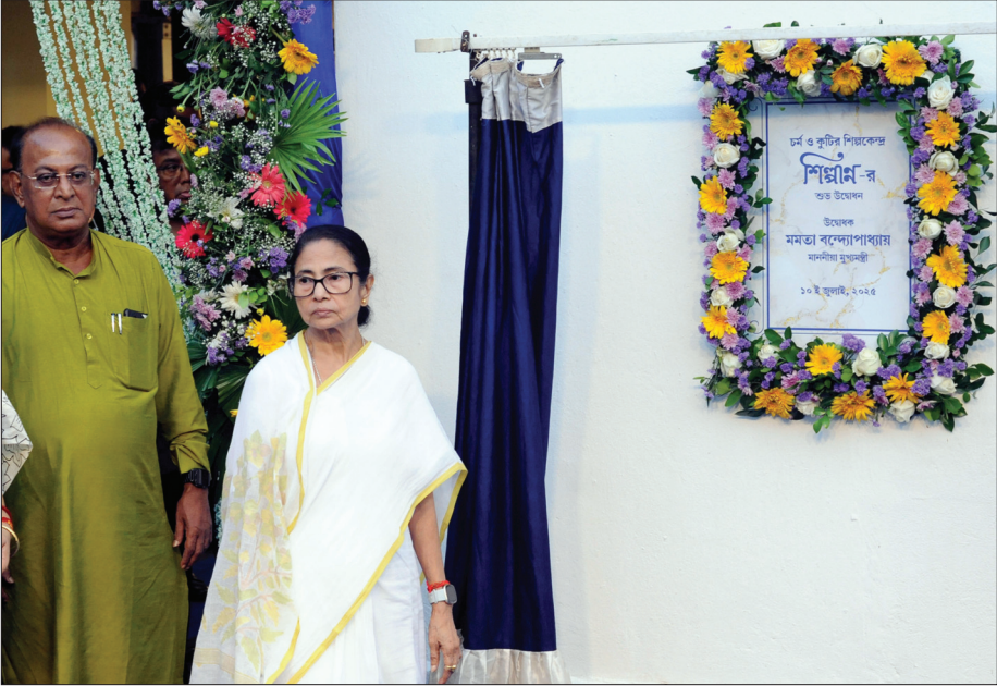
West Bengal Chief Minister Mamata Banerjee inaugurated Shilpanna, the Leather and Textile Hub, at Alipore in Kolkata on Thursday.