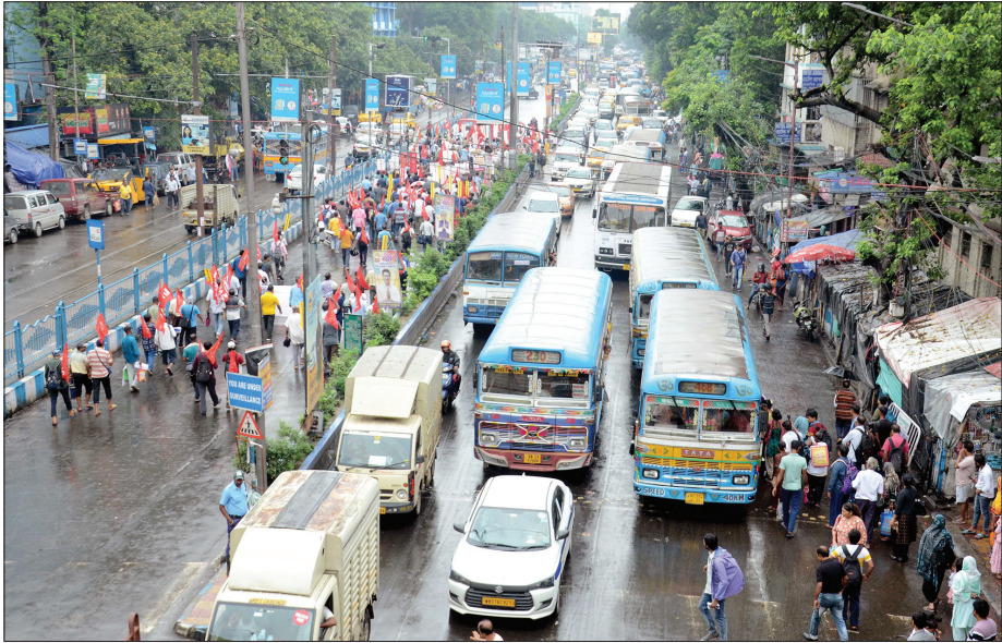
Leftist and Congress activists took part in a rally during a nationwide general strike called by trade unions, protesting what they describe as the government's anti-worker policies, in Kolkata on Wednesday.

Leaders of the Mahagathbandhan including Leader of the Opposition in the Lok Sabha and former deputy CM Tejashwi Yadav on Wednesday led the Opposition’s “chakka jam” across the state to protest against the ongoing special intensive revision of electoral rolls in the poll-bound state.