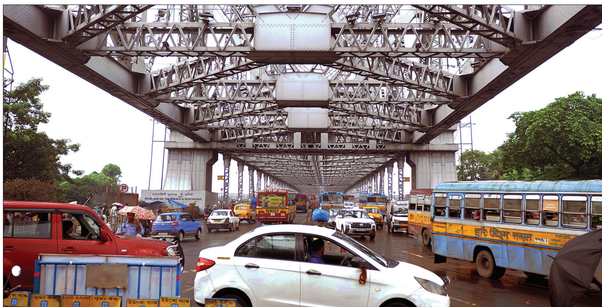
Daily life in Kolkata remained almost normal during the All-India General Strike called by Leftist trade unions on Wednesday.