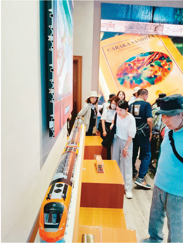
Vande Bharat Express trains, known for their speed and passenger comfort; and many more latest advancements in electric locomotives underscore

Held at Yumeshima, an artificial island on Osaka's waterfront, the World Expo 2025 opened its doors on April 13 and will continue till October 13, welcoming millions of visitors from across the globe. Amid the vibrant international exhibits, the Indian Pavilion, particularly the section dedicated to Indian Railways, has become a focal point of admiration. In the showcase, the magnificent Chenab Bridge, the world's highest Railway bridge soaring across the Chenab River in Jammu and Kashmir; the iconic Anji Khad Bridge, India's first cable-stayed rail bridge in the challenging Himalayan terrain; the state-of-the-art