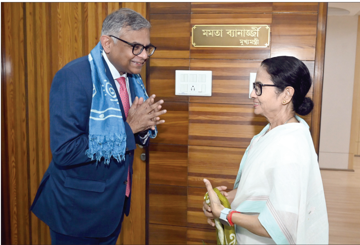
West Bengal Chief Minister Mamata Banerjee met Tata Sons and Tata Group Chairman N. Chandrasekaran. According to sources, their conversation focused on deepening the Tata Group's presence in the state, highlighting Bengal's emergence as a preferred destination for forward-looking industry leaders. The meeting was held at the state secretariat, Nabanna, on Wednesday.