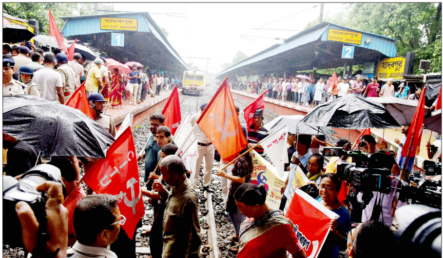
Leftist and Congress activists take part in a rally, during a nationwide general strike called by the trade unions against what they describe as the government's anti-worker policies in Kolkata on Wednesday.

workers is on the rise.” She warned of legal action if the workers were not released immediately. “Don't assume these workers are alone. If they are not freed at once, we will move court,” she said, urging the Chief Minister of Odisha, the Chief Secretary, and the Director General of Police to intervene. The Krishnanagar District Superintendent of Police has reportedly already spoken to officials in Odisha regarding the issue, Ms. Moitra confirmed. This incident follows recent reports of Bengali-speaking labourers being allegedly harassed and mistaken for Bangladeshis in Odisha. In some cases, intervention by West Bengal Chief Minister Mamata Banerjee helped bring back the detained workers. A case is also pending in the Calcutta High Court in connection with such alleged discrimination.