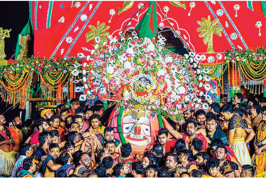
Jagannath temple servitors perform 'Goti Pahandi' ritual of Lord Balabhadra, the return procession of the deities, as part of the 'Niladri Bije' ceremony, in Puri.

Independent MLA and Rajior Dal leader Akhil Gogoi visited the site to meet the evicted families and was briefly detained by police. Gogoi termed the eviction "illegal and unconstitutional," pointing out that the case is still pending in the Gauhati High Court. He pledged to urge Chief Minister Himanta Biswa Sarma to allot 165 acres for the rehabilitation of the displaced. Chief Minister Sarma, who had earlier visited the area, confirmed that the land was earmarked for the power plant and announced another eviction drive in Goalpara's Paikar forest area on July 10.