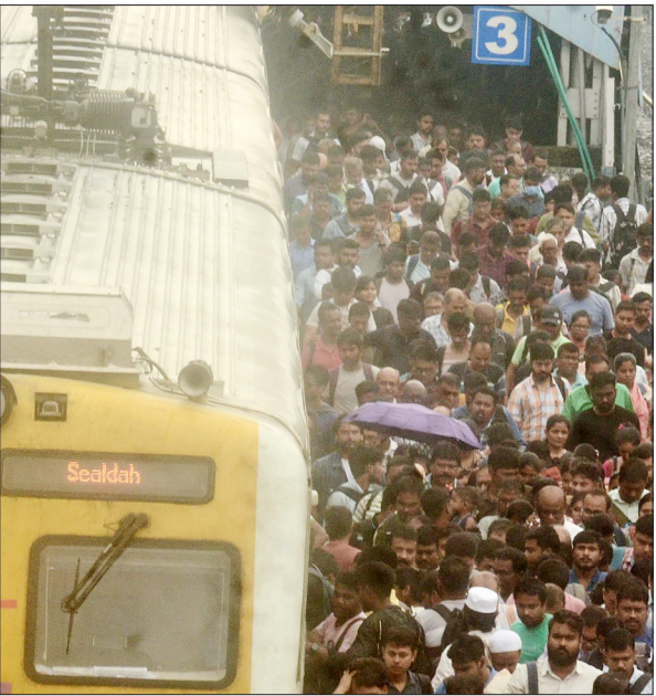
Daily life remained unaffected as vehicles plied the roads, students were seen attending schools, and people were spotted loading trucks with goods during the nationwide strike called by trade unions, in Kolkata on Wednesday.