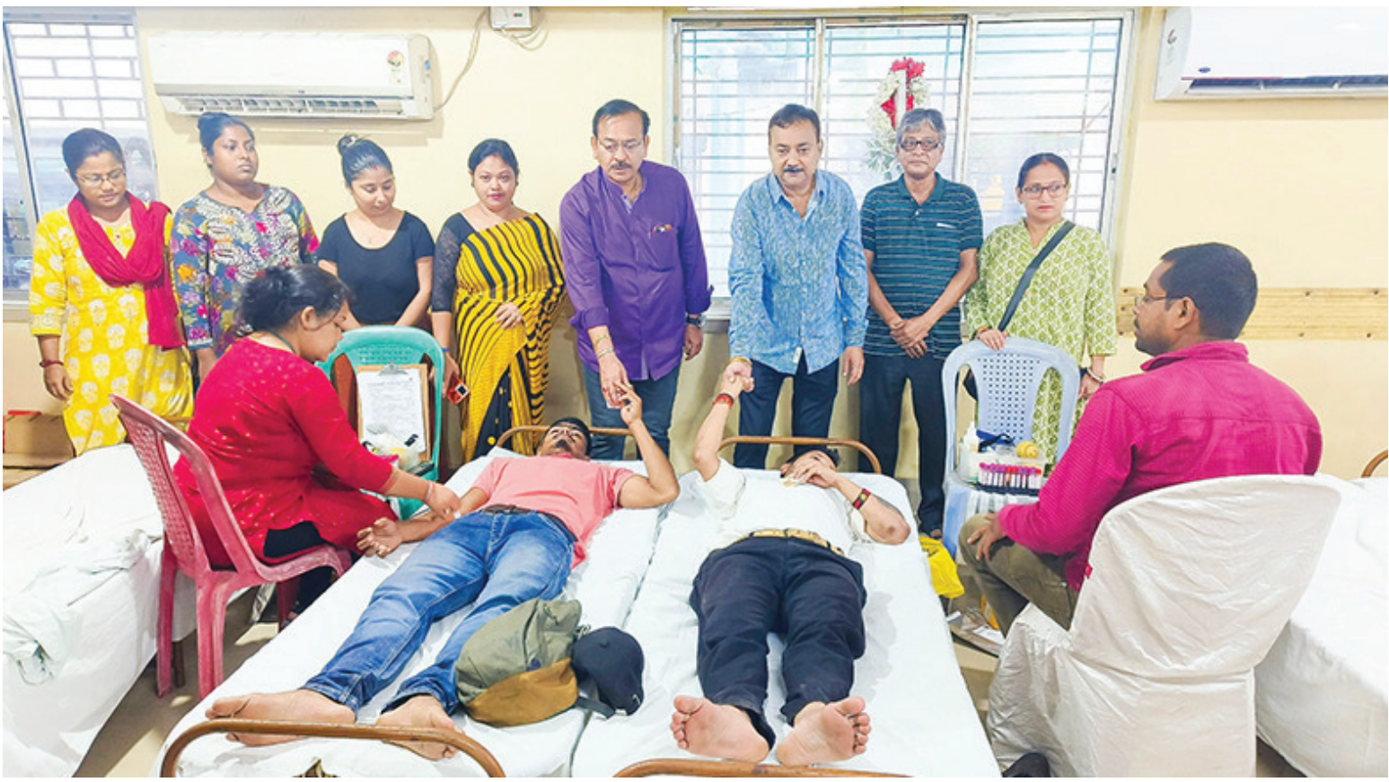
On Sunday, a blood donation camp was organized by the Naktala Udayan Sangha area with the aim of donating blood to 6 local thalassemia affected children throughout the year. A total of 175 people donated blood in this camp. The blood donation camp was inaugurated by Minister Aroop Biswas. Local municipal representative Prosenjit Das was also present at the occasion.