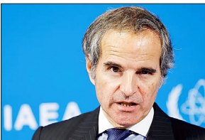
IAEA Director-General Rafael Grossi says while key Iranian facilities have been hit, some are 'still standing'

He raised concerns over Iran's stockpile of 60 percent enriched uranium, just below weapons grade, which could theoretically produce more than nine nuclear bombs if refined further.