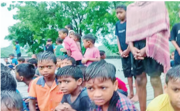
The students were rescued on Sunday morning.

MI News Service, Ranchi: At least 162 students trapped in an inundated private residential school in Jharkhand’s East Singhbhum district after heavy rain were rescued by the police on Sunday, a senior officer said. The students were trapped in the school located at Pandarsoli on the Haldipokhar-Kowali Road in Kowali police station area since Saturday night after the premises got flooded due to heavy rain. “We received information that 162 students of Lav Kush Residential School were trapped as the school premises were inundated due to heavy rain. As the school building was submerged, the teachers shifted all the students to the rooftop, where they spent the night.