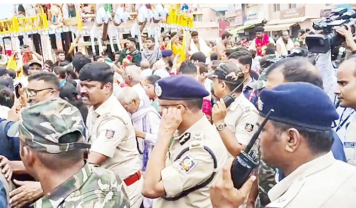
Police officials visit the site after a stampede near Shree Gundicha Temple in Puri, Odisha. At least three people were killed and 50 others suffered injuries in the incident.

“Due to intense eagerness among devotees to have a glimpse of Mahaprabhu... an unfortunate incident occurred because of the resulting jostling and chaos. I and my government seek forgiveness from all Jagannath devotees. We express our condolences to the families of devotees who lost their lives... pray to Mahaprabhu Jagannath to grant them the strength to bear this profound sorrow,” Majhi said. He also said that security lapses be-