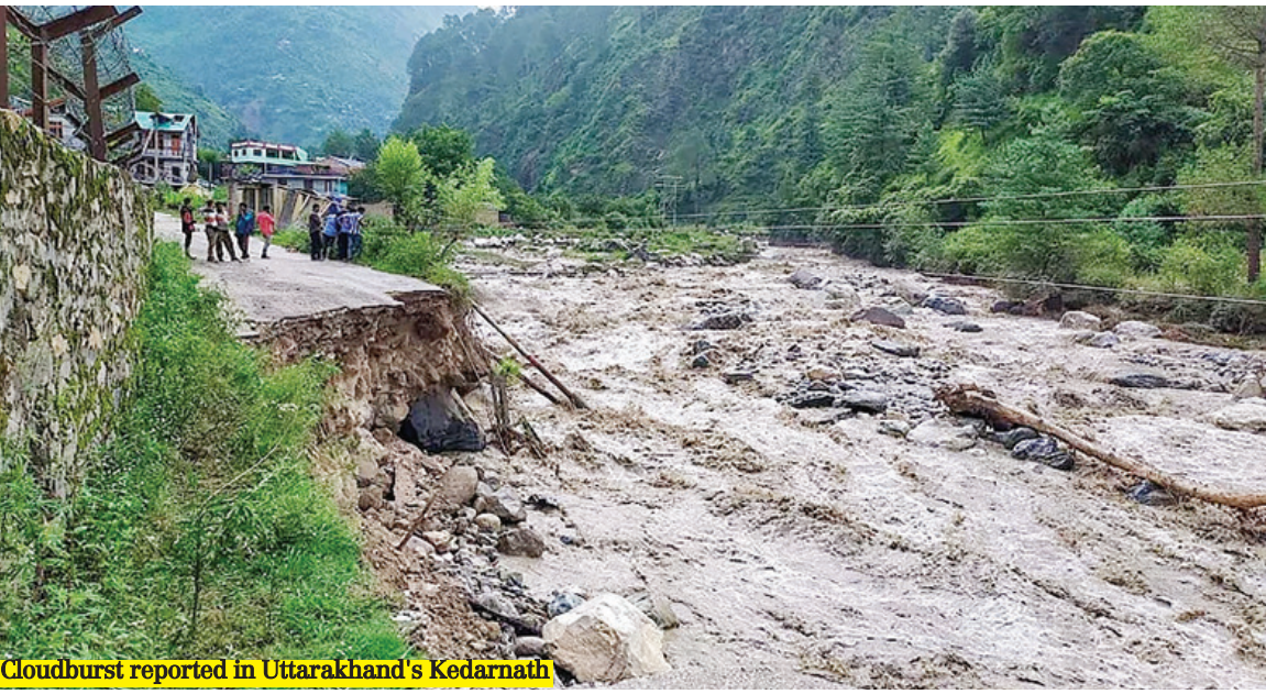
Cloudburst reported in Uttarakhand’s Kedarnath