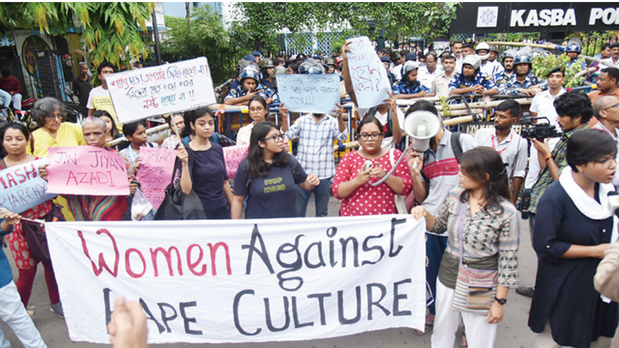
Members of Rat Dakhil Aikya Mancha took part in a protest against rape culture in front of Kasba Police Station and demanding justice for the alleged rape of a female student inside Kasba Law College hostel, in Kolkata on Sunday .