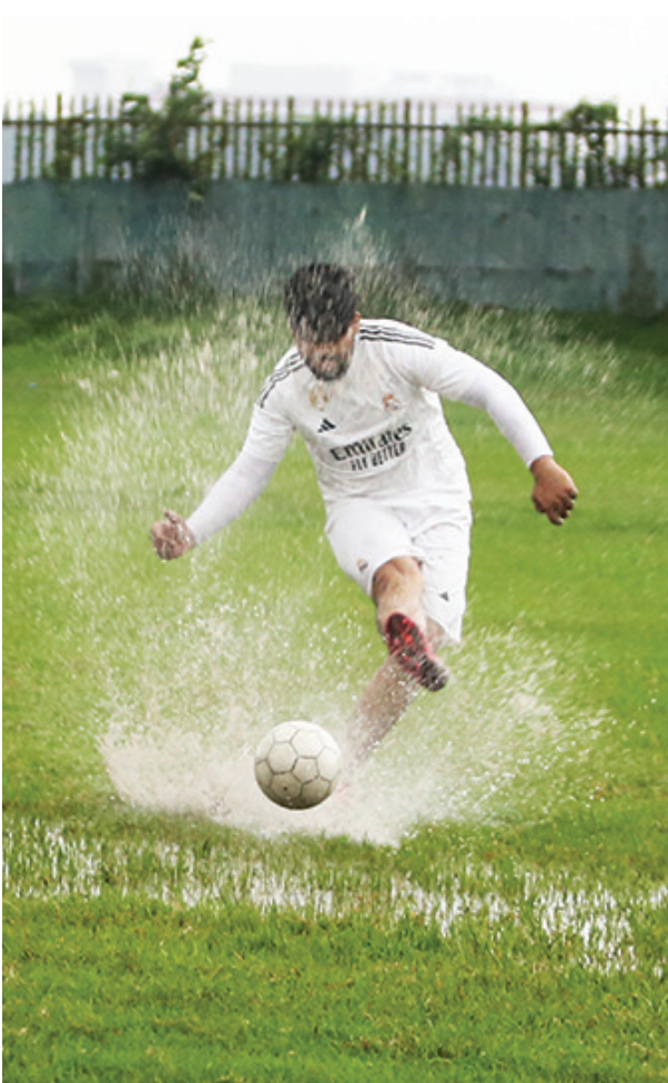
Rain or shine, the game goes on — monsoon football magic in full swing at maidan on Sunday in Kolkata..

Devotees have been asked to follow the guidelines issued by the administration and not leave for their destinations till the weather becomes normal, the Garhwal commissioner said. There is also information of heavy rain damaging agricultural land in Kuthnaur village in Uttarkashi district. The road near Ojri has also been completely damaged. The agricultural fields are filled with debris. The Kupda Kunalshala Trikhili motor bridge in Syanachatti is also in danger and the water level of the Yamuna has also risen following heavy rain.