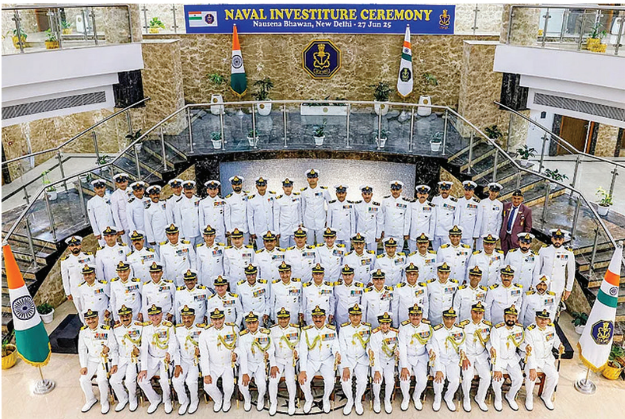
Chief of the Naval Staff Admiral Dinesh K. Tripathi poses for a group photograph with Gallantry and Distinguished Service Awards recipients during the Naval Investiture Ceremony, at Nausena Bhawan, in New Delhi.

MI News Service, Patna: Bihar Deputy Chief Minister Samrat Chaudhary has slammed RJD supremo Lalu Prasad Yadav, saying that he and his party were in power for 15 years in the state but did little for its progress. In an interview with ANI, Samrat Chaudhary, a senior BJP leader in Bihar, took a dig at Lalu Prasad "social justice" model, saying it means "become a king, bring queen (to power) and then prince and princess" and alleged that the former Chief Minister has "no model for progress of Bihar". Noting that Lalu Prasad Yadav ruled the state for 15 years - seven years as Chief Minister, and his wife Rabri Devi being the CM for the next eight years - Samrat Chaudhary said the Rashtriya Janata Dal leader failed to capitalise on the huge opportunity "Lalu ji got a big opportunity. He was the Chief Minister of Bihar and then there was puppet Chief Minister for 8 years. Even after that, he didn't do anything for Bihar," Chaudhary said. Janata Dal-United Nitish