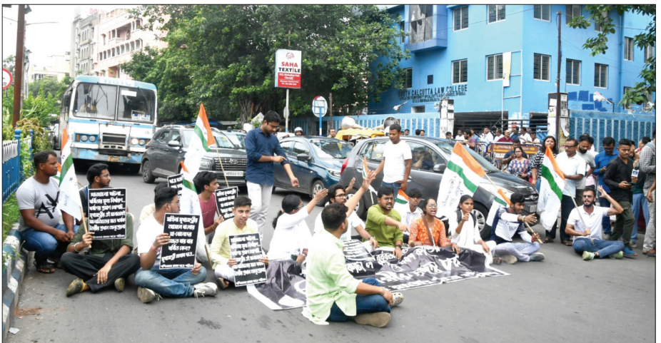
Congress Chhatra Parishad blocks road outside South Calcutta Law College demanding justice over rape incident — voices raised, tricolours held high, and outrage echoed on the streets, in Kolkata.