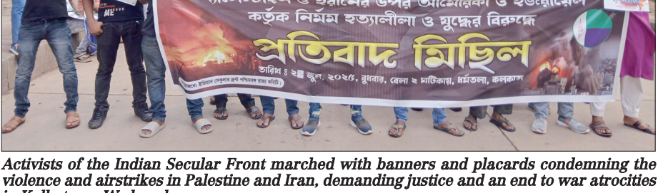
violence and airstrikes in Palestine and Iran, demanding justice and an end to war atrocities in Kolkata on Wednesday.