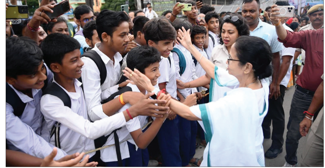
West Bengal Chief Minister Mamata Banerjee greets school children with warmth and smiles during her Digha visit on