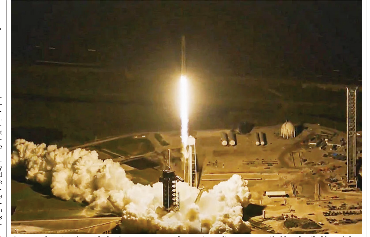
SpaceX Falcon 9 rocket with the Crew Dragon capsule carrying Indian astronaut Shubhanshu Shukla and three others lifts off from the launch pad at the Kennedy Space Centre, in Florida, USA.

The Railway Protection Force (RPF) plays a vital role in preventing the transport of illegal drugs through the Indian Railways. With its wide network and large volume of daily passengers and cargo, the railway system is often targeted by traffickers to move narcotics discreetly. To counter this, the RPF con-