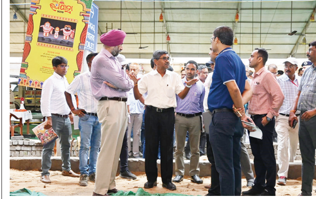
365+ Special Trains, 24x7 Control Rooms, and Tech-Enabled Crowd Management in Place

• Real-Time Monitoring, Train on Demand for holistic crowd management.