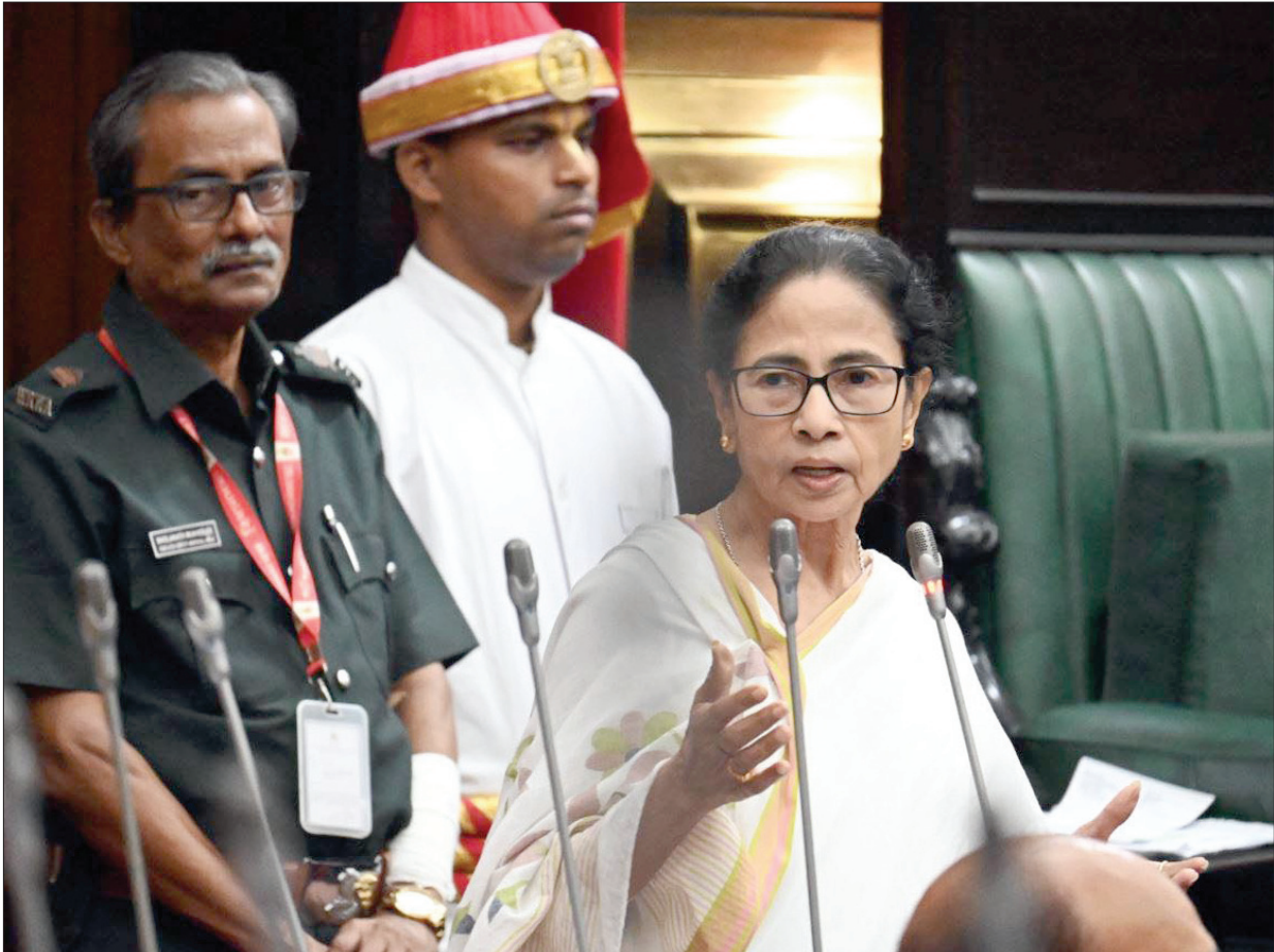
West Bengal Chief Minister Mamata Banerjee addresses the Monsoon session at the State Legislative Assembly in Kolkata on Tuesday.

On the other hand the present conflict with Israel and now also wirh the US has certainly elevated Tehran's status to a leadership role for the Muslim world as it forced both the mighty nations on their knees. "I salute their courage and determination in this crisis, she said and reiterated her strong belief that Iran did not want to produce nuclear weapons, neither they have nuclear armament in their limited armoury.The only weapon they had is the belief and the desire for martyrdom', Mufti said.