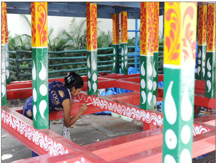
Chariot decoration with alpana underway ahead of the Rath Yatra festival, scheduled for June 27 in Kolkata.