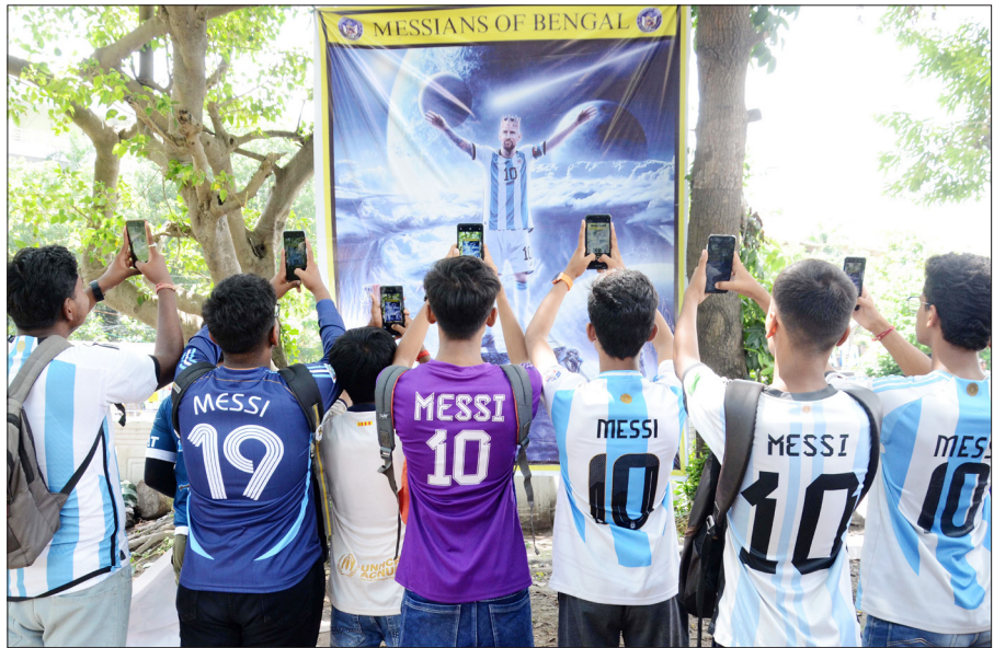
Fanatic Messi fans celebrate Messi's birthday in Kolkata on Tuesday.