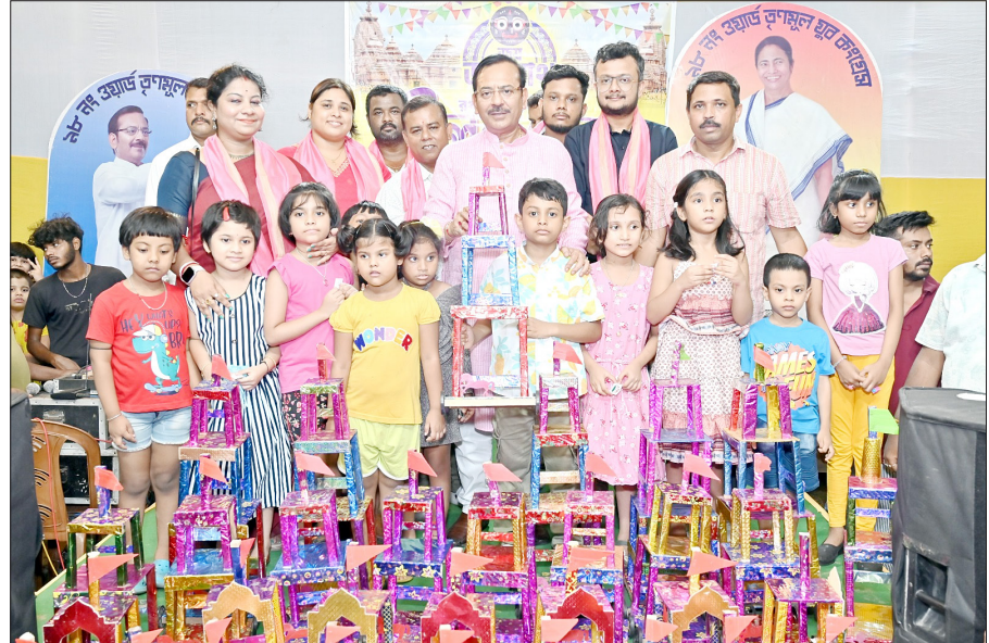
Minister Aroop Biswas inaugurated the distribution of 501 chariots in a chariot fair among the small children of the region, initiated by Ward No. 98 Trinamool Youth Congress in Netaji Nagar on Tuesday in South Kolkata.

Pradhan Paschim Gopinathpur Gram Panchayat