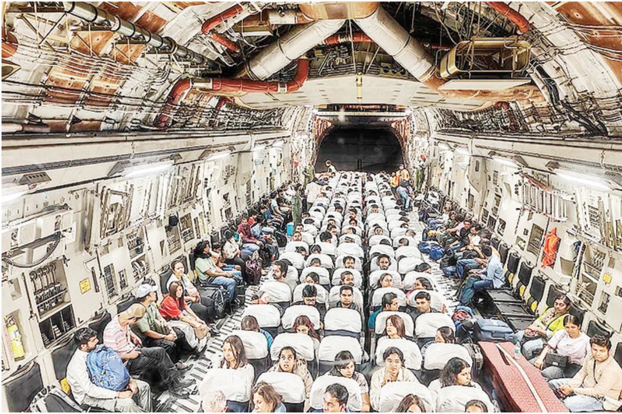
Indian nationals board an Indian Air Force (IAF) C-17 aircraft to return to India during evacuation operations, amid heightened tensions in conflict-affected areas of West Asia. The IAF has launched missions from Jordan and Egypt to extricate Indian citizens and those of friendly nations.

The conflict between Israel and Iran began on June 13 when the former launched a massive airstrike on Iranian military and nuclear sites, code-named "Operation Rising Lion". In retaliation, Iran's Islamic Revolutionary Guard Corps (IRGC) initiated a large-scale drone and missile campaign called 'Operation True Promise 3', targeting Israeli fighter jet fuel production facilities and energy supply centres. Tensions escalated further after the US conducted precision airstrikes early Sunday morning on three key Iranian nuclear facilities under "Operation Midnight Hammer". Iran retaliated by launching multiple missiles at US military installations in Qatar and Iraq, including the Al Udeid Air Base in Qatar, the largest US military base in the region, CNN reported.