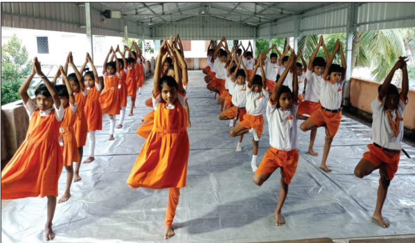
International Yoga Day Celebrated at Manmathpur Pranab Mandir.

healthy human body, students, teachers, and devotees from Pranabananda Vidyamandir in Manmathpur and Kanmari actively participated in this noble practice of yoga. In the morning, all participants gathered in the temple courtyard and performed yoga in a disciplined and organized manner. The entire session was conducted following the official protocol laid down by the Government of India.