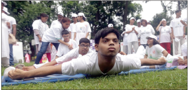
Special children from Manovikas Kendra perform yoga on International Day of Yoga, in Kolkata on Saturday.

This incident has reignited debate about aging university infrastructure and the urgent need for renovation and structural audits. Parents, students, and faculty alike are now demanding comprehensive safety checks across all hostels to prevent any recurrence of such a near-disaster.