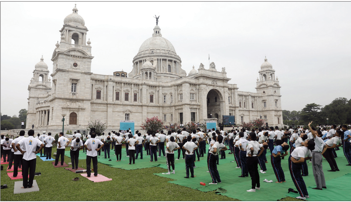
People take part in a yoga session at the Victoria Memorial on International Day of Yoga, in Kolkata on Saturday.

MI News Service, Mumbai : In a major disciplinary action, aviation safety watchdog DGCA has ordered Tata Group-owned Air India to remove its three senior officials, including a divisional vice president, from all roles and responsibilities related to crew scheduling and rostering over serious lapses. In its order, dated June 20, the Directorate General of Civil Aviation (DGCA) also directed the airline to initiate proceedings against these three officials without delay. Air India in a statement has also said that it has acknowledged the regulator's directive and implemented the order. " However, in the interim period, the company's Chief Operations Officer will provide direct oversight to the Integrated Operations Control Centre (IOCC). Air India is committed to ensuring that there is total adherence to safety protocols and standard practices," the airline said in its statement on Saturday.