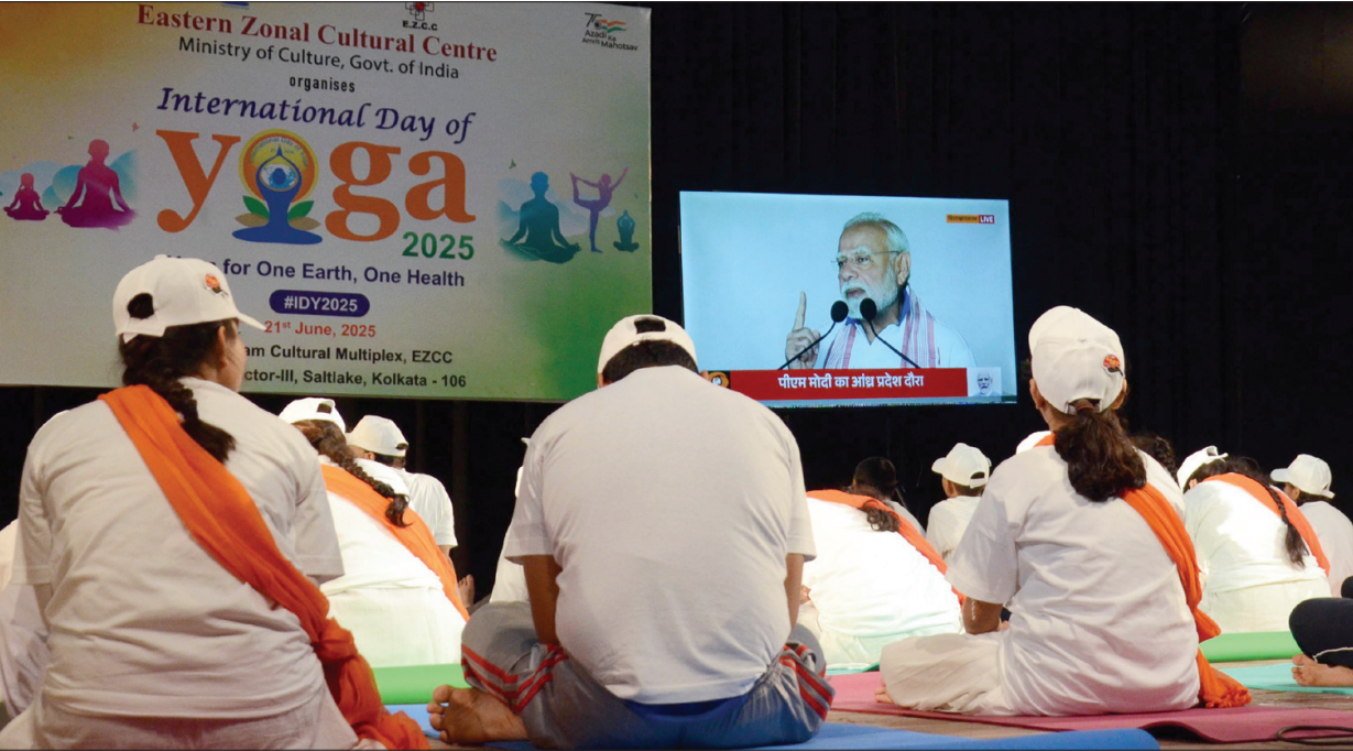
School students and specially abled children take part in a yoga session at the EZCC (Eastern Zonal Cultural Center) on International Day of Yoga, in Kolkata on Saturday.