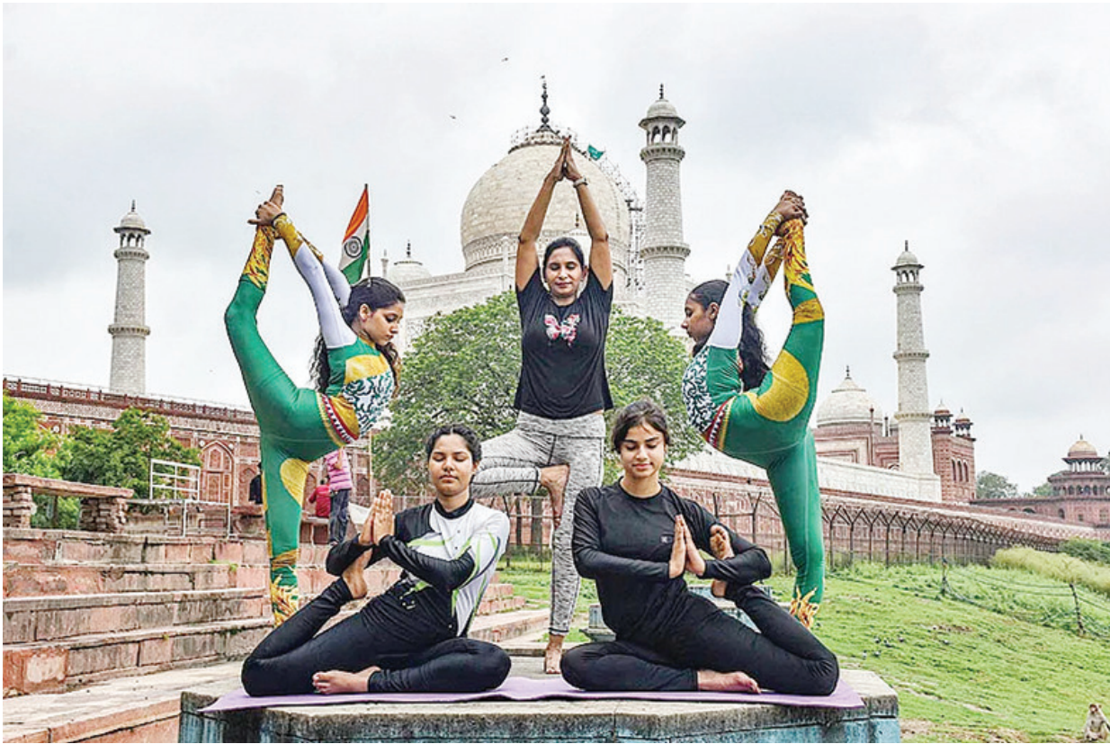
Women perform yoga at Dussehra Ghat behind the Taj Mahal, ahead of the 'International Day of Yoga', in Agra, Uttar Pradesh.

compromised on this principle, which is mandated by law and upheld by the Supreme Court." Citing a key Supreme Court ruling, ECI sources noted that the protection of a voter's secrecy — including the right not to vote — is critical in a functioning democracy. Any violation of this secrecy could result in a jail term of up to three months. Regarding CCTV footage retention, the ECI clarified that the footage, which is primarily used as an internal management tool, is retained for 45 days following polling. "The 45-day period aligns with the legal time-frame for filing an Election Petition. There is no statutory requirement to preserve it beyond that unless a petition is filed," an official source stated. Addressing Rahul Gandhi's objection over the footage not being retained for a year, the ECI clarified that if no petition is lodged within the stipulated period, retaining the footage serves no legal purpose and risks misuse for spreading disinformation. However, if an Election Petition is filed within the designated period, the CCTV footage is preserved and made available to the appropriate judicial body. Reiterating its stance, the Commission maintained that video footage cannot be handed over to any political party, candidate, NGO, or individual without the explicit consent of the concerned elector or a judicial directive.