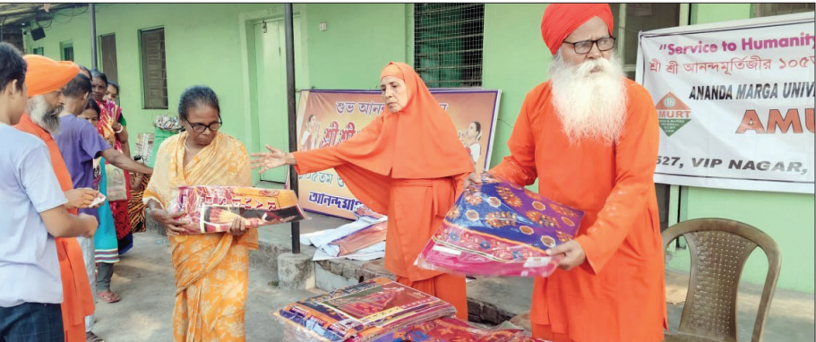
Ananda Marga Universal Relief Team (AMURT/AMURTEL) has distributed sarees to about 100 poor families in and around the Ananda Marga Ashram, at Vip Nagar, in Kolkata.