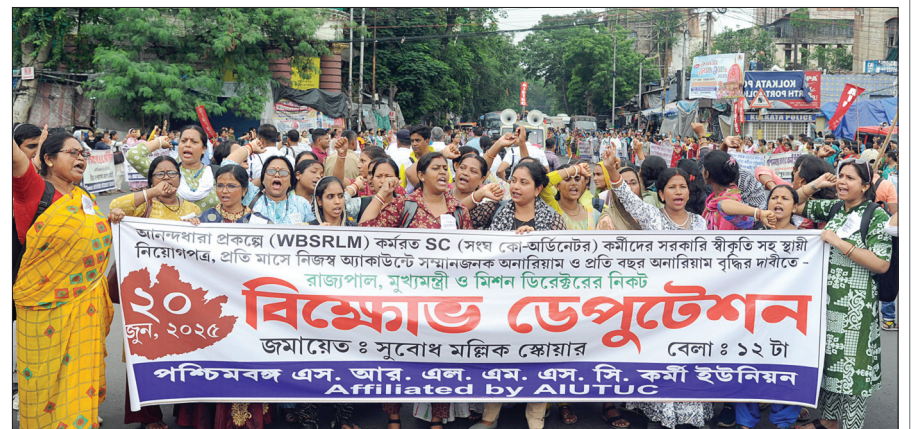
SC women workers stage a protest march from Subodh Mallick Square to Dharmatala, followed by the submission of deputations at Nabanna and Raj Bhavan, in Kolkata on Friday.