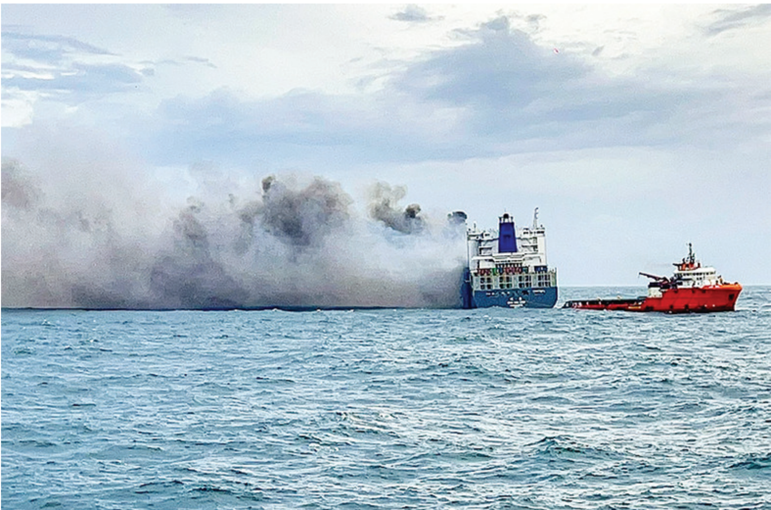
In this image via Indian Navy, the Indian Navy carries out operation to contain a fire aboard the ship MV Wan Hai 503, off the Kerala coast.

MI News Service, Sribhum/Guwahati: Five people were arrested with drugs worth Rs 6.5 crore in Assam's Sribhum district, Chief Minister Himanta Biswa Sarma said. Acting on intelligence inputs, police seized 44,000 yaba tablets from the Veterbond area and arrested the five suspected peddlers, he said. Sarma congratulated the police on the success of the operation.