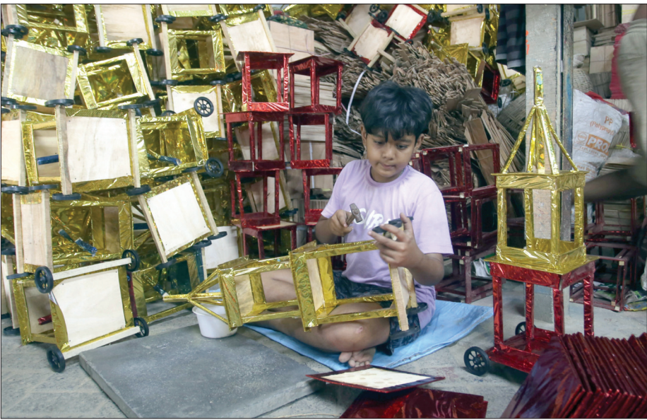
A little charriot maker prepares a charriot at a shop in Kolkata on Sunday ahead of Rathatra Festival.

MI News Service, Kolkata: Syama Prasad Mookerjee Port, Kolkata has commenced the financial year 2025-26 on an impressive note, registering a substantial growth of 27.56% in overall cargo throughput during April-May 2025 as compared to the same period last year. The Port successfully handled 11.252 million metric tonnes (MMT) of cargo during the first two months of FY 2025-26, up from 8.821 MMT handled during April-May 2024. Haldia Dock Complex (HDC) contributed 8.139 MMT, while Kolkata Dock System (KDS) handled 3.113 MMT. This compares to last year's figures of 6.386 MMT and 2.435 MMT at HDC and KDS respectively, resulting in impressive growth rates of 27.45% at HDC and 27.84% at KDS. The Port witnessed significant increases in specific cargo segments. HDC recorded notable growth in POL Products, Other Liquids, Vegetable Oil, Coking Coal, Other Coal, Metallurgical Coal, Fly Ash, Container