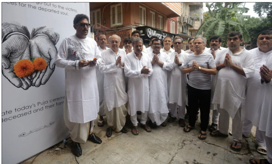
People pray for the lost souls who lost their lives in the recent Ahmedabad Plane crash during a 'Khuti Puj' in Kolkata on Sunday.

The department hopes the combination of technology, rapid response and community awareness will help minimise both damage and danger.