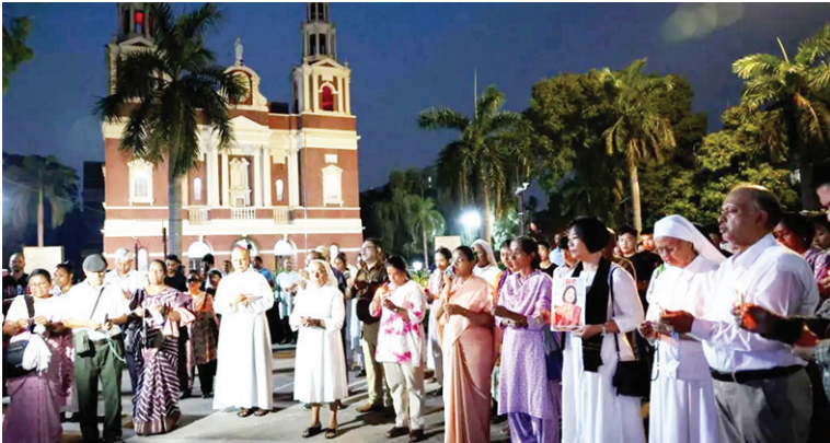
People praying for the lost souls who lost their lives in the recent plane crash at Ahmedabad.