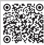
Scan to download RBI Retail Direct Mobile App