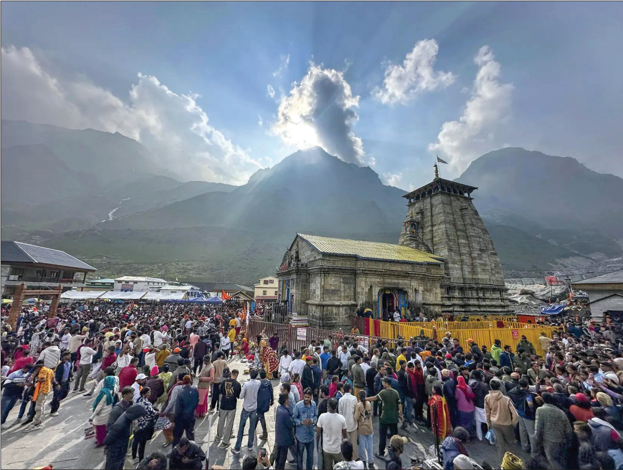
Devotees arrive in huge numbers at Kedarnath Temple at Rudraprayag district in Uttarakhand.