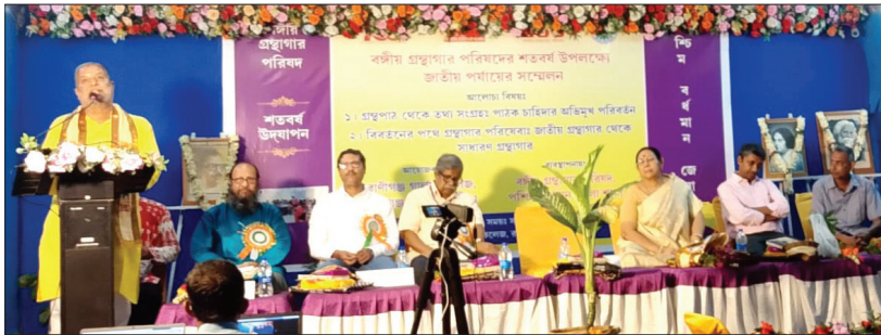
Centenary Celebration of Bengali Library Council