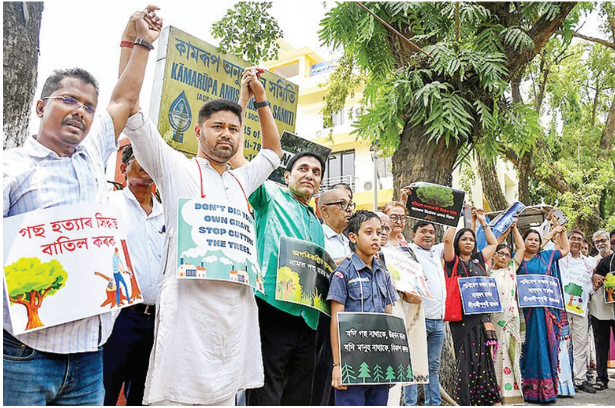
People form a human chain to protest against the Assam government over cutting of tress for construction of a flyover, in Guwahati.

The Israeli airstrikes were the "result of the direct support by Washington," Araghchi said in a statement carried by the state-run IRNA news agency. Iran launched its first waves of missiles at Israel late Friday and early Saturday. The attacks killed at least three people and wounded 174, two of them seriously, Israel said. The military said seven soldiers were lightly wounded when a missile hit central Israel, without specifying where. US ground-based air defence systems in the region were helping to shoot down Iranian missiles, said a U.S. official who spoke on condition of anonymity to discuss the measures.