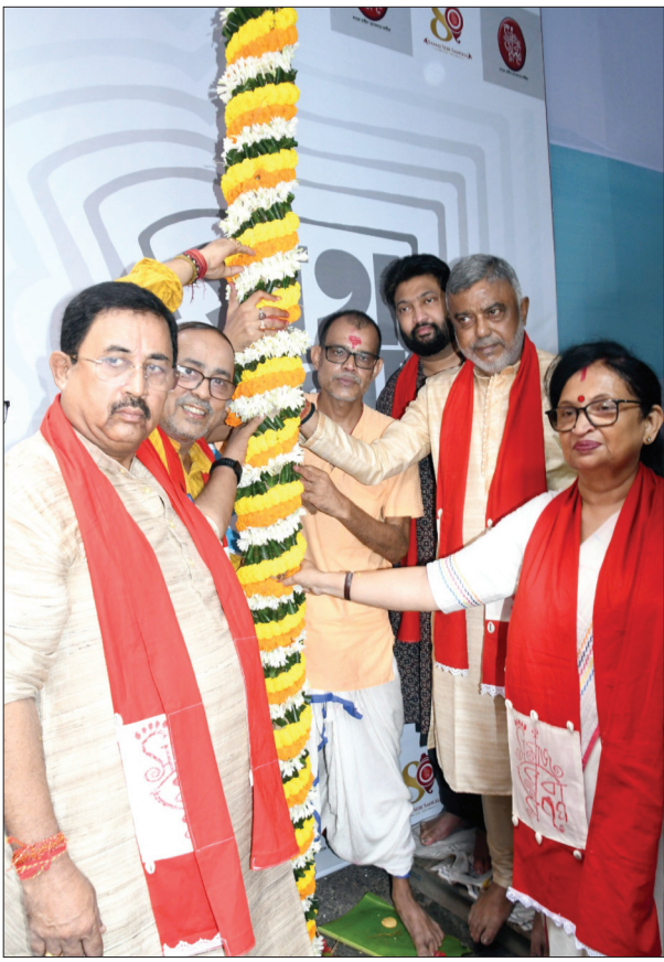
Eminent personalities from state government including TMC top brass participate in the auspicious 'Khuti Pujo' rituals for the 80th year celebration of Durga Pujo at the prestigious Samaj Sebi Sangha in South Kolkata.