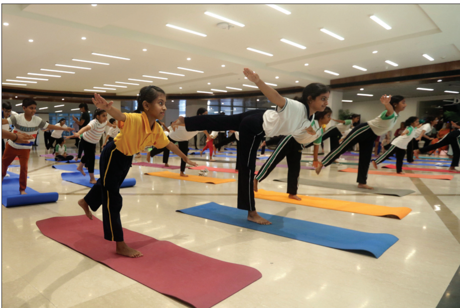
School Students participate in a Yogathon ahead of the 11th International Yoga Day in Kolkata on Sunday.

"My brother told his wife that some farmers in Bangladesh rescued him. He is so badly injured that he can't walk.